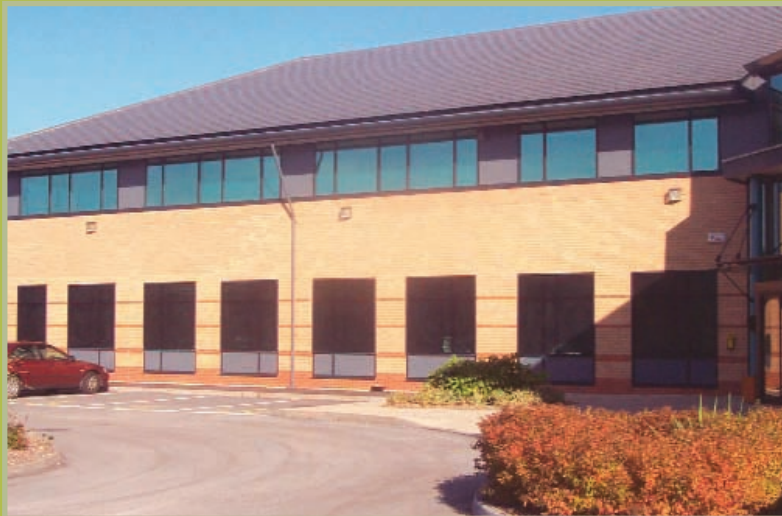
Crime Shield screens fitted to lower office windows to provide vandal and glass protection. HS Shoreshield type