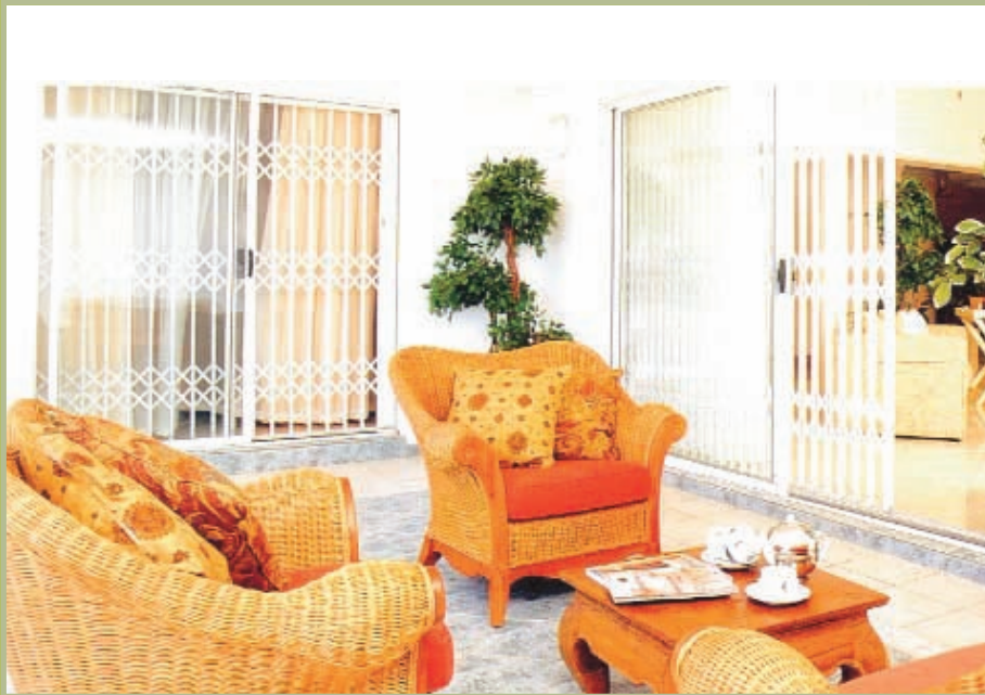
Residential installation of grille type HS1010