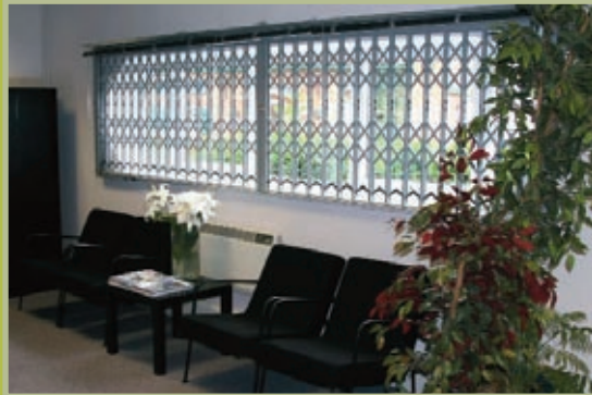
Internally mounted double sash Sliding Grille type HS1011, insurance rated grille to LPCB level1