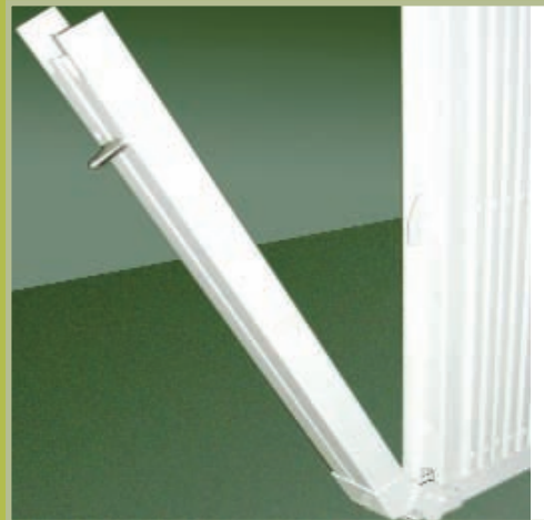
Hinge up track option to avoid trip hazard