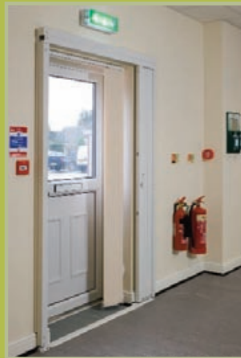
Doorway Grille opened