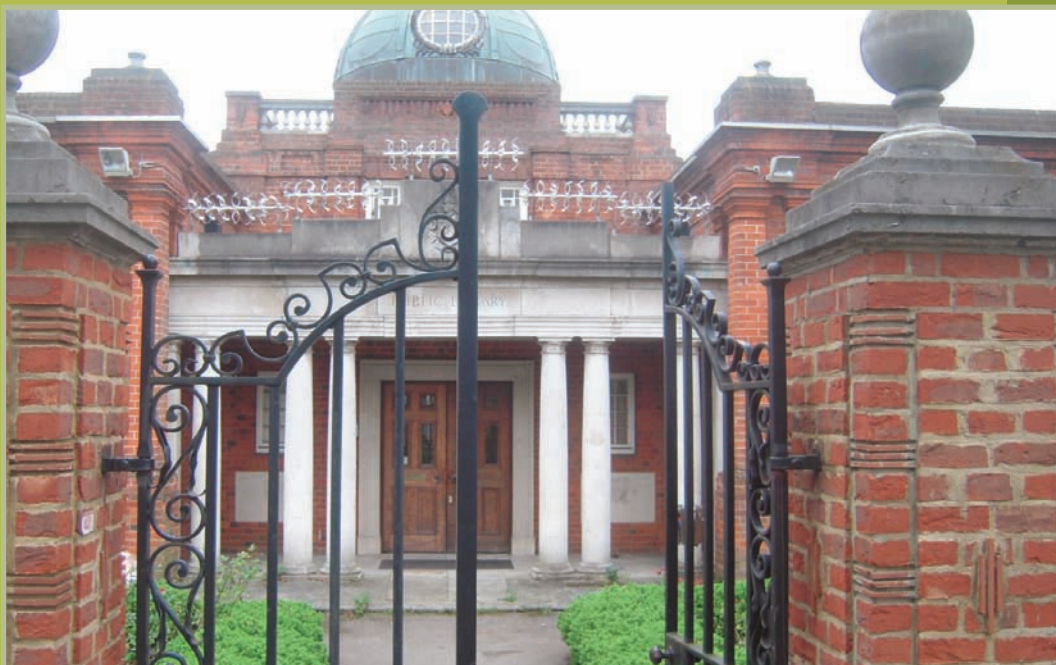
Anti Climb Spikes and Steel gate