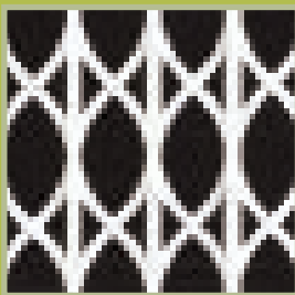
S lattice option for grilles