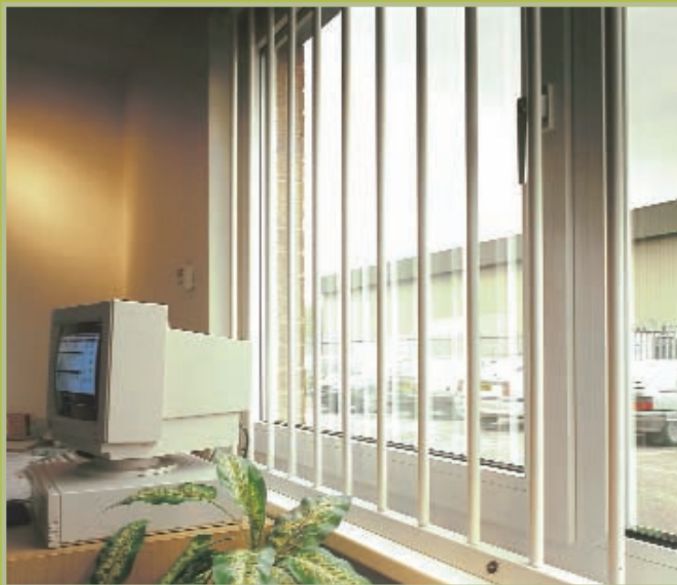
Burglar bars powder coated white, HS secure bar