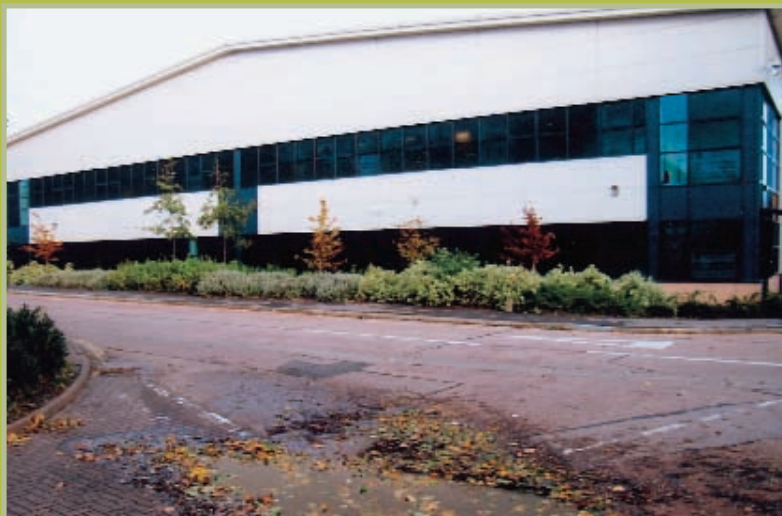
Crime Shield screens installed to commercial unit for glass protection, HS Shoreshield type