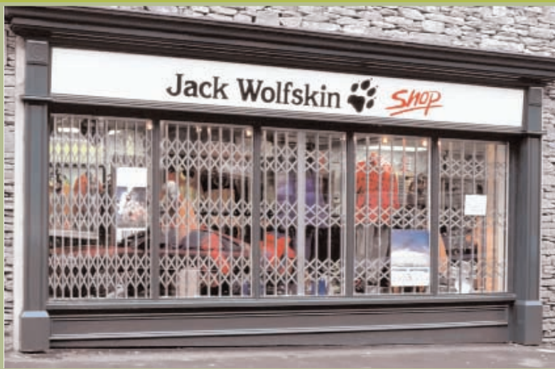
Retail Installation of Sliding Grille type HS1010, non insurance rated type