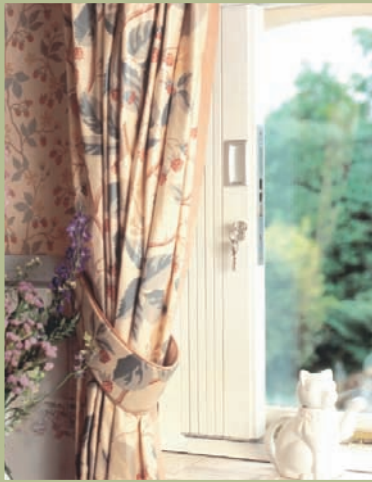
Sliding grille with 3 point locking system and aluminium flush handle. These are available as secured by design