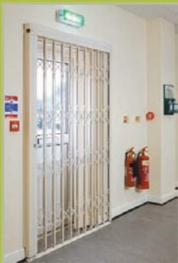
Doorway Grille closed type HS1011 (Insurance rated version)