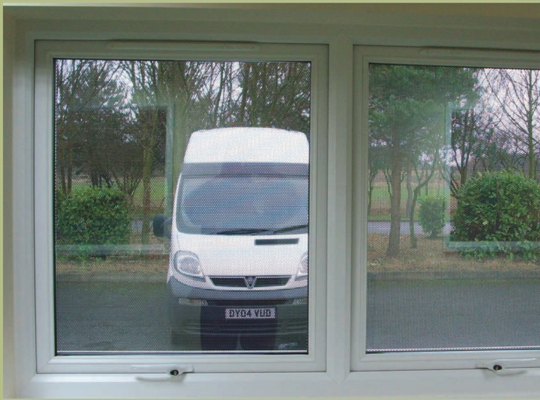
HS Shoresield screen viewed from inside