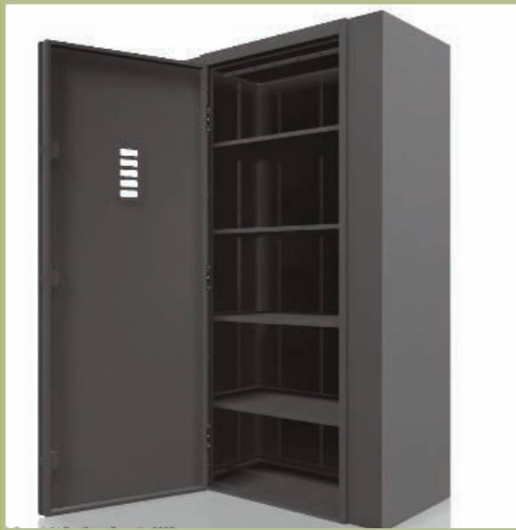
A lockable secure storage cage

Lockable Security Cages for storage of valuables, computer equipment and servers