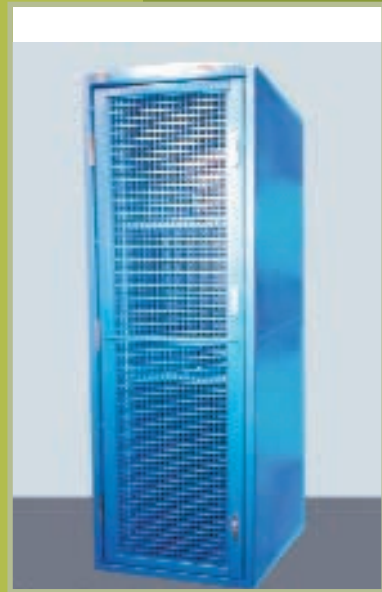
High security storage cage