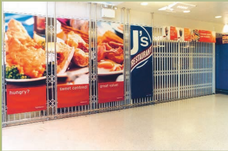
Large Sliding Grille type HS1010 (which is non insurance rated)