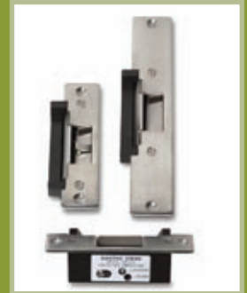
Electric strike lock