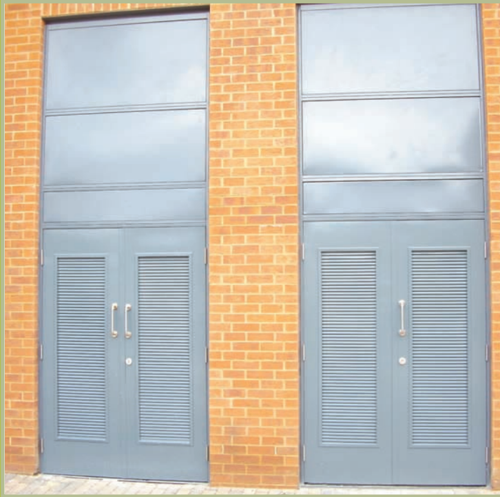
HS Raidor Steel Doors to Plant Rooms, Incorporating louvre panels