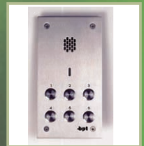
Intercom panel with keypad