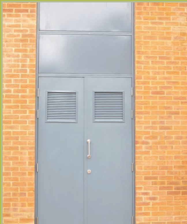
HS Raidor Steel doorset with small louvre panels inserted