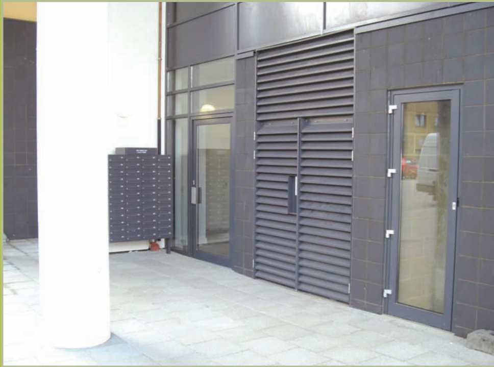
Fully louvered doors and fully glazed HS Raidor doorsets