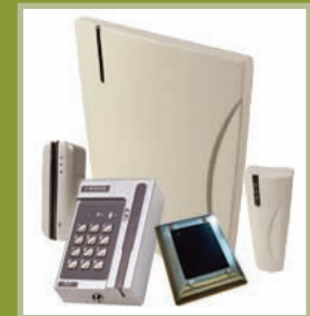
Readers and automation accessories