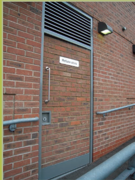
Bespoke steel door set with louvre panel and brick slips inserted