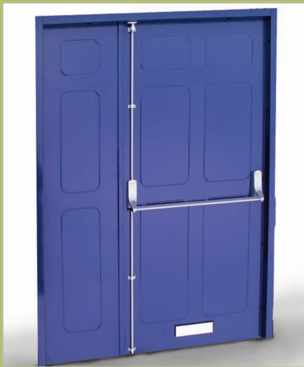
HS Decor Steel decorative panel door set with panic bar for exit, Incorporating a letterbox