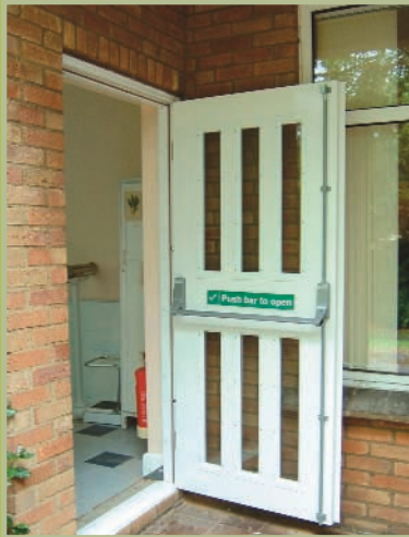
Doors made to measure for domestic installation, HS Raidor, Glazed