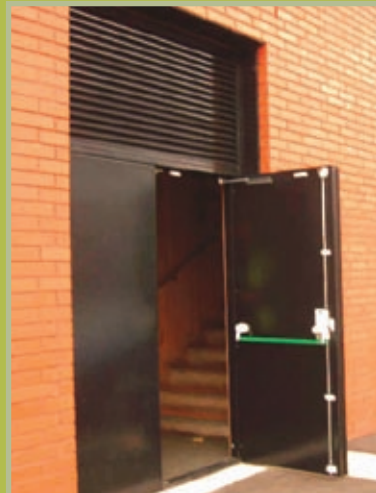
Fire escape door HS Raidor type with louvre panels above