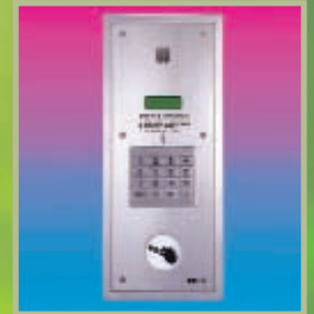
Digital Intercom panel