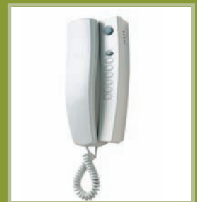
Internal handset for an Intercom system