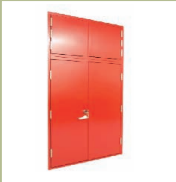
HS Raidor type Sub station doors with removable transom, openable overpanel and fire rated