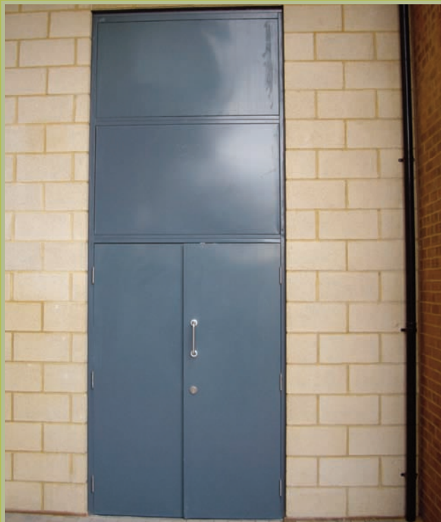
HS Raidor, Solid Steel Doors with Double over panel, fire rated