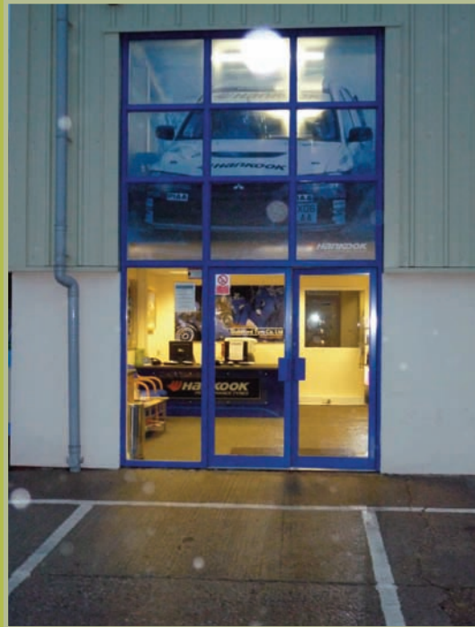
Glass door and shop front