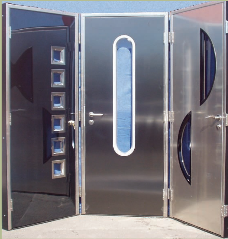
Stainless steel doors with vision panel options