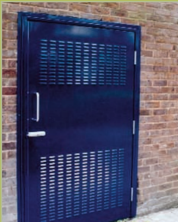
HS Raidor type Sub station doors, vented option