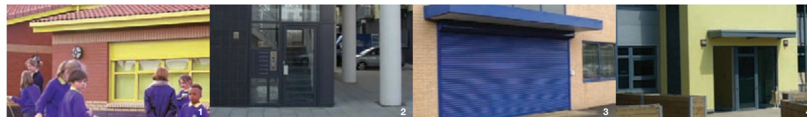
1. Roller shutter for window protection 2. Entrance door with access control 3. Roller shutter to main entrance 4. Glazed entrance door and screen