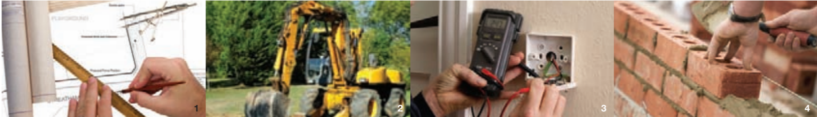
1. School fencing plans 2. Excavations 3. Testing and commissioning 4. Boundary wall