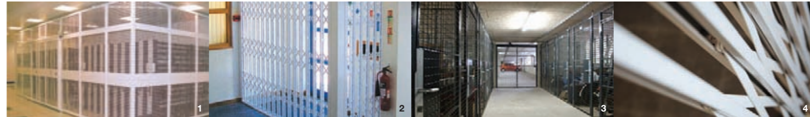
1. Server cage 2. Security grilles 3. Bike storage cages 4. Sliding grille