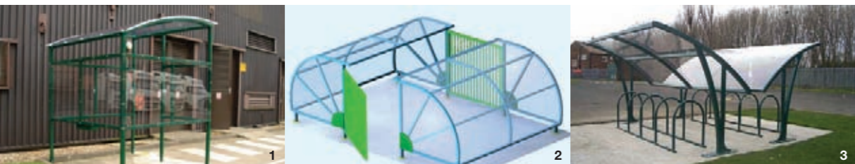
1. Smoking shelter 2. Bespoke bike shelter 3. Covered bike racks