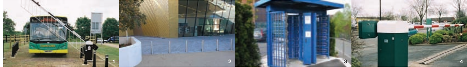
1. Automatic barrier 2. Bollards 3. Turnstile 4. Entrance barrier