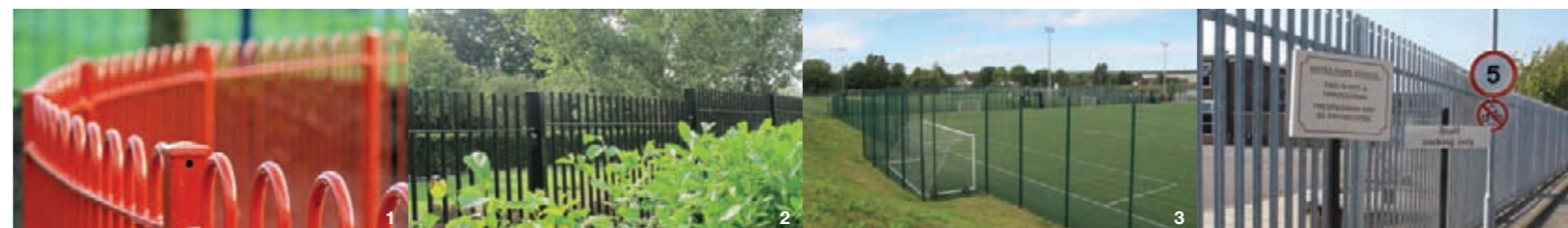
1. Bow top railings 2. Railing type fencing 3. Sports mesh fencing 4. Palisade fencing