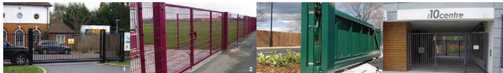
1. Automatic sliding gate 2. Mesh gates and fencing 3. Manual sliding gate 4. Manually operated swing gates