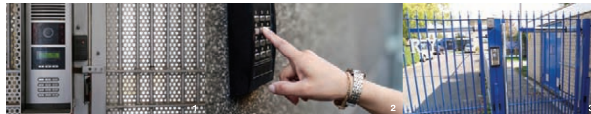
1. Video entry 2. Keypad 3. Intercom to gate