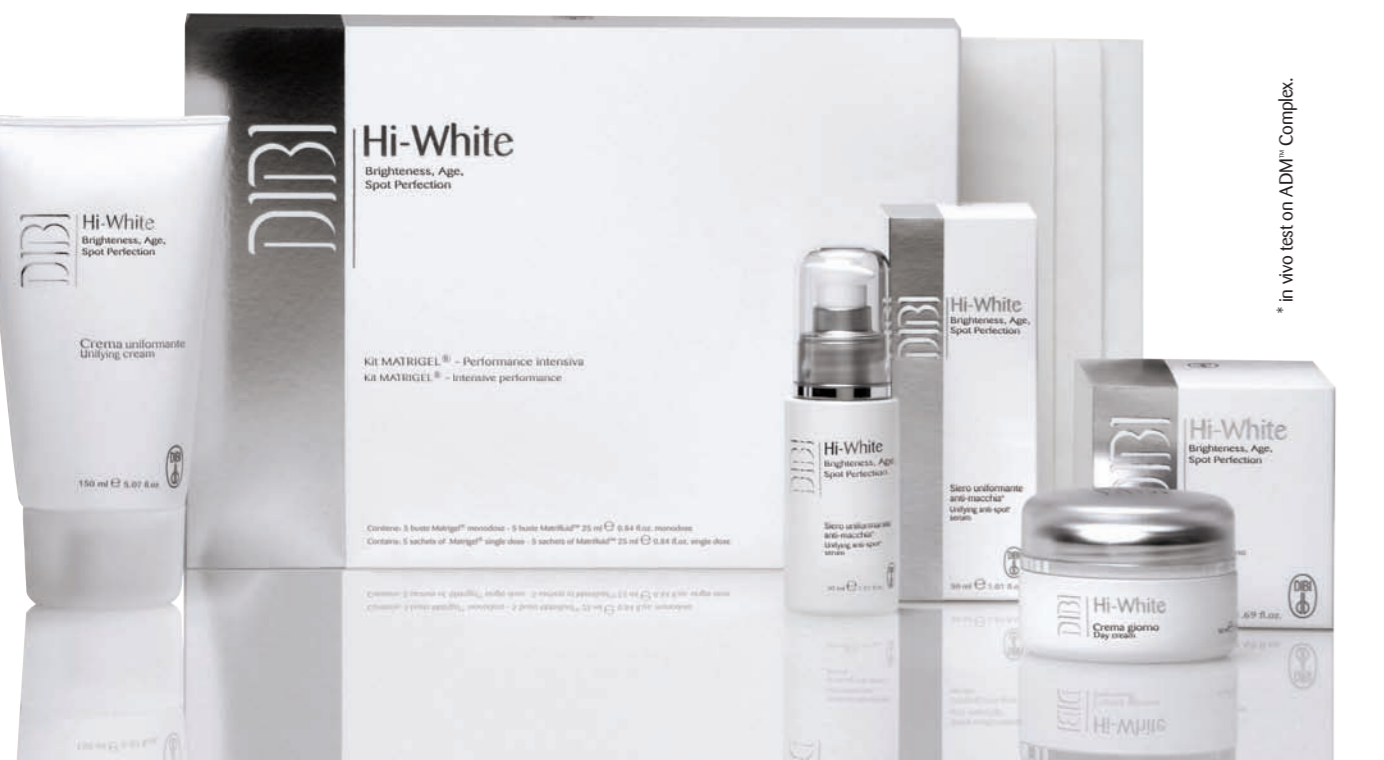
* in vivo test on ADM® Complex

Saccharide Isomerate, derivative of Azelaic Acid, Hyaluronic Acid, Microencapsulated Glycyrrhiza Glabra, Lupinus Albus Extract, Vitamin C, Soft Focus effect Particles.