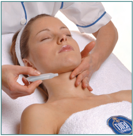
Apply a thin layer of INTENSIVE REHYDRATING MASK onto the face, neck and décolleté using a brush, and leave on for 15 minutes.