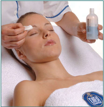
Massage the ULTRA-COMFORT QUENCHING CLEANSER onto the face, neck and décolleté and cleanse using disposable gloves moistened with warm water.