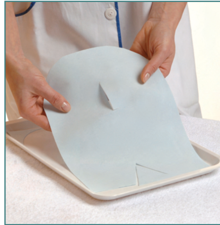
Carefully remove all traces of make-up with DECODERM CLEANSING LOTION and EYE&LIP MAKE-UP REMOVER .