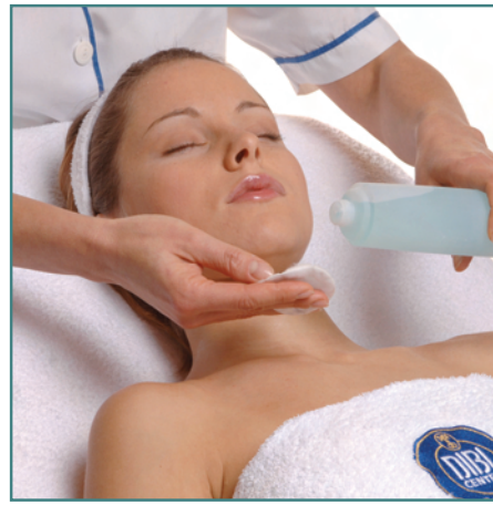
Apply the INTENSIVE REHYDRATING SERUM and massage into the face, neck and décolleté until it is completely absorbed. Apply a few drops of NUOVAPELLE EYE CONTOUR FLUID around the eyes. Then apply the NUOVAPELLE EYE CONTOUR MASK .