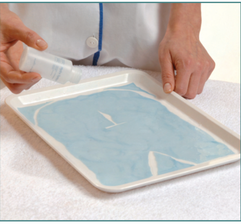
Remove the INTENSIVE REHYDRATING MASK with the disposable gloves. Apply the NUOVAPELLE EYE CONTOUR CREAM .