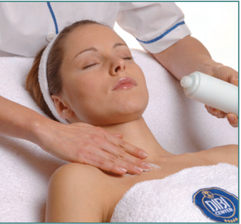
Dab the QUENCHING TONIC LOTION onto the face, neck and décolleté with two cotton balls.