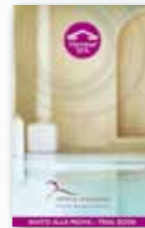
SAMPLE HOLDER WITH 2 TESTER SACHETS BALNEUM AND CREMAE