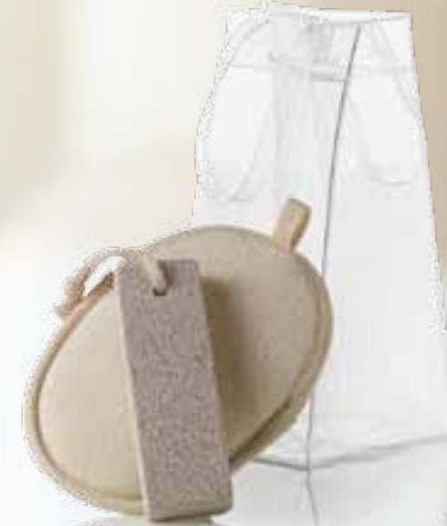
THERMAE SPA KIT