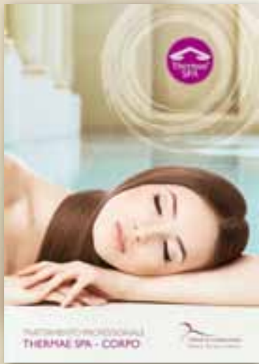
GUIDE TO THE TREATMENT