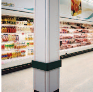
C/S Acrovyn® Wall, Door and Corner Protection