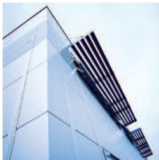
C/S Airfoil® Solar Shading Systems