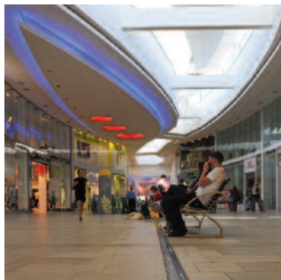
C/S Allway® Expansion Joint Covers