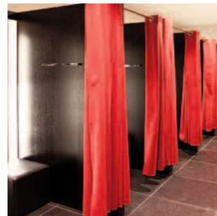
C/S Supertrak® Cubicle Curtain Track