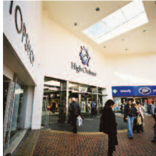
C/S Wallglaze® Specialist Coatings for Walls and Floors