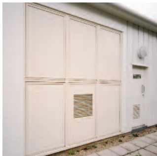
C/S Explovent® Explosion Venting Systems