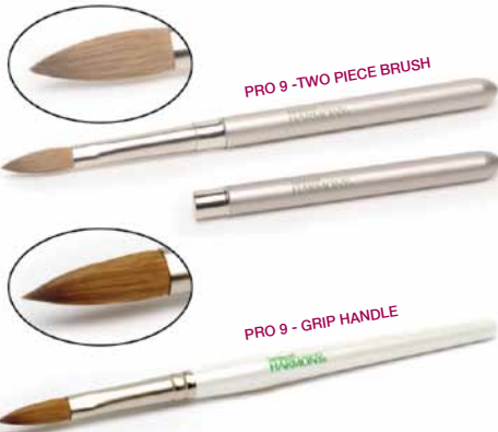
PRO 9 - TWO PIECE BRUSH