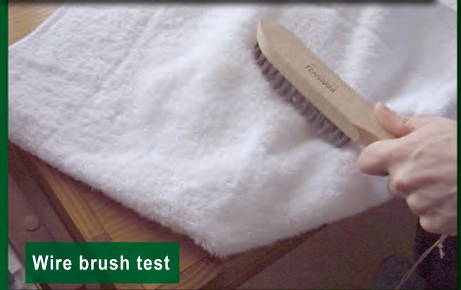
Wire brush test

Energy Saver! Reduce Energy up to 40% and Water by 15%