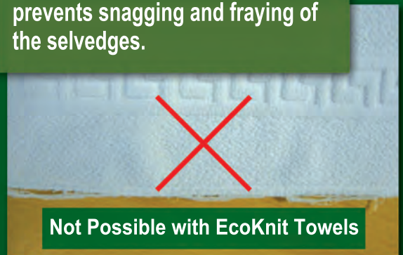
Not Possible with EcoKnit Towels

The unique construction allows the towel to expel water quickly and prevents snagging and fraying of the selvages.