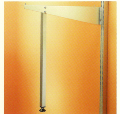
650mm heavy duty bracket with adjustable leg