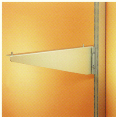
Heavy duty bracket