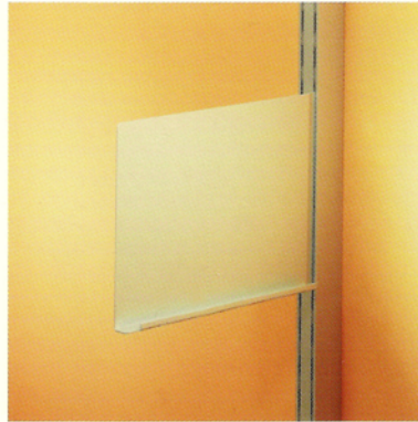
Extended bookend bracket