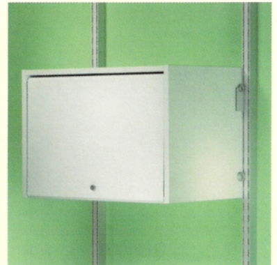
Cupboard with up & over door