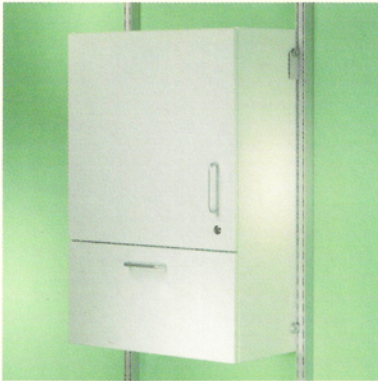
Single hinged door with 300mm drawer under, white door fronts