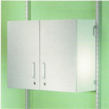
750mm wide two door cupboard, light grey doors