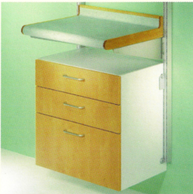
Three drawer unit, peer classic fronts