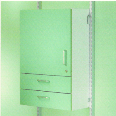
Single hinged door with two 150mm drawers under, velvet green door fronts