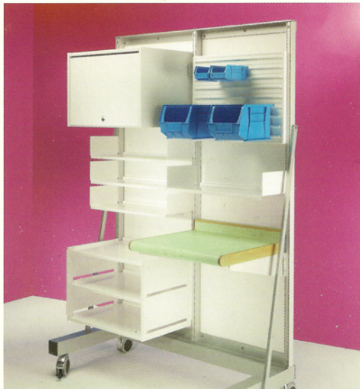
Example of Toprail components hung onto the mobile unit

30.106 Island unit 2 x 750mm bay sgl sided