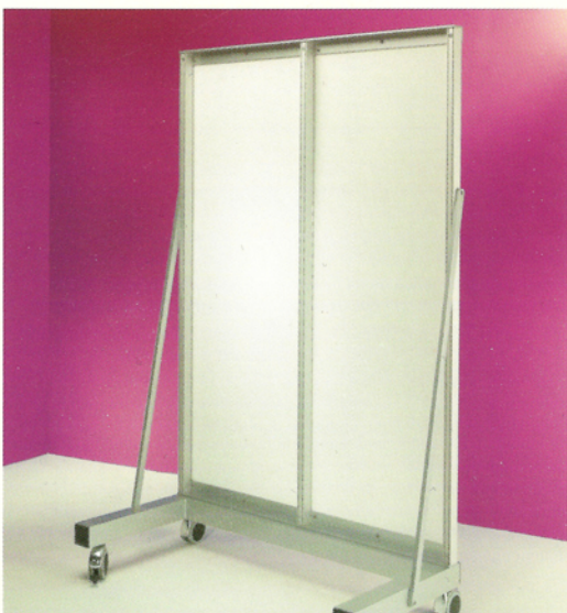
Mobile Unit ready to accept the required furniture