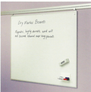
Magnetic dry marker board