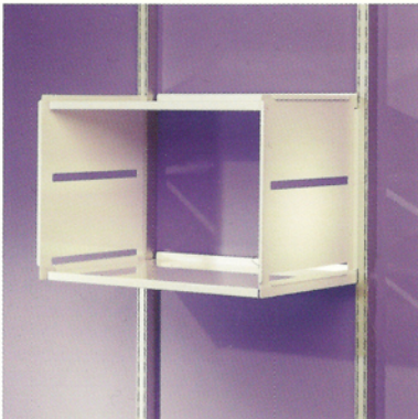
Bulk storage unit