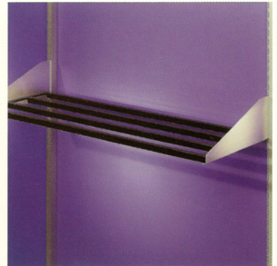
Wire basket support frame with aluminium brackets