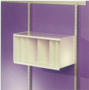
Open storage unit