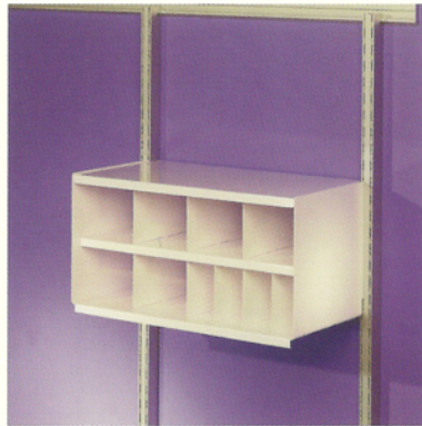
Open storage unit with fixed centre divider