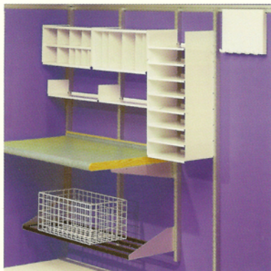
Wire basket and open storage unit combined with shelves and worktop