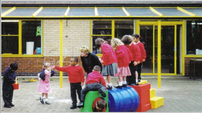
Lean-to Meridian Canopies outside two schools.