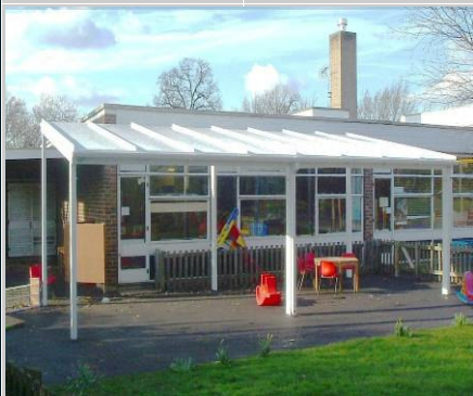
Freestanding Meridian Canopies positioned adjacent to the schools, where the buildings do not have either sufficient height or structure to support a standard lean-to Meridian.