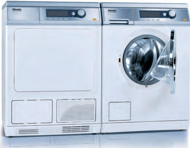
The PW 5064 is part of the Little Giant range of washing machines and tumble dryers.