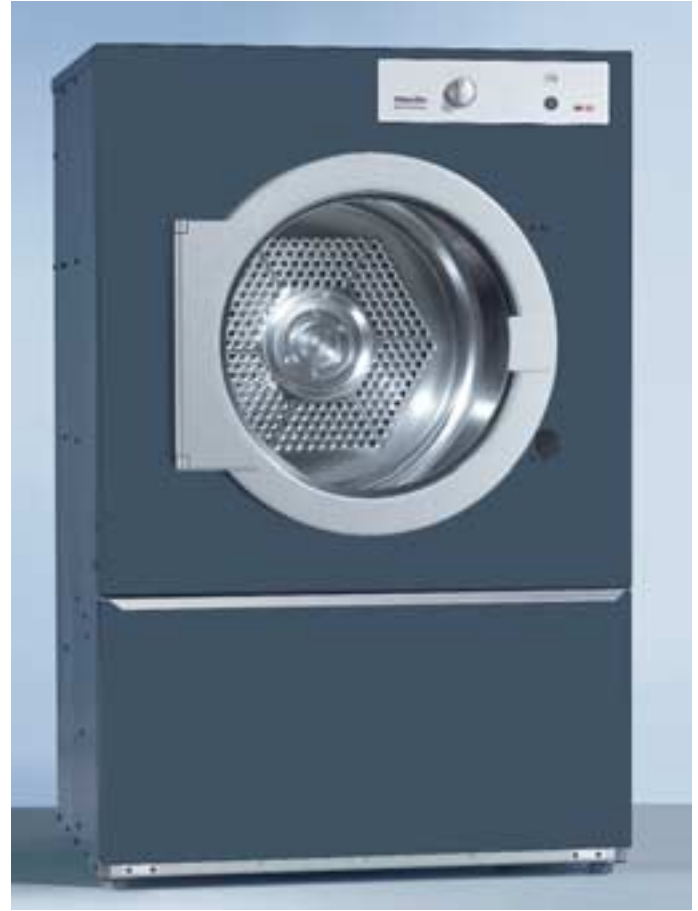
Illustration: PT 5351 (octo blue)