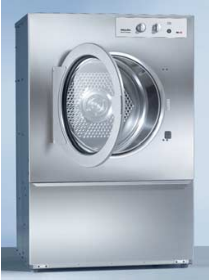
Illustration: PT 5251 (stainless steel option)