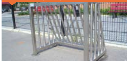
4020 MULTI GOAL 3.1 x 1.1 x 4 M