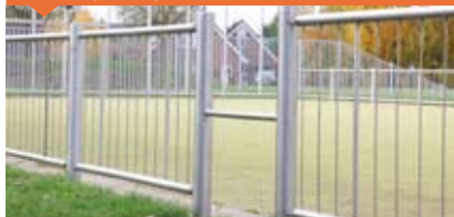
ROOF NET - ONLY WHEN 4 M HIGH