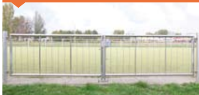
CORNER SLUICE (TIMES NUMBER OF CORNERS)