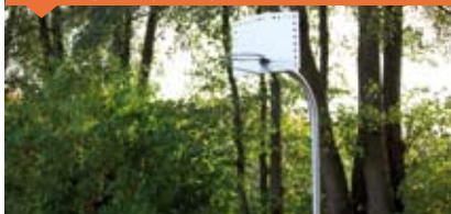
SERVICE WICKET DOOR LOW 3 / 4 M WIDE