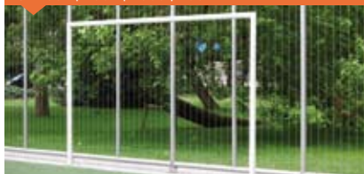
1209 CRUIJFF GOAL 5X2 METRES