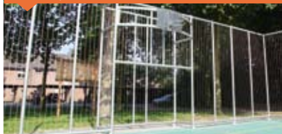
1181 BASKETBALL POST GAME MODEL