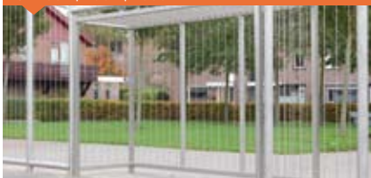
1208 COMBI GOAL TYPE ZUID-OOST