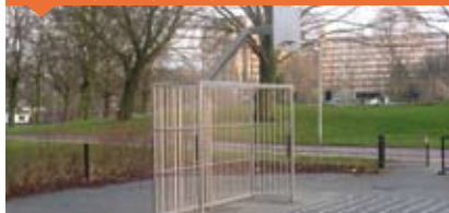
1206 DEMOUNTABLE PORTAL GOAL 4 x 2.5 M