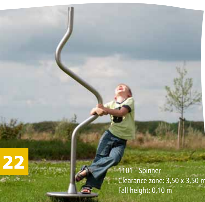
1101 - Spinner Clearance zone: 3,50 x 3,50 m Fall height: 0,10 m