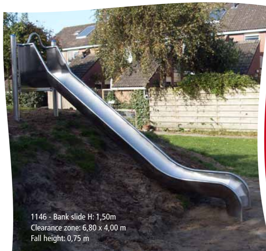
1146 - Bank slide H: 1,50m Clearance zone: 6,80 x 4,00 m Fall height: 0,75 m