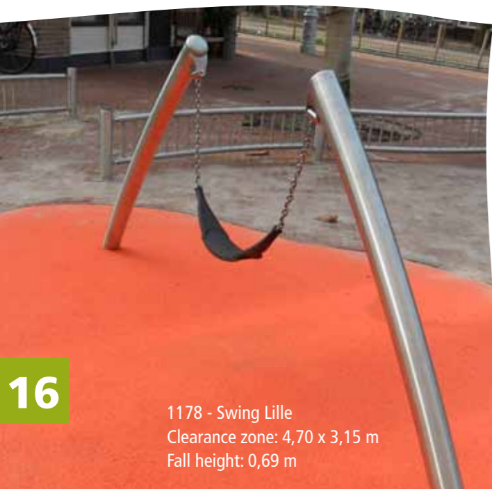
1178 - Swing Lille Clearance zone: 4,70 x 3,15 m Fall height: 0,69 m