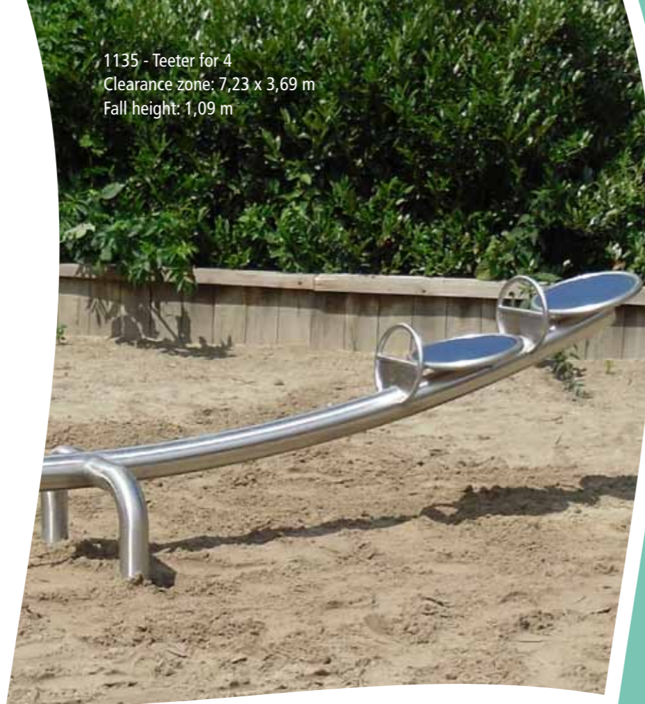
1135 - Teeter for 4 Clearance zone: 7,23 x 3,69 m Fall height: 1,09 m

Whether the seesaw is on a spring or on a pivot, seesawing provides hours of fun. A challenge as every seesaw has its own particular look and is therefore suitable for any theme imaginable.