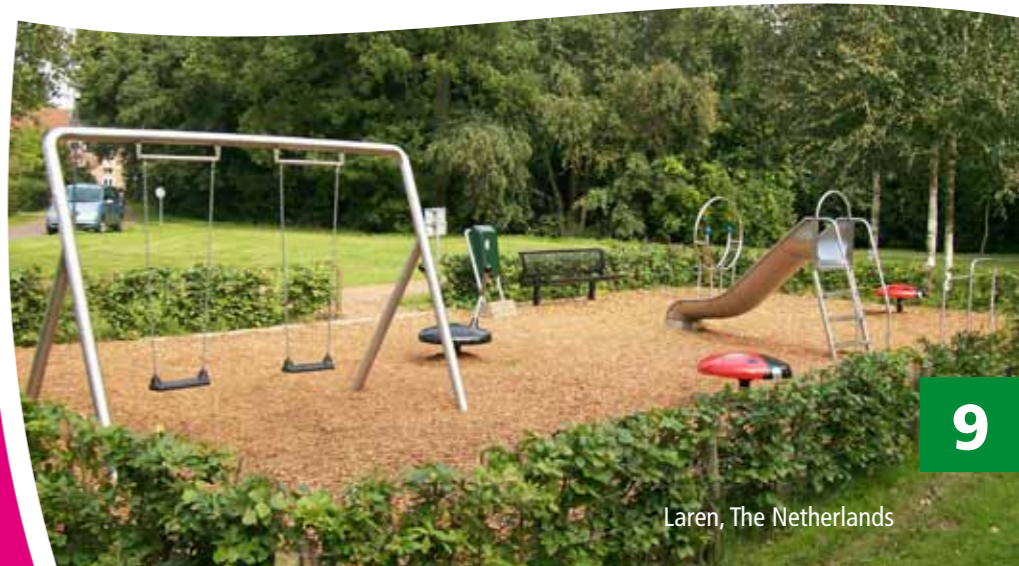
Laren, The Netherlands