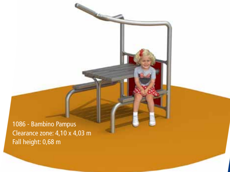
1086 - Bambino Pampus Clearance zone: 4,10 x 4,03 m Fall height: 0,68 m

A series of playground equipment for the very smallest children, especially geared towards the needs and development of children up to 6 years of age.