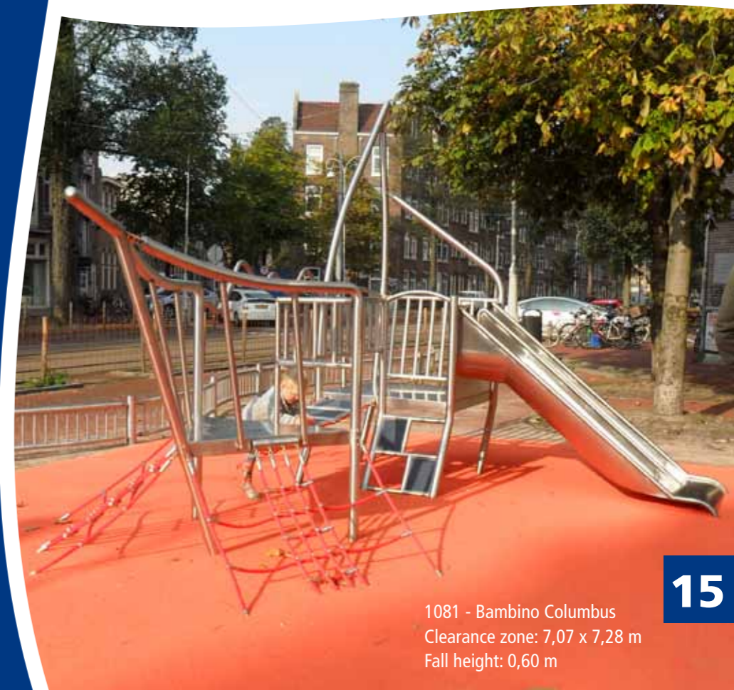
1081 - Bambino Columbus Clearance zone: 7,07 x 7,28 m Fall height: 0,60 m