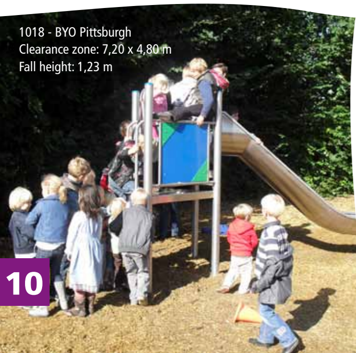
1018 - BYO Pittsburgh Clearance zone: 7,20 x 4,80 m Fall height: 1,23 m