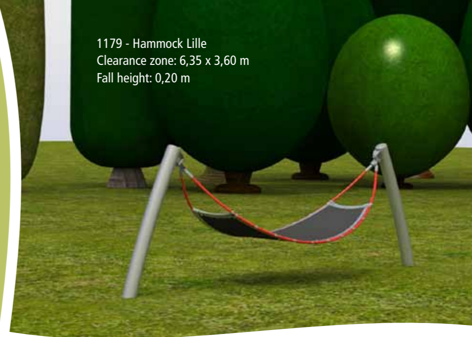
1179 - Hammock Lille Clearance zone: 6,35 x 3,60 m Fall height: 0,20 m