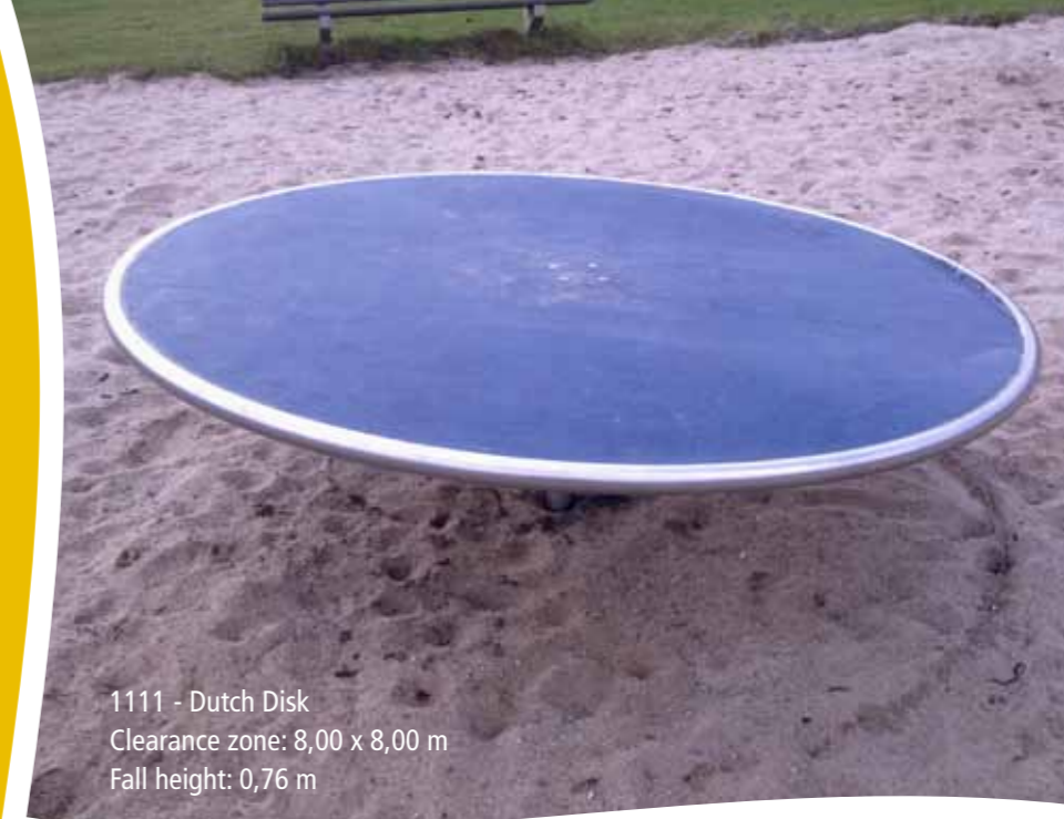
1111 - Dutch Disk Clearance zone: 8,00 x 8,00 m Fall height: 0,76 m