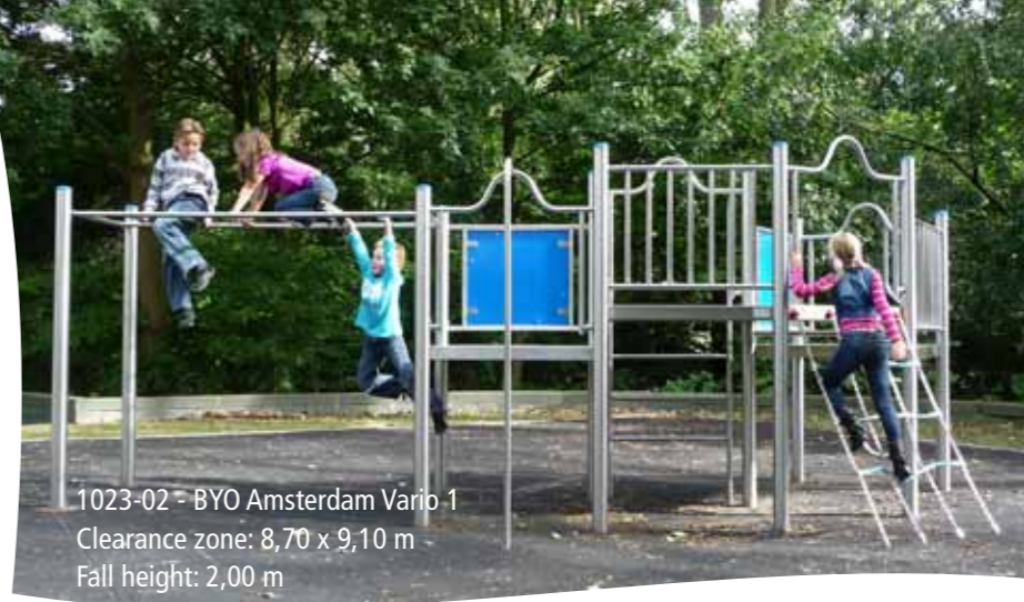
1023-02 - BYO Amsterdam Vario 1 Clearance zone: 8,70 x 9,10 m Fall height: 2,00 m