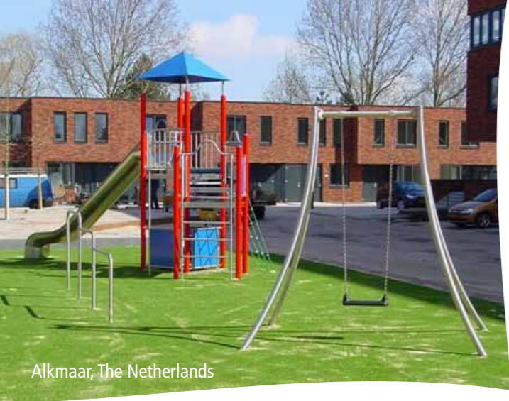
Alkmaar, The Netherlands