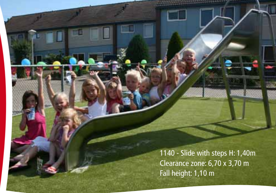
1140 - Slide with steps H: 1,40m Clearance zone: 6,70 x 3,70 m Fall height: 1,10 m