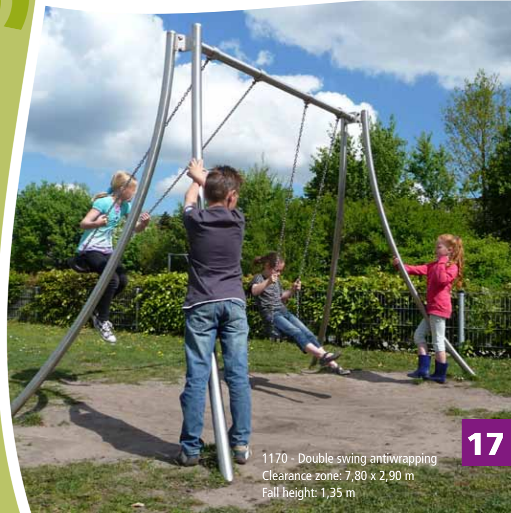
1170 - Double swing antiwrapping Clearance zone: 7,80 x 2,90 m Fall height: 1,35 m