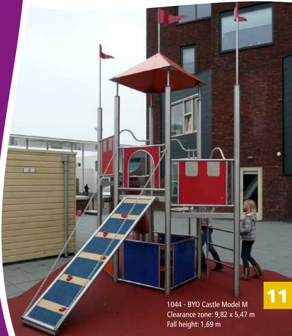
1044 - BYO Castle Model M Clearance zone: 9,82 x 5,47 m Fall height: 1,69 m