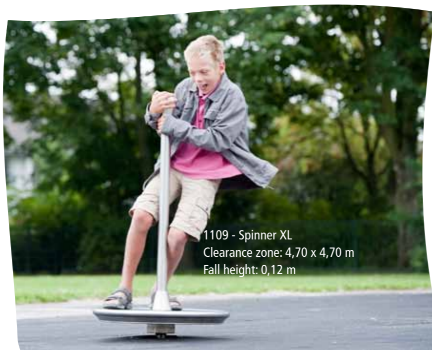
1109 - Spinner XL Clearance zone: 4,70 x 4,70 m Fall height: 0,12 m