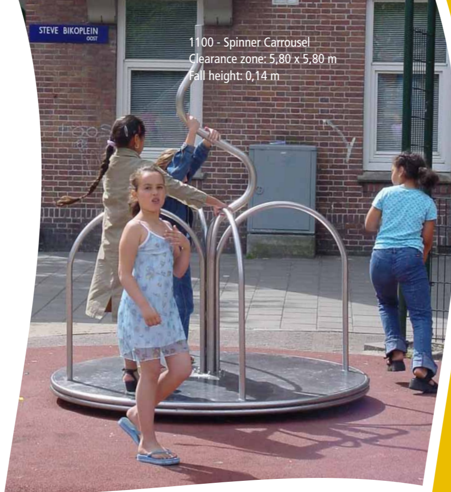
1100 - Spinner Carrousel Clearance zone: 5,80 x 5,80 m Fall height: 0,14 m

For every age group IJlander has challenging revolving equipment, from a charming small spinning top to a large revolving climbing globe! Revolving equipment is therefore available for every age group.