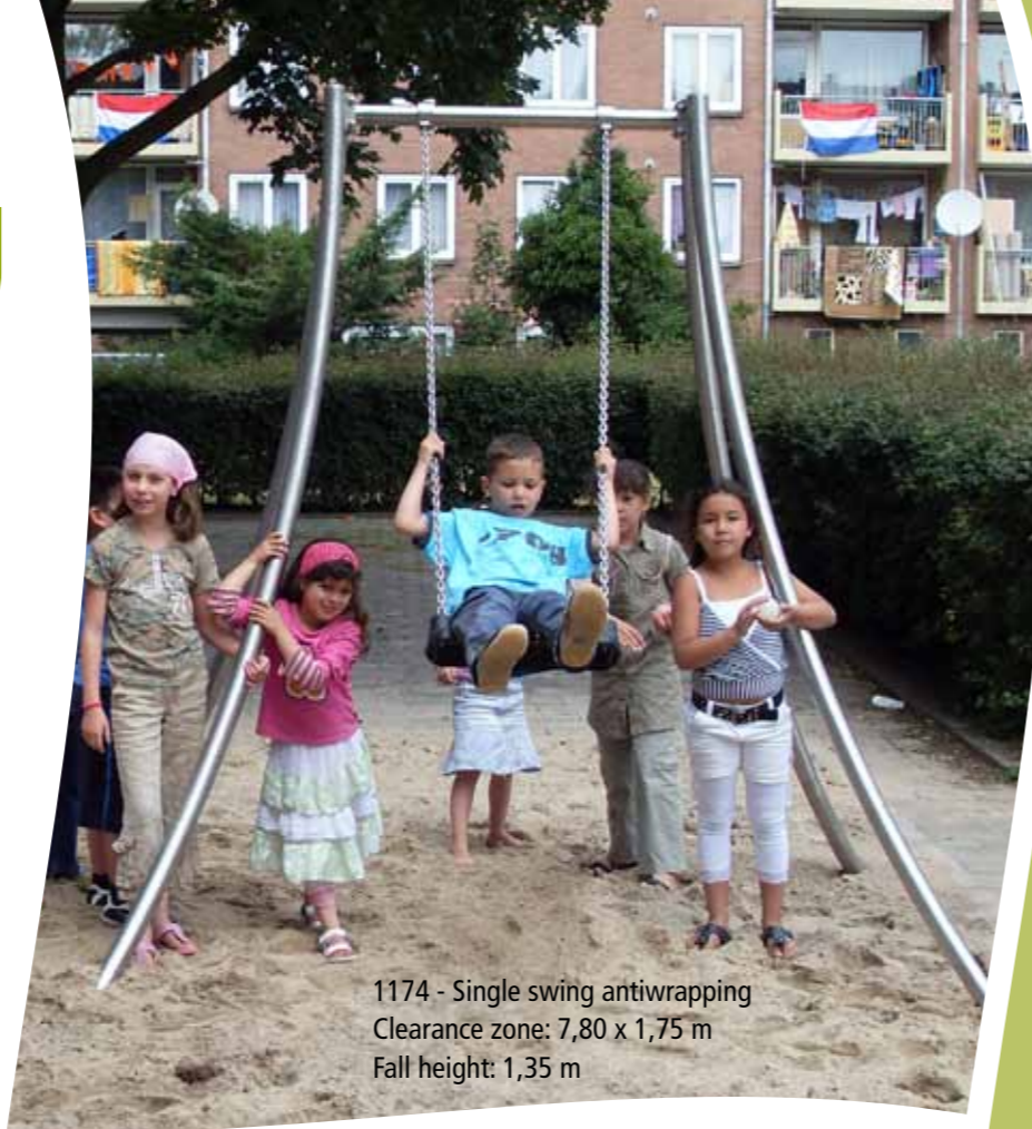
1174 - Single swing antiwrapping Clearance zone: 7,80 x 1,75 m Fall height: 1,35 m

A selection of the swings. In every playground corner where this element of play is used, the high-quality bearing constructions guarantee the long life of the equipment.