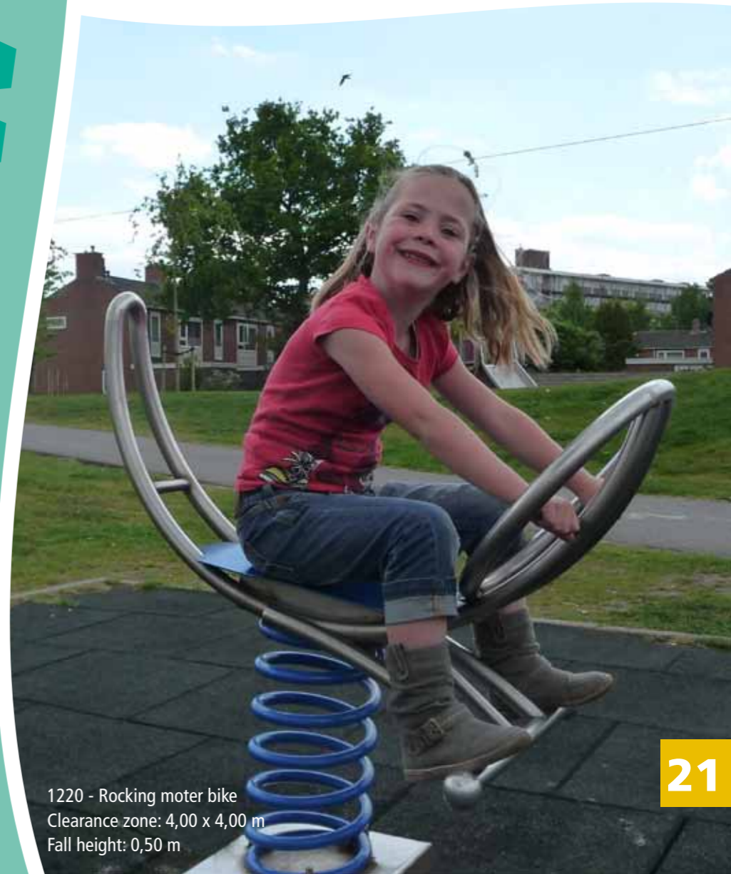
1220 - Rocking moter bike Clearance zone: 4,00 x 4,00 m Fall height: 0,50 m