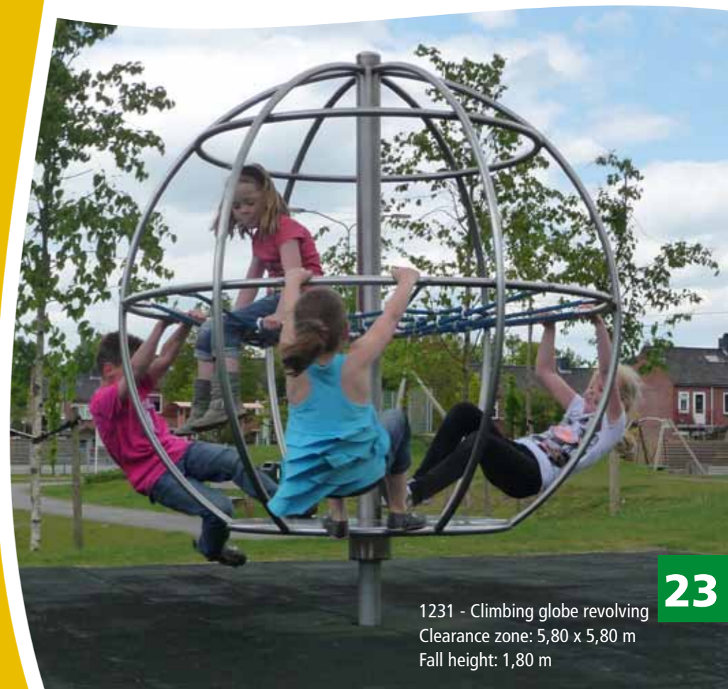
1231 - Climbing globe revolving Clearance zone: 5,80 x 5,80 m Fall height: 1,80 m