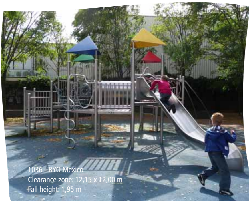
1036 - BYO Mexico Clearance zone: 12,15 x 12,00 m Fall height: 1,95 m