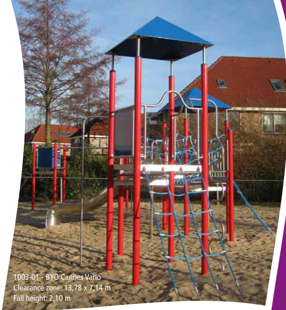
1003-01 - BYO Cannes Vario Clearance zone: 13,78 x 7,14 m Fall height: 2,10 m

This series of modular playground equipment with its extensive possibilities guarantees unlimited hours of fun with many challenges!