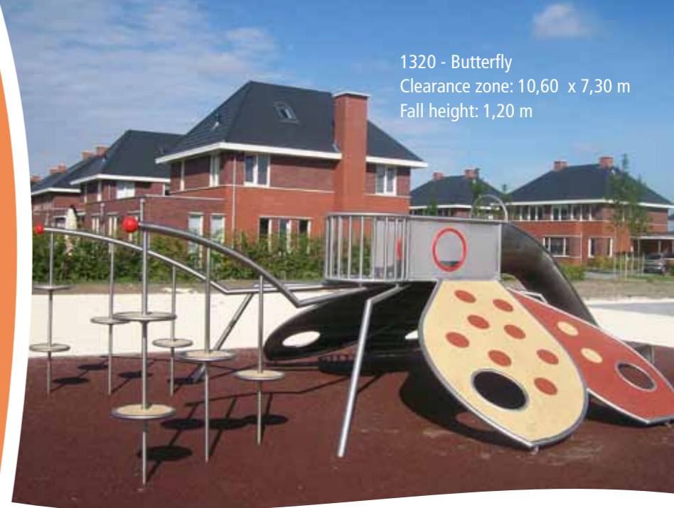
1320 - Butterfly Clearance zone: 10,60 x 7,30 m Fall height: 1,20 m