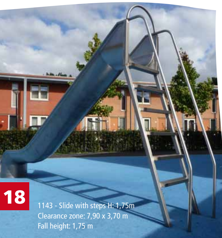
18 1143 - Slide with steps H: 1,75m Clearance zone: 7,90 x 3,70 m Fall height: 1,75 m