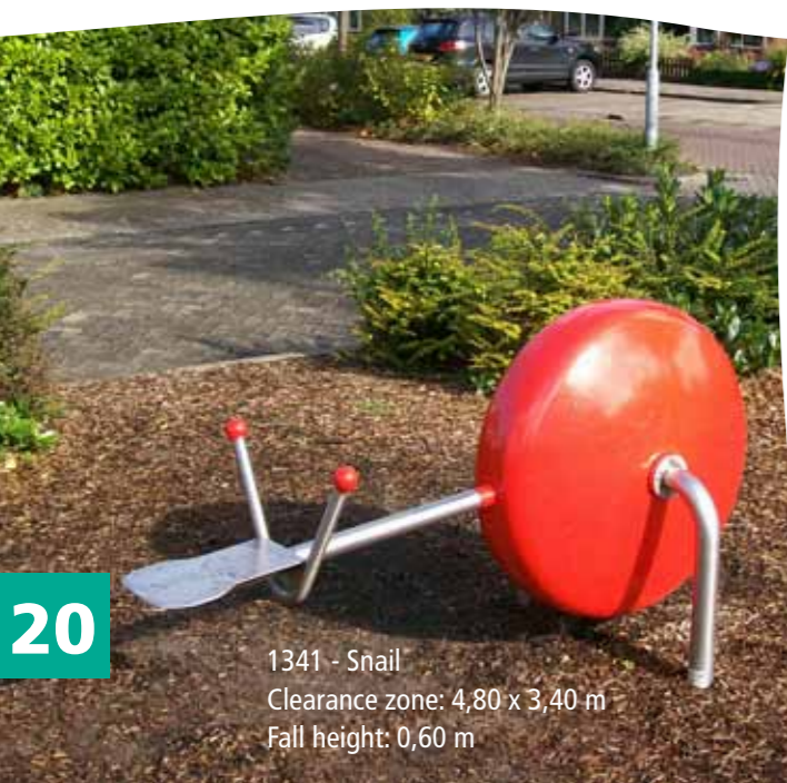
1341 - Snail Clearance zone: 4,80 x 3,40 m Fall height: 0,60 m