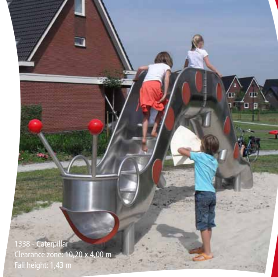
1338 - Caterpillar Clearance zone: 10,20 x 4,00 m Fall height: 1,43 m

For every play area there is a suitable slide. Children of all ages enjoy this play element, and so a slide can be found in practically every playground.