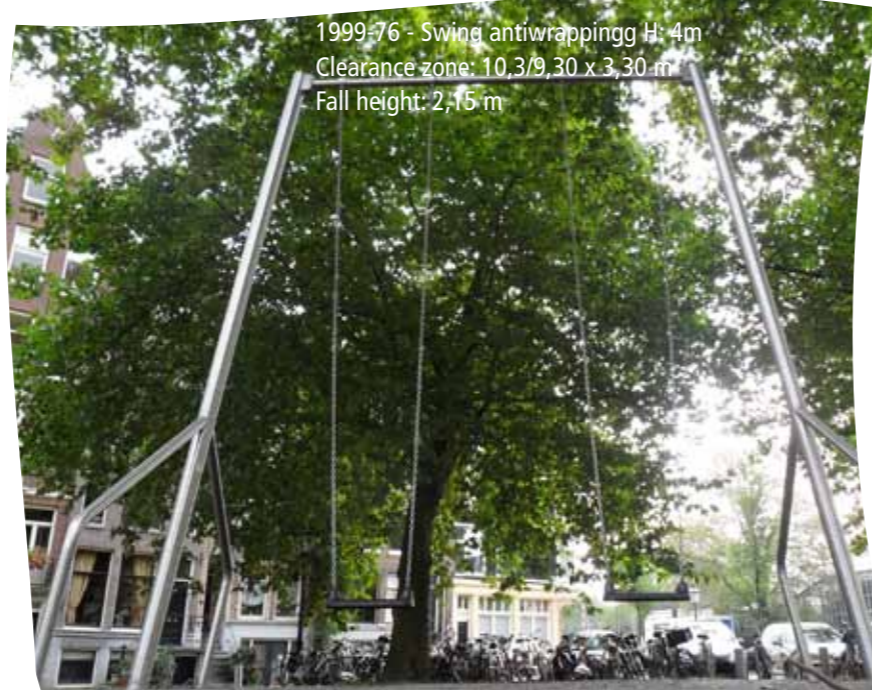
1999-76 - Swing antiwrappingg H: 4m Clearance zone: 10,3/9,30 x 3,30 m Fall height: 2,15 m