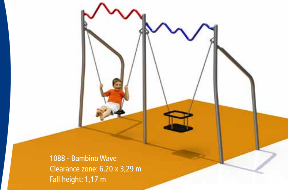
1088 - Bambino Wave Clearance zone: 6,20 x 3,29 m Fall height: 1,17 m