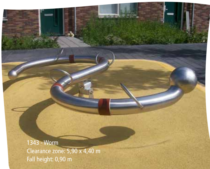
1343 - Worm Clearance zone: 5,90 x 4,40 m Fall height: 0,90 m