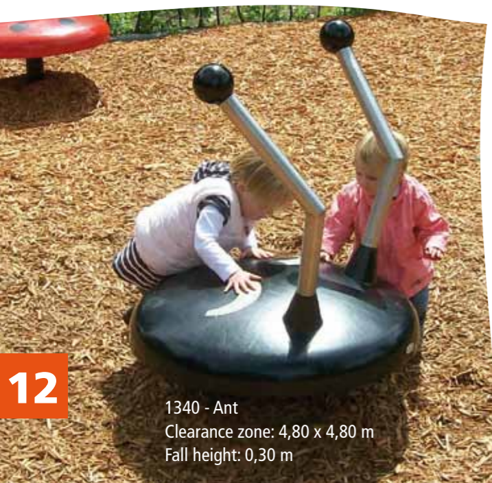
1340 - Ant Clearance zone: 4,80 x 4,80 m Fall height: 0,30 m