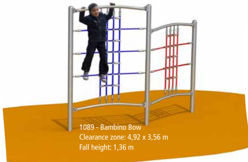
1089 - Bambino Bow Clearance zone: 4,92 x 3,56 m Fall height: 1,36 m