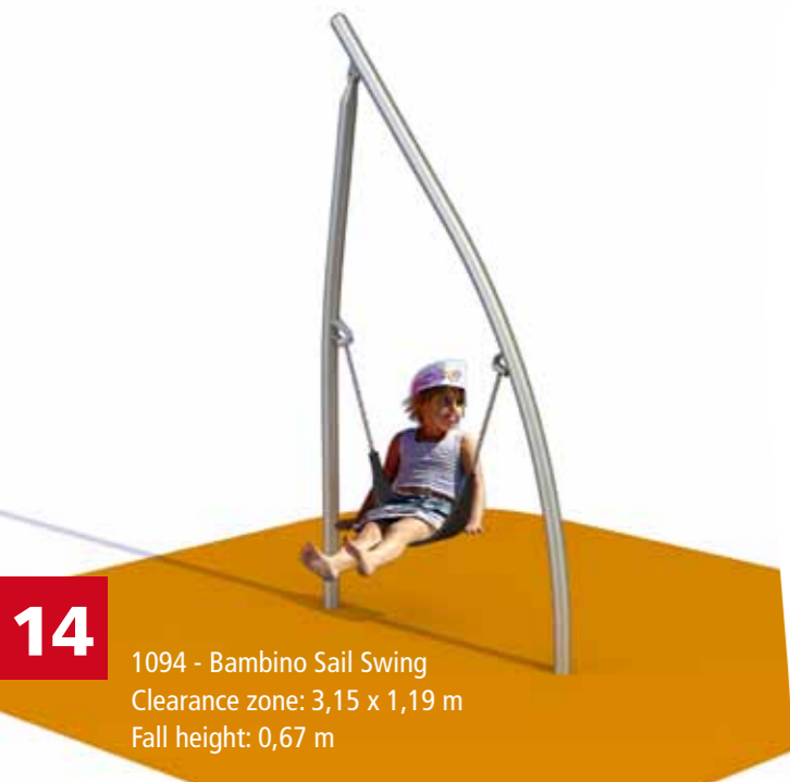
1094 - Bambino Sail Swing Clearance zone: 3,15 x 1,19 m Fall height: 0,67 m