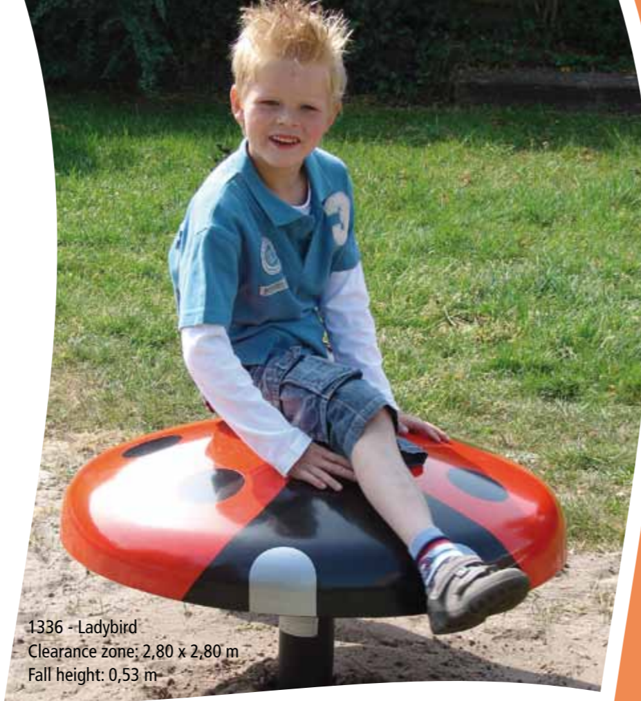
1336 - Ladybird Clearance zone: 2,80 x 2,80 m Fall height: 0,53 m

Contemporary equipment that reflect the extensive animal kingdom. A wide range of equipment that encourages children to use their imagination and develop their skills.