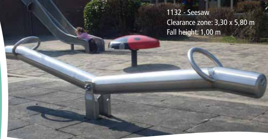
1132 - Seesaw Clearance zone: 3,30 x 5,80 m Fall height: 1,00 m