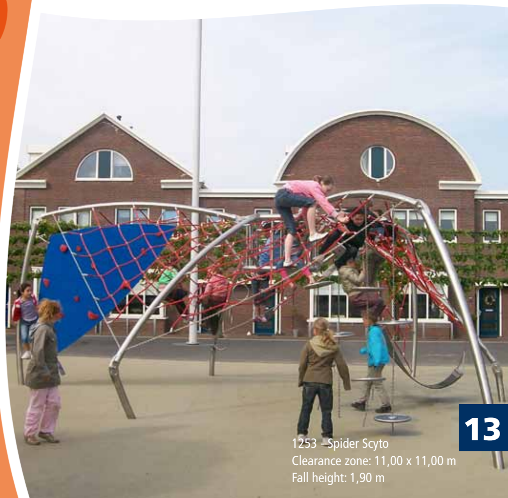
1253 - Spider Scyto Clearance zone: 11,00 x 11,00 m Fall height: 1,90 m