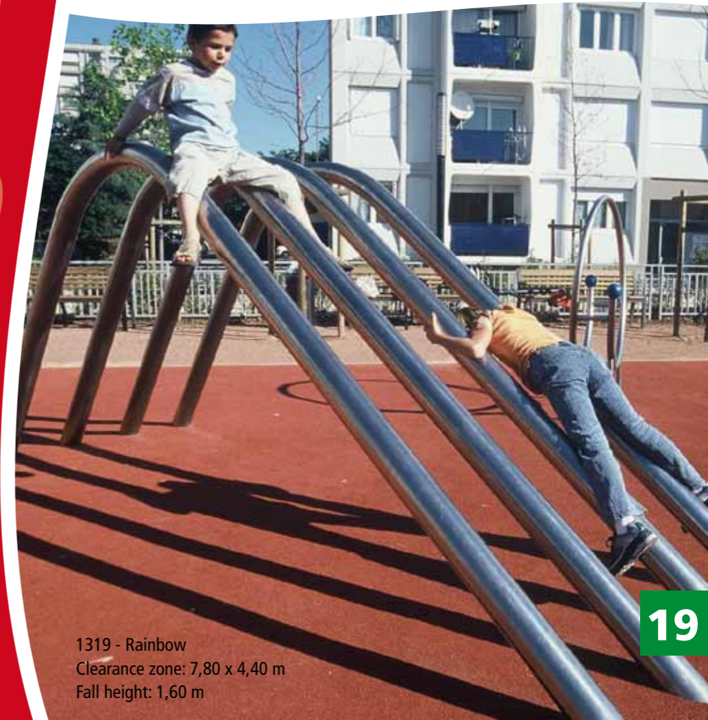
19 1319 - Rainbow Clearance zone: 7,80 x 4,40 m Fall height: 1,60 m