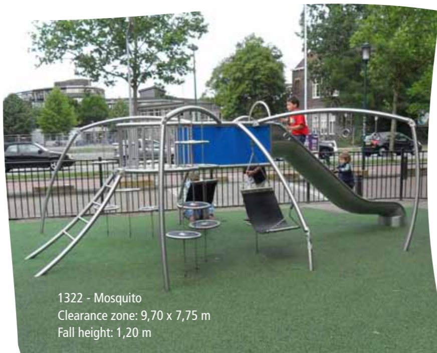
1322 - Mosquito Clearance zone: 9,70 x 7,75 m Fall height: 1,20 m