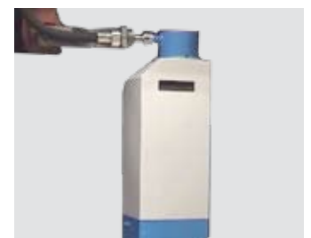
Setting-up of the device inside the machine