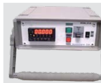
Remote control device