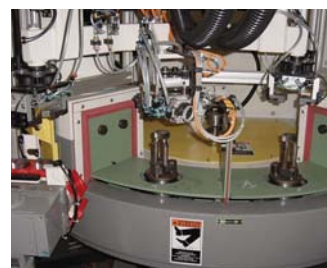
Pick and place system