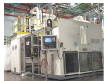
Automatic cell using stack of trays