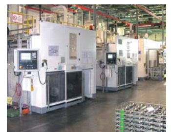
Automatic cell with parts storage trays