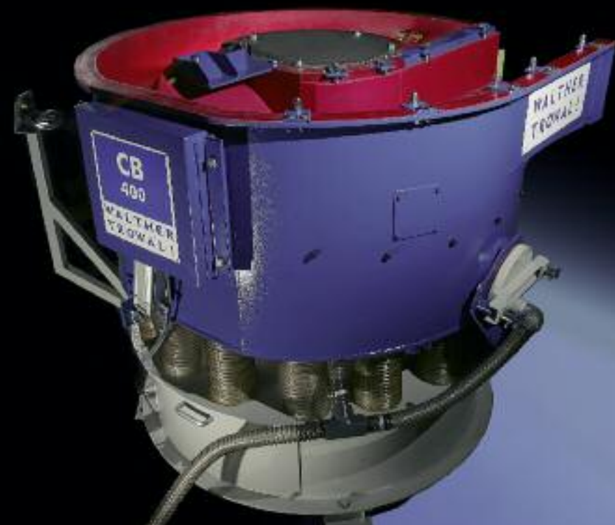
CIRCULAR VIBRATORS CB