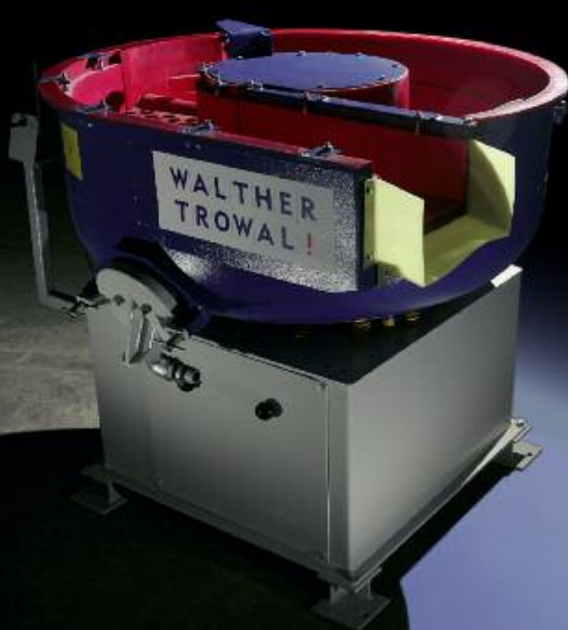
CIRCULAR VIBRATORS CD