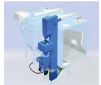
Hopper Strip Type M