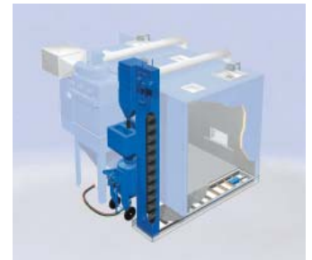
Pulso Floor Strip 1