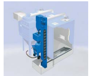
Storage conveyor Screw Strip Type