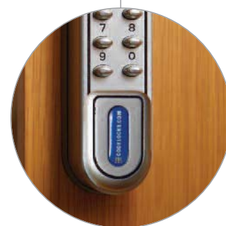
Top image Open position A