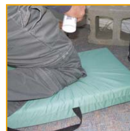
970-60 - Kneeling Mat Ultracell polyfoam padding. Removable PROBAN® outer cover resists heat and sparks. Convenient carrying handle, 15" wide, 24" long, 3" thick, custom sizes & styles available

... IMPACTO's primary concern is our customer's satisfaction.