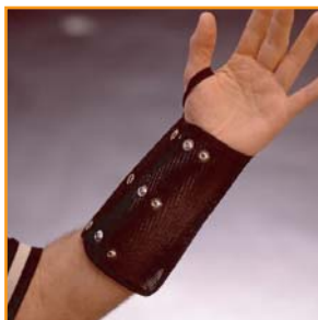
Slash resistant black nylon mesh, 7" long with elastic loop around thumb, 3 rows of snaps for size adjustment, AL253