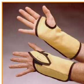
100% KEVLAR® twill, 9" long with adjustable strap around thumb, hook & loop closure, AL254 - double layer AL254-01 - single layer