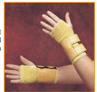
Fingerless 100% KEVLAR® knit with palm impact protection. Grain leather wrist support. 720-02 - glove liner 720-20 - grain leather palm

Impacto™ soft and comfortable HR700 Glove and the durable HR800 Mitt provide superior protection from high heat (up to 800° continuous exposure) without sacrificing manual dexterity. Impacto designs mitts and gloves with various specialty fabrics to optimize protection for your employees. In addition to providing a thermal shield from intense heat, they also provide abrasion and slash protection. One size hand, cuff length varies.