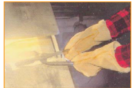
Woven 22oz Norfab® outer shell for extended wear in abrasive environments, heat resistant lining made of a range of durable blended yarns, 100% KEVLAR® stitching HR800 - 14" mitten length HR800-16 - 16" length HR800-24 - 24" length