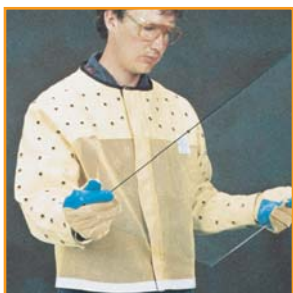
100% KEVLAR® twill jacket. Continuous filament mesh body. Front zipper with hook and loop closure AL275 - grommets on sleeves AL275-01 - without grommets

Antilacerative Jackets and Sleeves combine specially designed 100% KEVLAR® fabrics to provide the best possible protection from slash injuries while maintaining total flexibility and personal comfort. Convenient zippers and hook and loop fasteners allow the clothing to be quickly changed. Complete size ranges, Small to XXX-Large, assure a safe and comfortable fit. A wide variety of designs are available to suit specific applications.