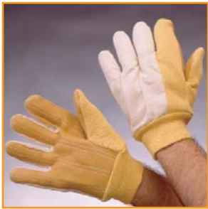
100% KEVLAR® fleece glove, grain leather palm and fingers for durability, 100% KEVLAR® knit cuff AL200 - breathable cotton back AL210 - 100% KEVLAR® fleece back (inset) AL211 - 3" gauntlet 100% KEVLAR® twill cuff