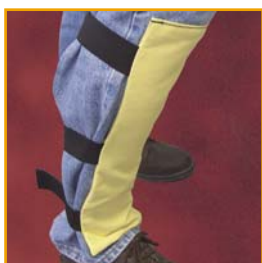
AL256 - Shin Guard Double layer Anti-Slash shin protector made of 100% KEVLAR® twill. Adjustable elastic straps with hook and loop closure. One size only