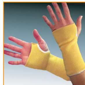
100% KEVLAR® double layer stretch tubular knit, one size, 8" long with cutout thumb hole, AL250-08 AL250-12 - 12", no thumb hole

Antilacerative Jackets and Sleeves combine specially designed 100% KEVLAR® fabrics to provide the best possible protection from slash injuries while maintaining total flexibility and personal comfort. Convenient zippers and hook and loop fasteners allow the clothing to be quickly changed. Complete size ranges, Small to XXX-Large, assure a safe and comfortable fit. A wide variety of designs are available to suit specific applications.