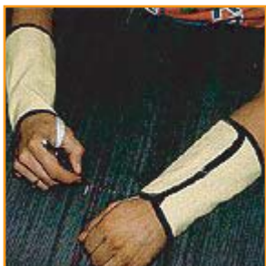
9" long with elastic loop around thumb, hook & loop closure, 100% KEVLAR® twill, AL252 AL252MESH - black mesh

Impacto™ forearm protectors manufactured from 100% KEVLAR® fibers protect the wrist and forearm from cuts, abrasion and exposure to sparks in hazardous industrial situations. Knit mesh cuffs provide slash protection. Available in sizes Small to X-Large