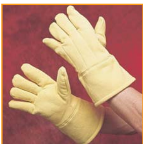
100% KEVLAR® knit fleece, Nomex® interlining provides additional heat shield in palm and fingers, wool viscos lining, 100% KEVLAR® stitching HR700 - 4" gauntlet cuff HR700-10 - 10" cuff HR700-20 - 20" cuff

Impacto™ soft and comfortable HR700 Glove and the durable HR800 Mitt provide superior protection from high heat (up to 800° continuous exposure) without sacrificing manual dexterity. Impacto designs mitts and gloves with various specialty fabrics to optimize protection for your employees. In addition to providing a thermal shield from intense heat, they also provide abrasion and slash protection. One size hand, cuff length varies.