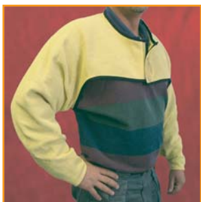
8oz 100% KEVLAR® knit mesh cape sleeves, hook and loop front closure, AL293 AL293-01 - short sleeves AL293-03 - extended sleeves