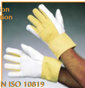
100% KEVLAR® fleece Air Glove™, cotton inner lining, Anti-Vib™ Cellular Air Bladder protects palm, thumb and fingers from vibration, KEVLAR® twill cuff AIR790-00 - 6" cuff AIR790-40 - 3" cuff, pearl leather on palm and thumb