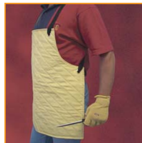
100% KEVLAR® quilted multi-layered apron. Web straps with buckle closure at waist. Adjustable straps over shoulders, AL294