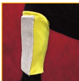
AL257 - Padded Shin Guard Pull on style, double layer 100% KEVLAR® sleeve, Visco Elastic Polymer padding protects from impact and shock. Suede leather cover for abrasion protection, in a range of sizes