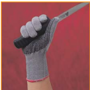
Highly cut resistant glove made of 100% Spectra® yarn. S81D1 - PVC grip surface on palm and fingers. Knit cuff S814D1 - no PVC on ulnar side of hand. No cuff