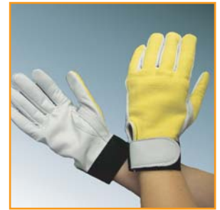
Pearl leather palm, 100% KEVLAR® fleece back, elastic wrist with hook & loop closure, HR423-35