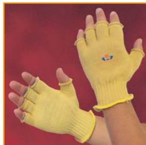
Half finger, 100% KEVLAR® knit glove with Visco-Elastic Polymer padding in the palm and fingers, AL720-51