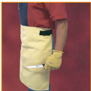
22pt30 Norfab® apron. Adjustable elastic waist strap with hook and loop closure, one size only 24" X 24", AL291 AL291-01 - replacement strap