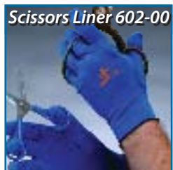
Scissors Liner 602-00

Neoprene pad in the back of fingers, mesh back