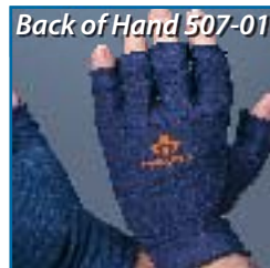
Back of Hand 507-01

Reduces pressure of knife handle on palm and thumb