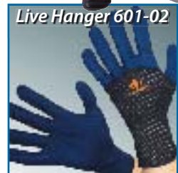
Live Hanger 601-02

3/16" pad in palm, knuckles and back of hand