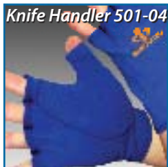
Knife Handler 501-04

Soft leather, padded palm, edge and back of hand