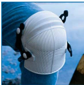
860-00 - Liquid Resistant

Molded, snug, quick fitting design, heavy duty protection, heat resistant, removable elastic straps with hook and loop closure 880-20 - with leather straps 880-STRAPS - set of 2 replacement straps