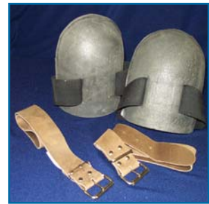
880-00 - Rubber

Pad has outer cover of fire retardant Proban®, hinged action hard shell cover, dual straps 877-01 - plastic buckles