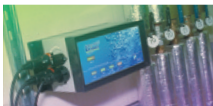
Scalewatcher ENiGMA unit

Applying a low energy, frequency modulated (FM) electric field to water causes calcium bi-carbonate to revert back to its carbonate form. Because resultant crystals form on other ions in the bulk of the water and not onto a system surface, they remain in suspension until discharged to drain. As water is no longer saturated it can achieve what it did underground; it again dissolves calcium it comes in contact with, thereby removing scale deposits in the water system.