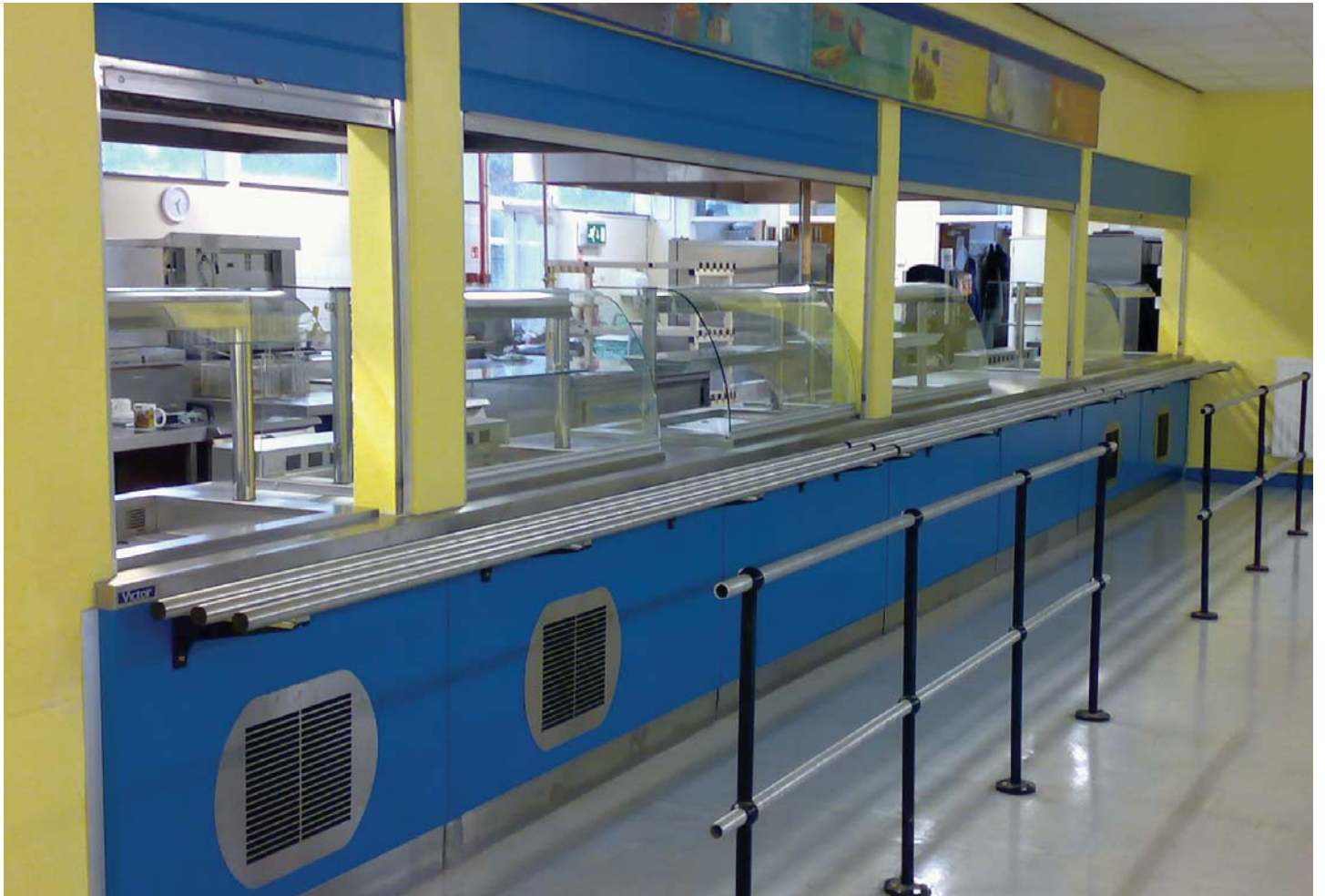
Comprehensive school stainless steel topped counter fish plate butted featuring Synergy drop-in modules and P.C.S frontage installation in intergrated with pillars and roller shutter.