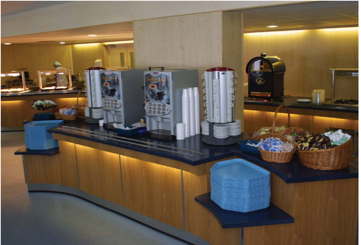
Custom large beverage and tray pick up unit.