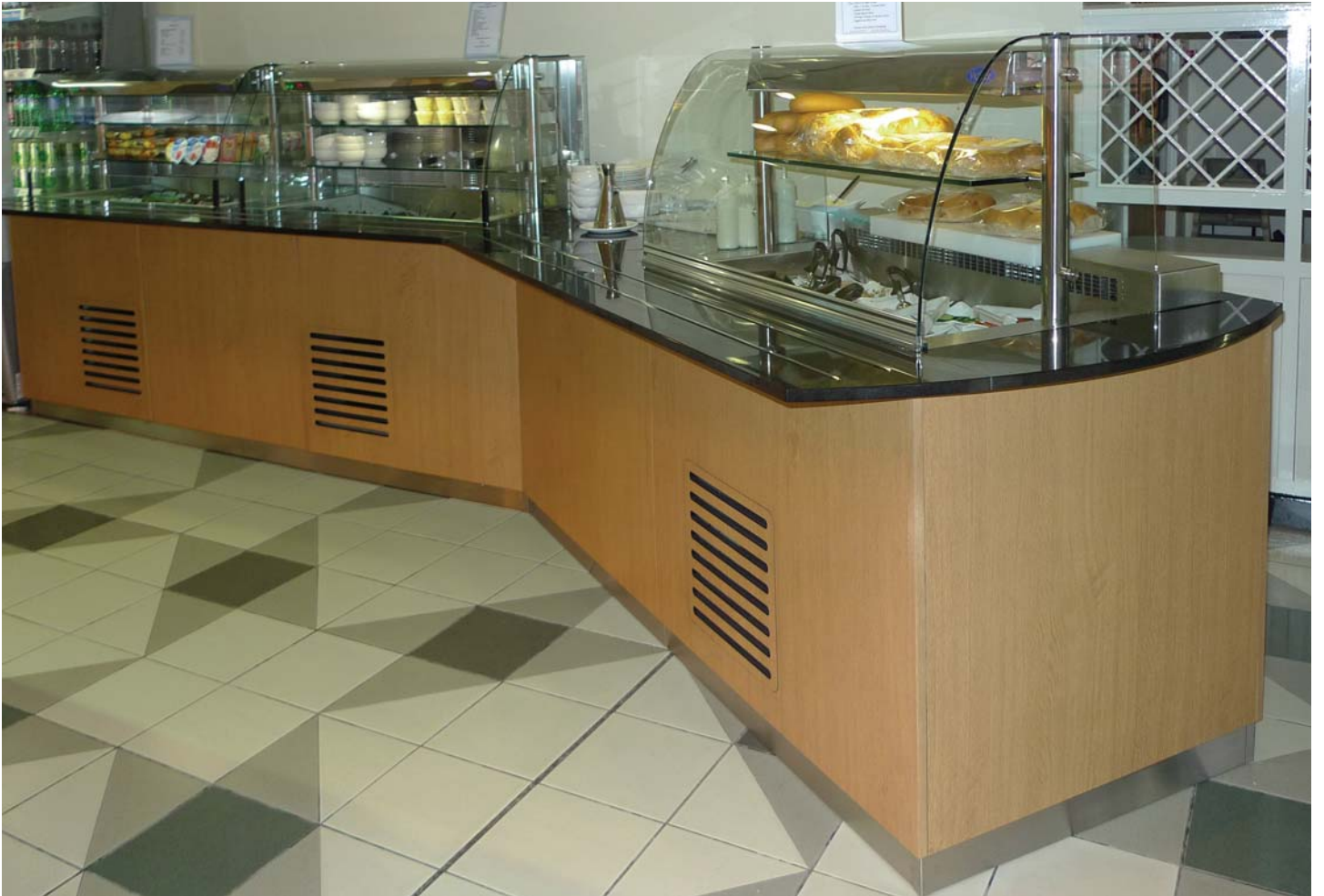
Granite topped counter featuring back to wall multi-tier displays.