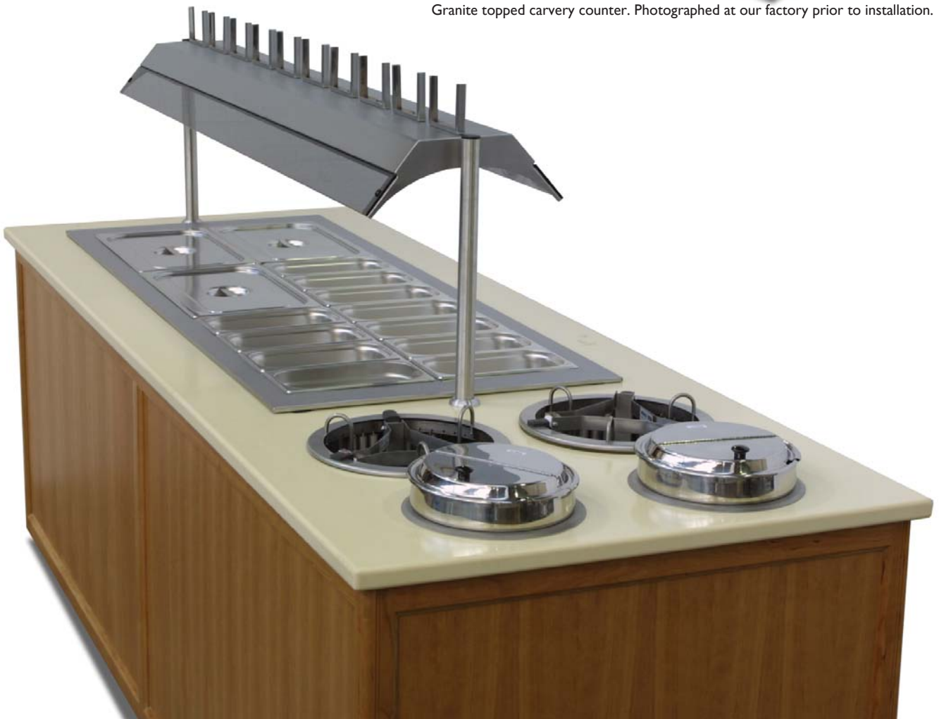
Bespoke hot buffet unit featuring heated plate lowerators and soup wells.