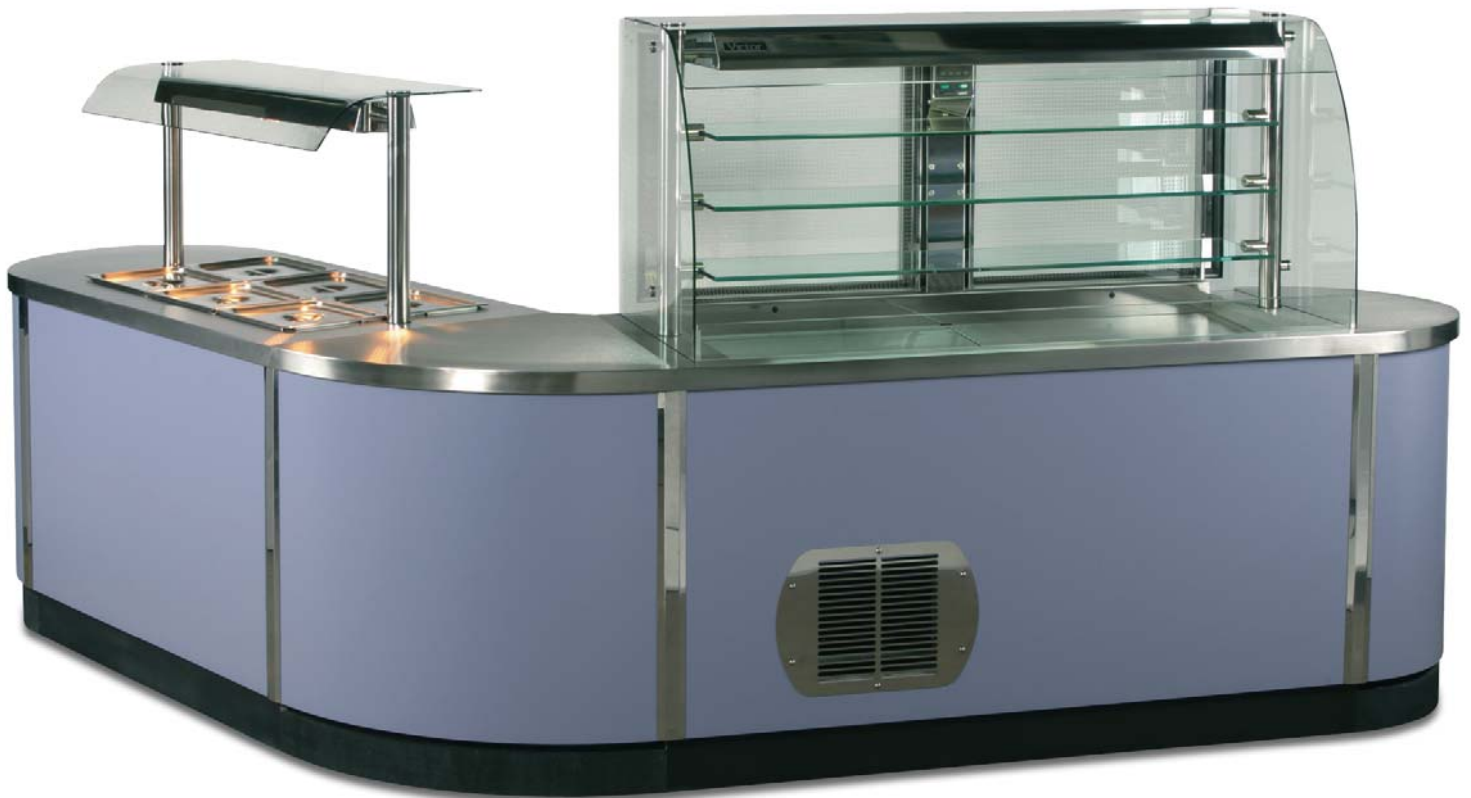
Stainless Steel topped counter with curved ends.