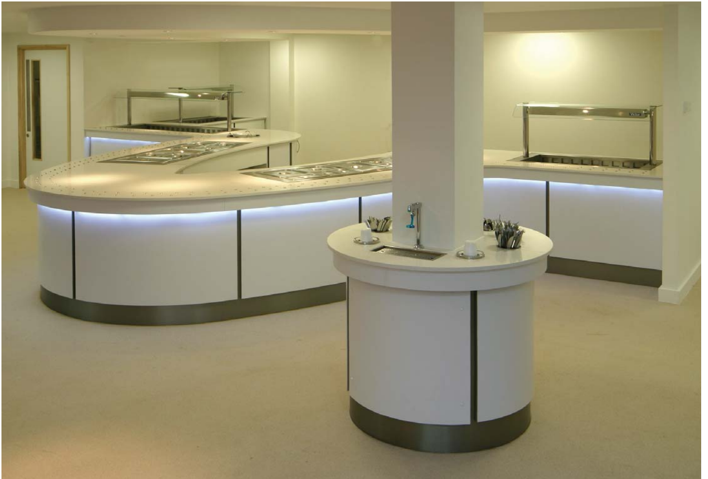
Silestone topped multi-use servery counter installation at an independent girls school.