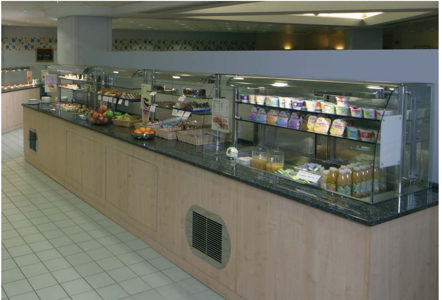
Granite topped servery counter-staff dining facility at a UK Building Society.