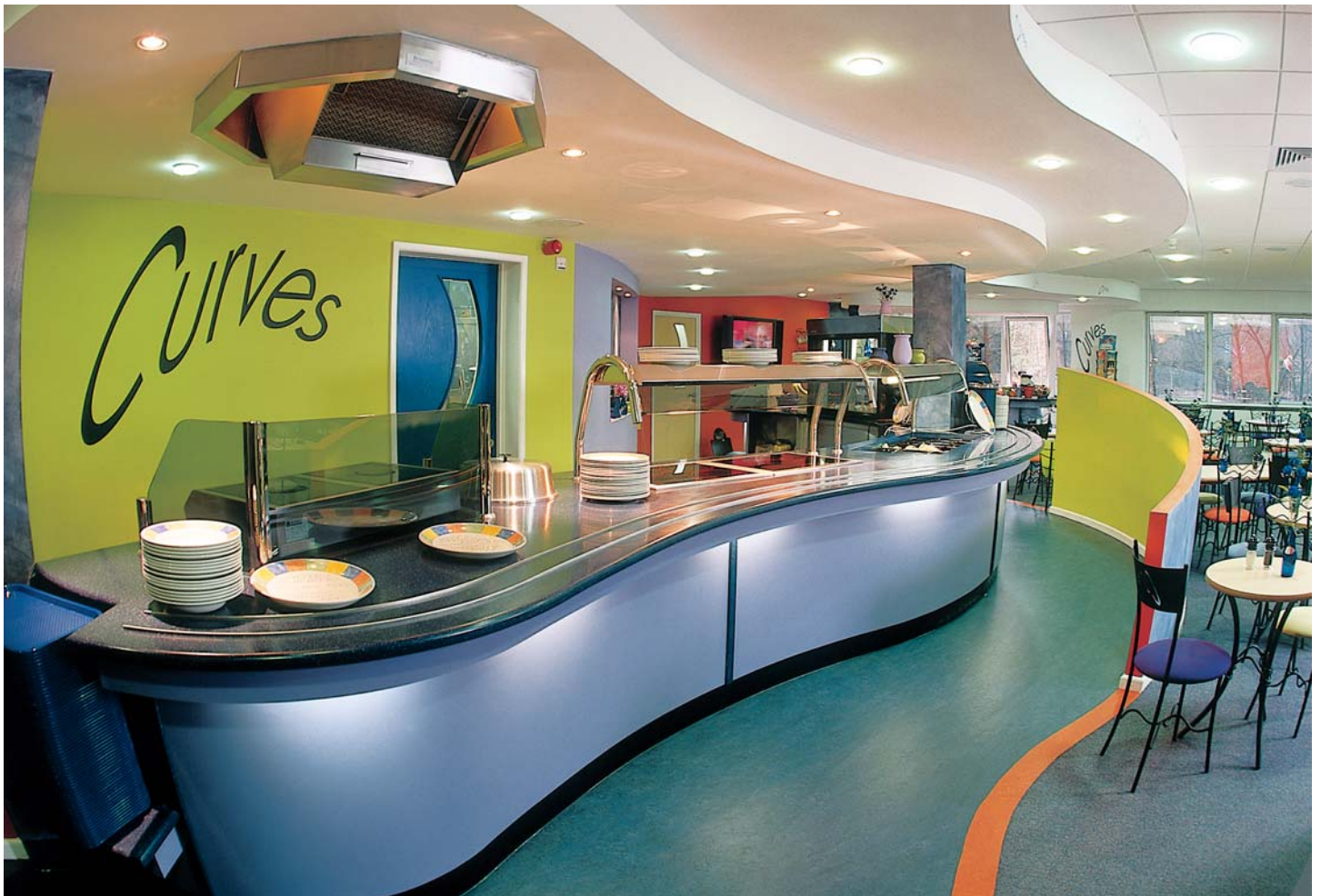
Curved counter - staff dining facility at a UK insurance company.