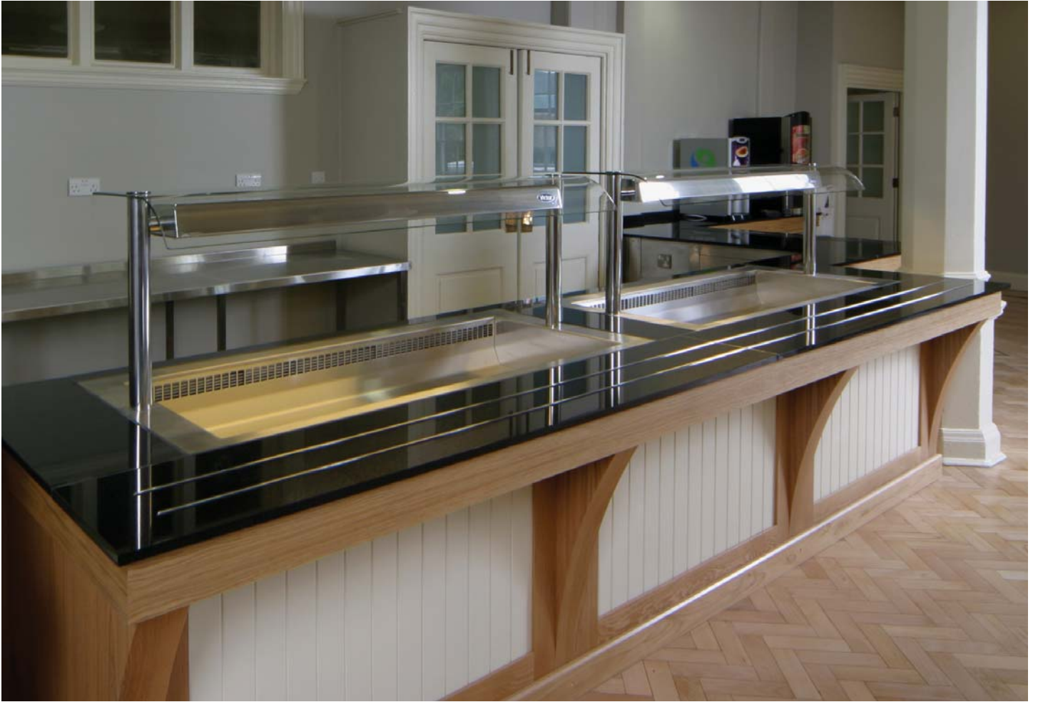
Independent school extended granite topped fixed counter with Synergy drop-ins, inlaid stainless steel trayslide and oak feature supports.