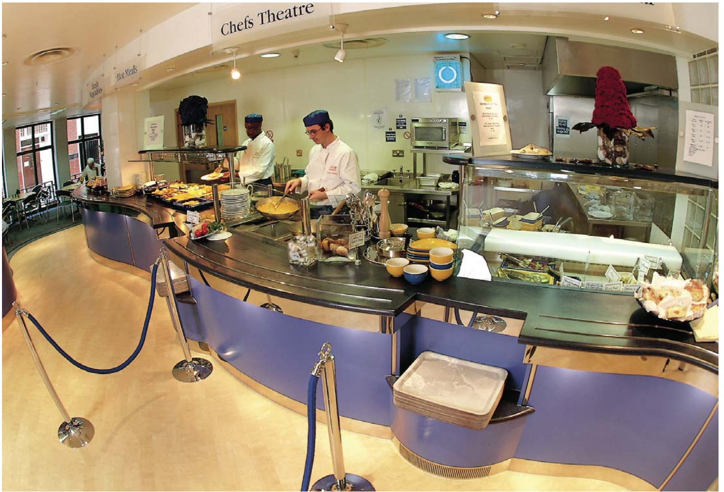
Curved counter - central London staff dining facility.