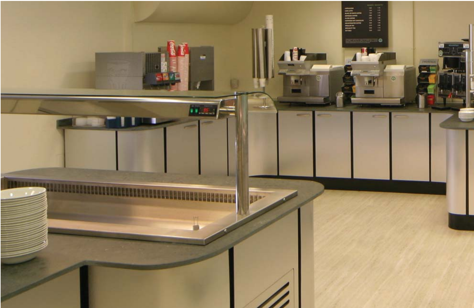
Multi-point slate top servery counter at UK independent university.