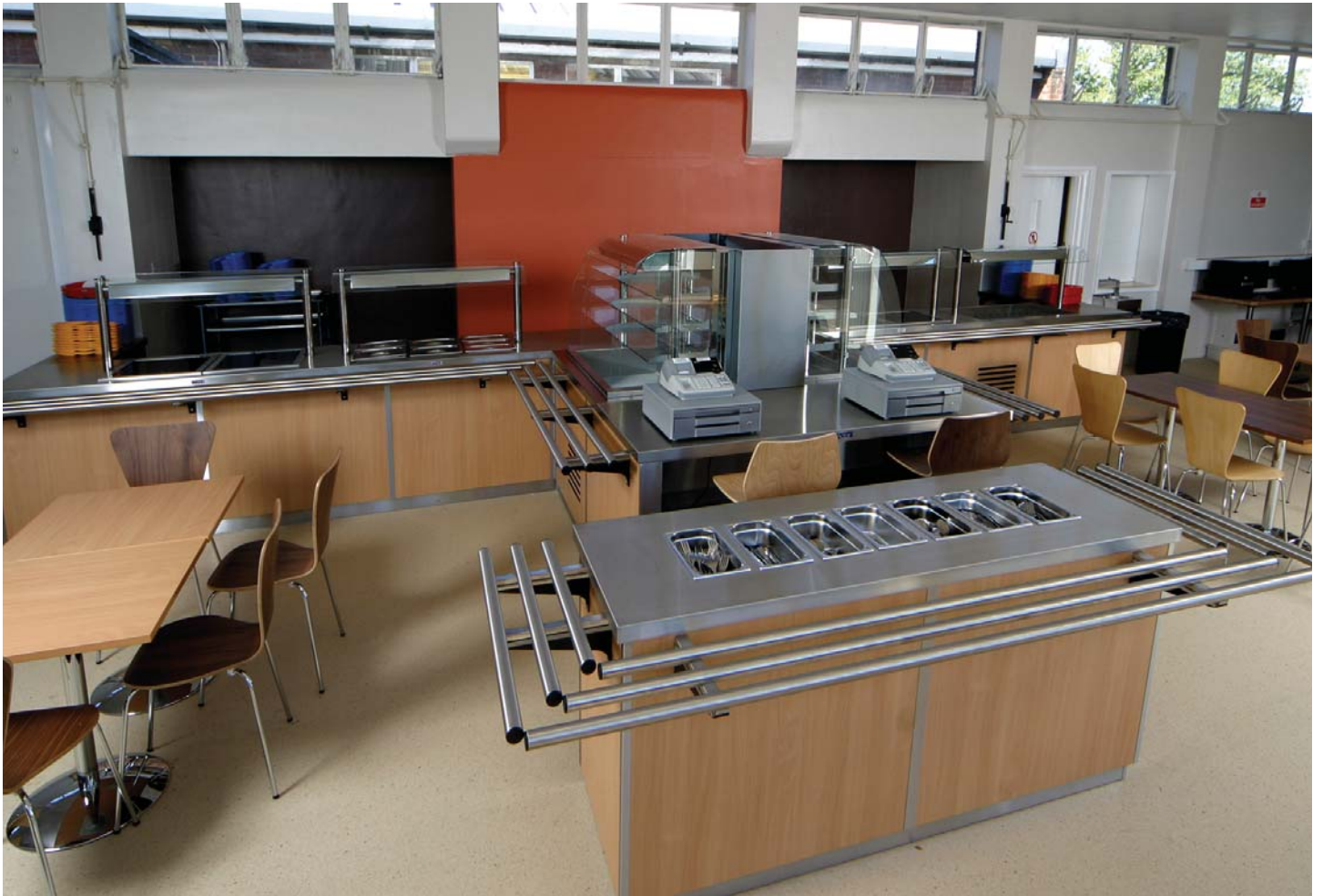
Stainless steel top counter units at comprehensive school - note arrangement of back to back multi-tier displays.