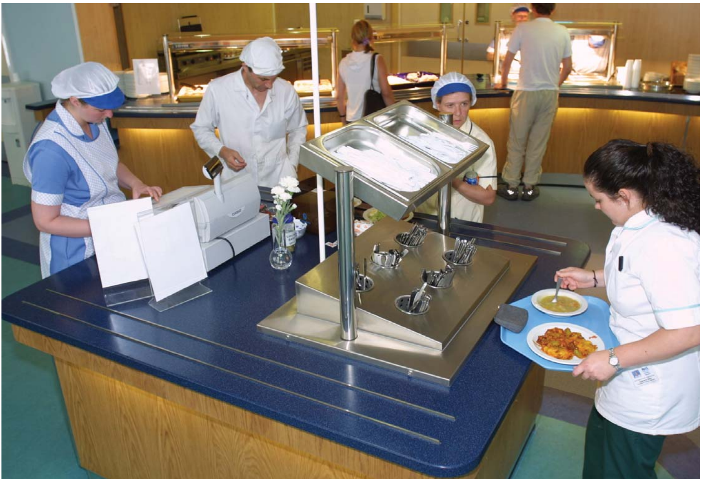
Custom cutlery pick up and payment station.