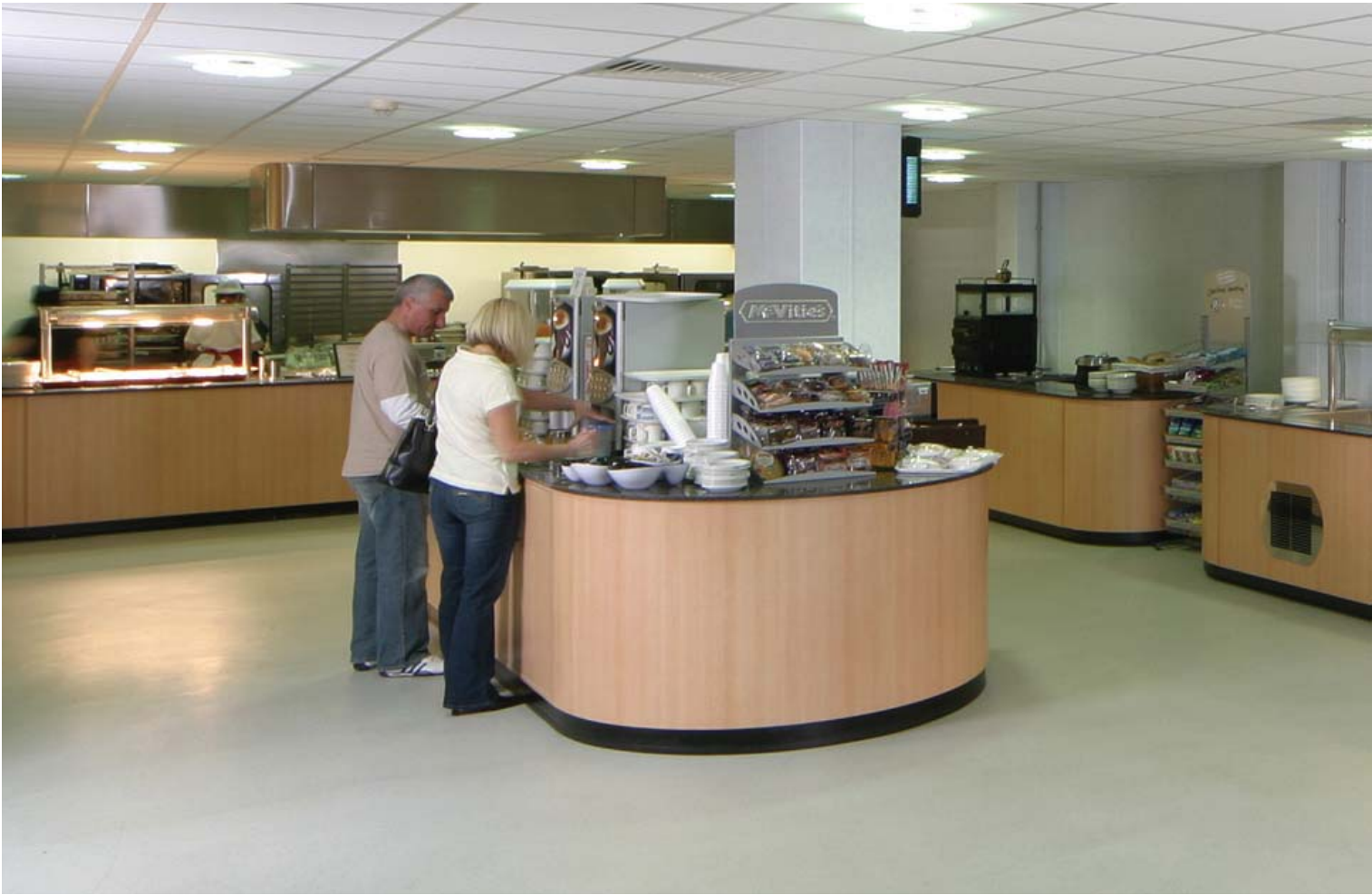
Modular & fixed granite topped servery units - hospital catering facility.