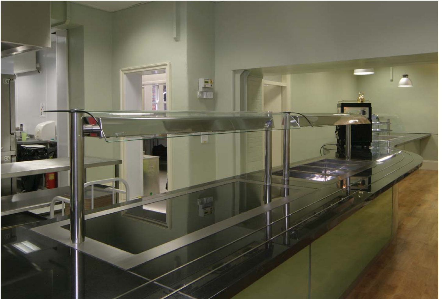
Independent school extended granite topped fixed counter with Synergy drop-ins, inlaid stainless steel trayslide & curved feature to one end.