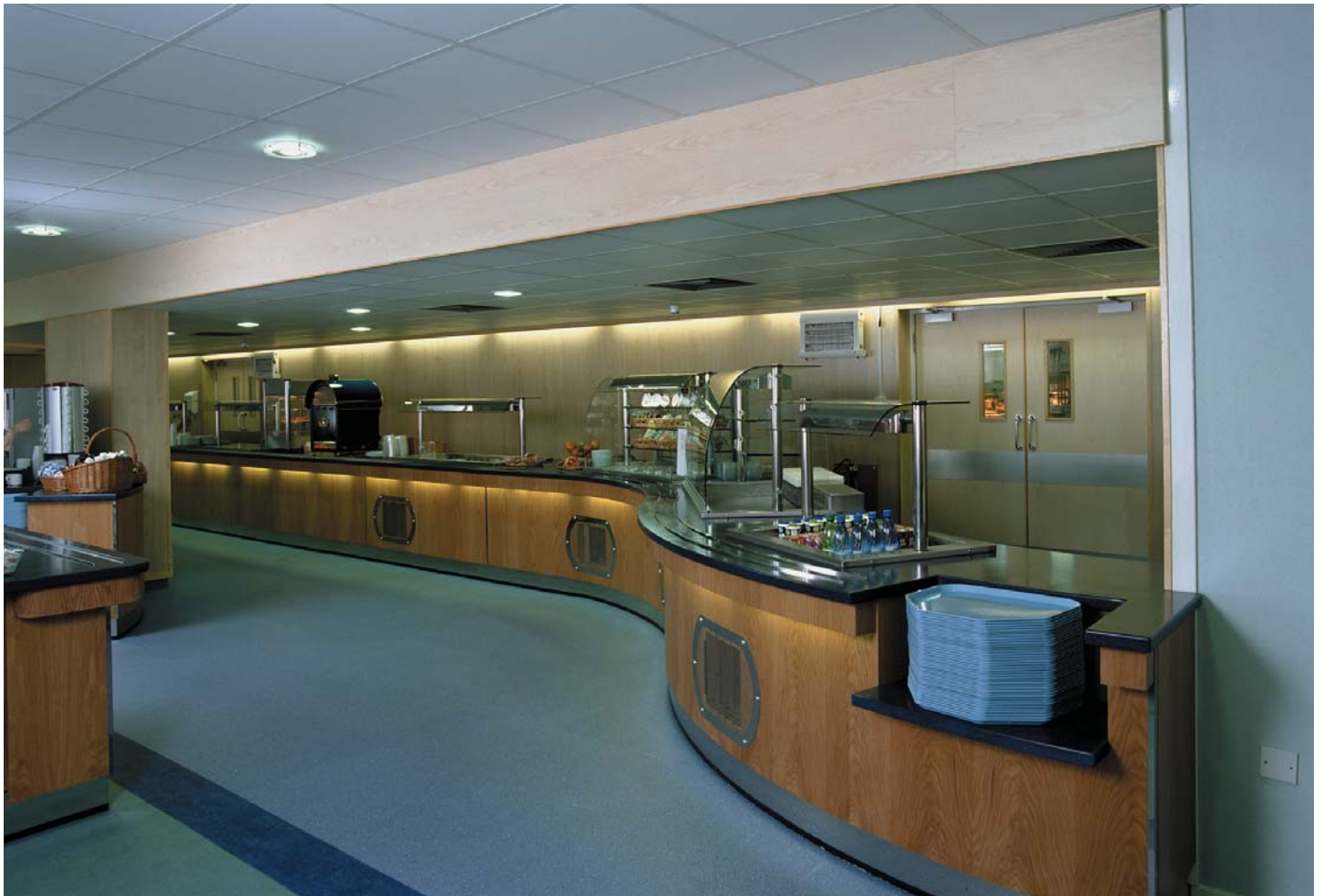
Hospital shop-fitted counter approx. 18 metres long - Corian top with illumination under light pelmet.