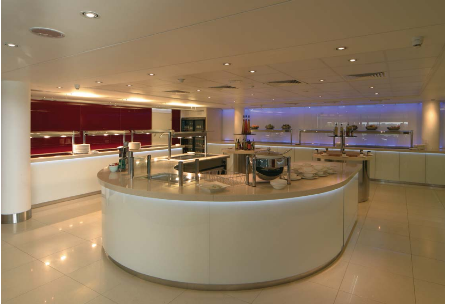
Silestone topped counter with LED lighting and glass fronted body panels.