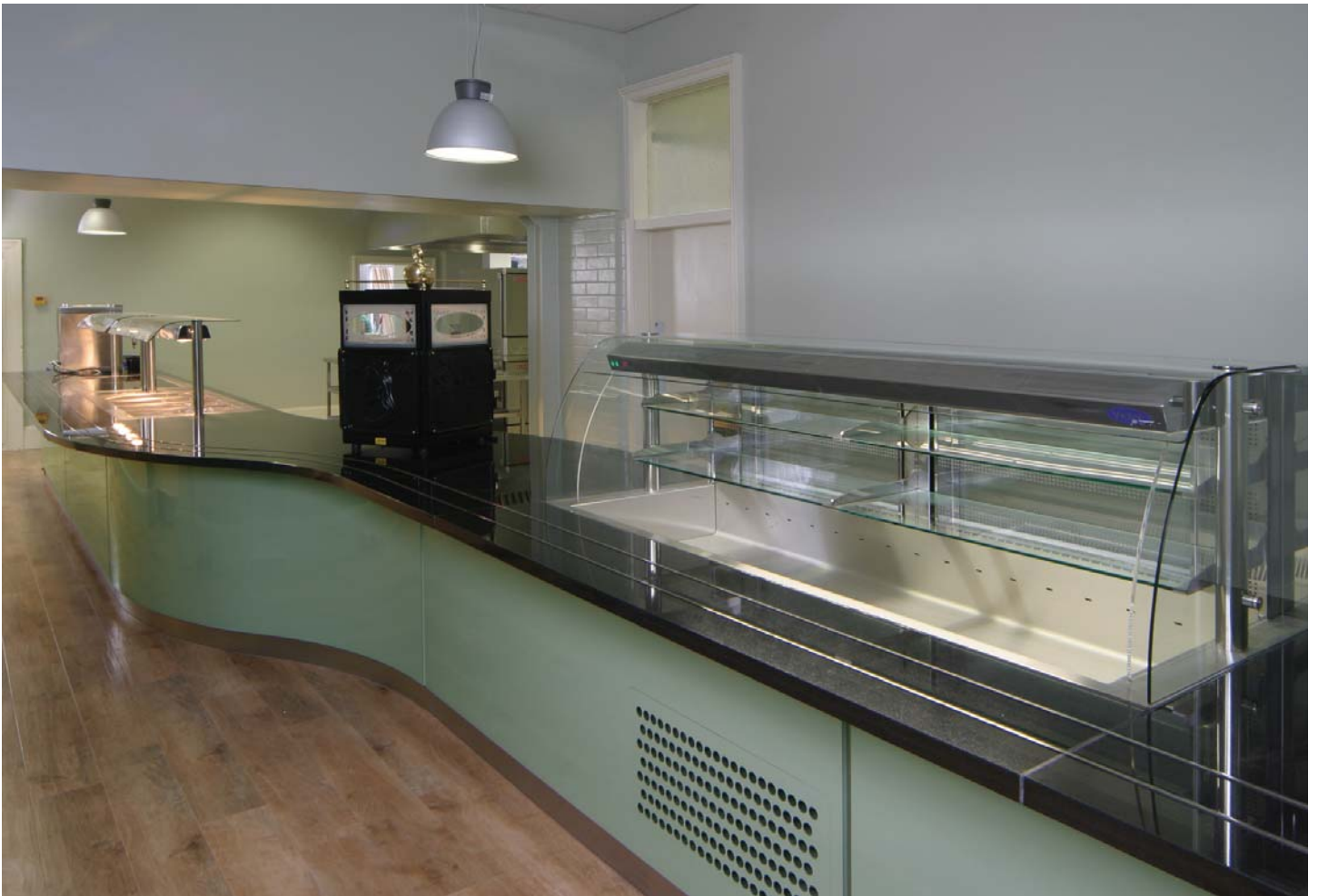
Counter showing low level two tier 5 pan Synergy multi-tier and flush routed grill.