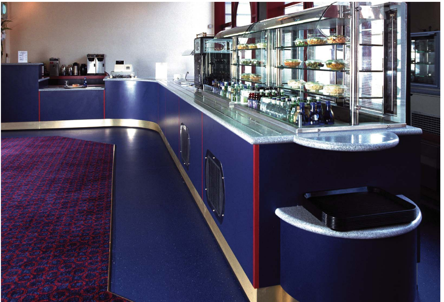
Corian topped counter in theatre bar featuring refrigerated multi-tiers.