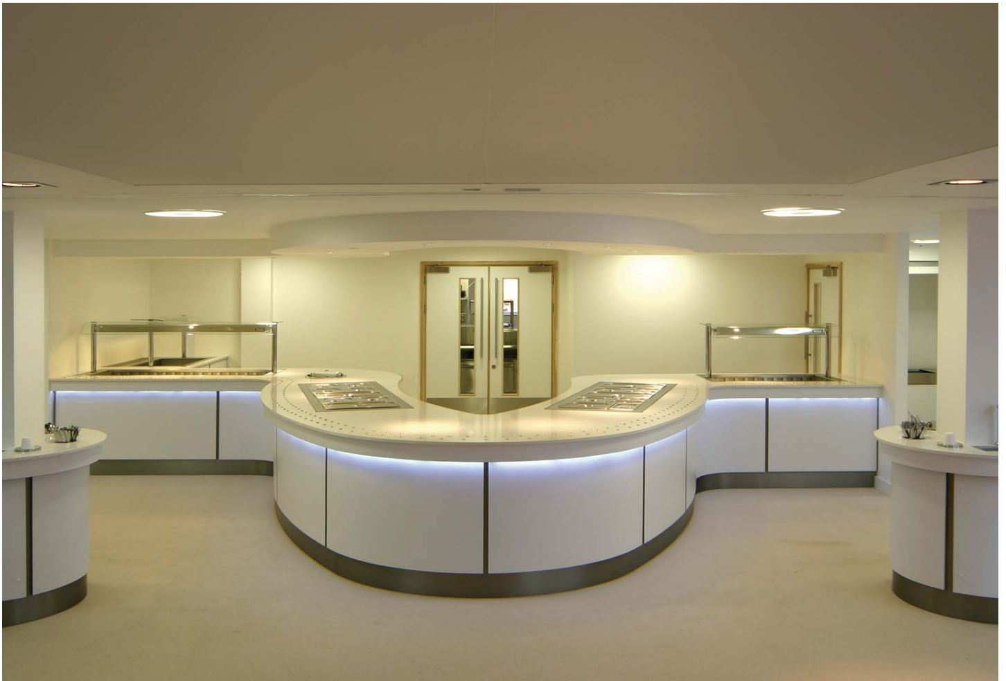
Synergy units installed without gantries - The bains marie wells are covered with matching inserts to form a drinks serving point for evening functions.