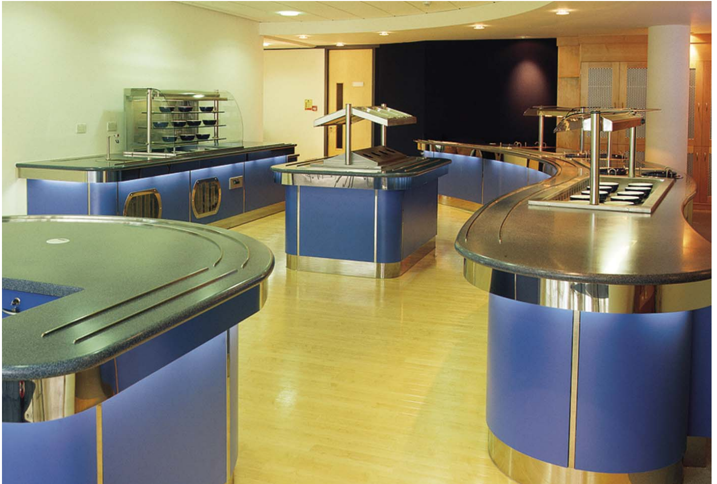
Corian topped shop fitted counter featuring Synergy drop-ins at staff dining facility.