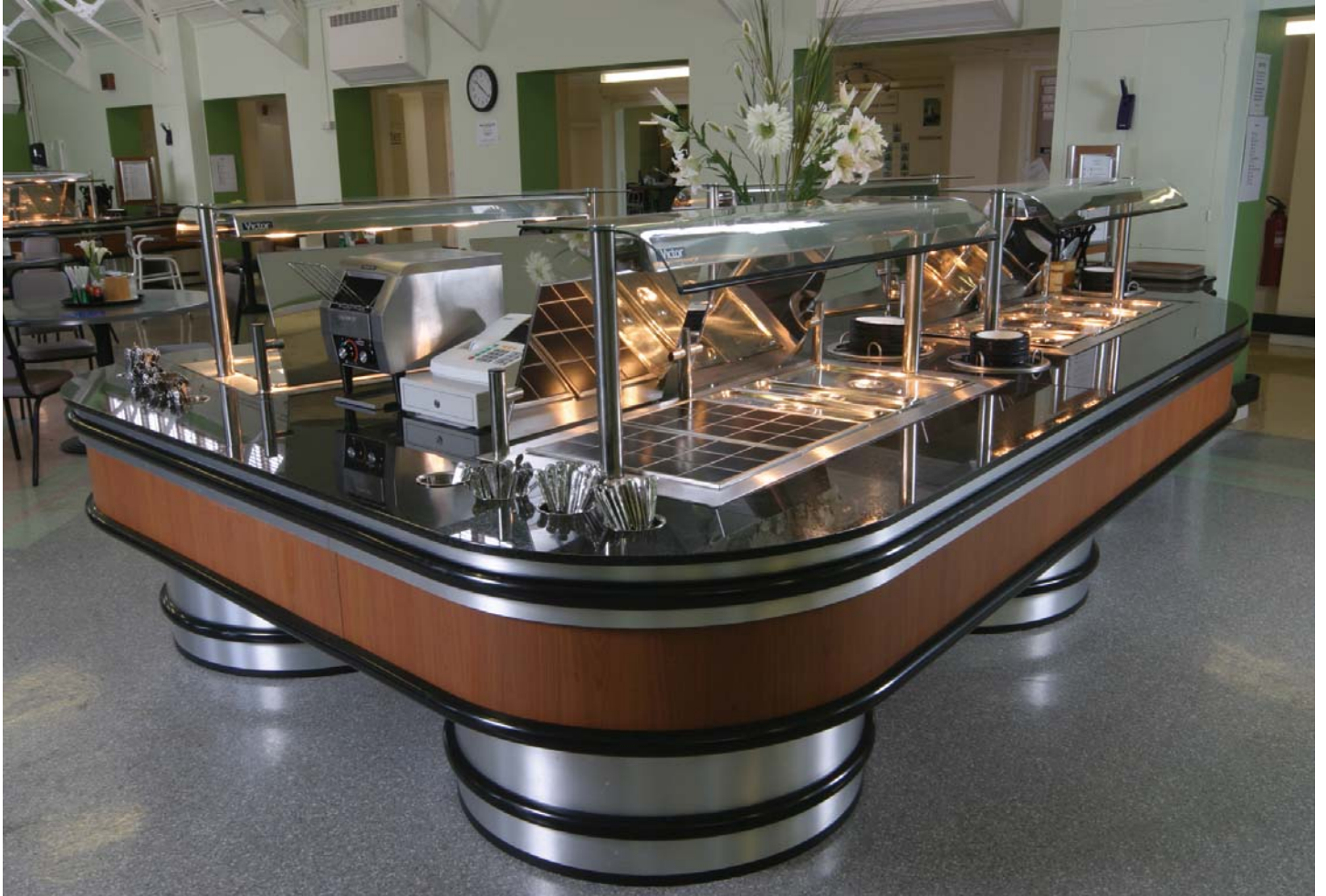
Bespoke servery counter at a special needs school. The counter features low level counter, wheel chair bump protectors and sneeze screen edge guards.