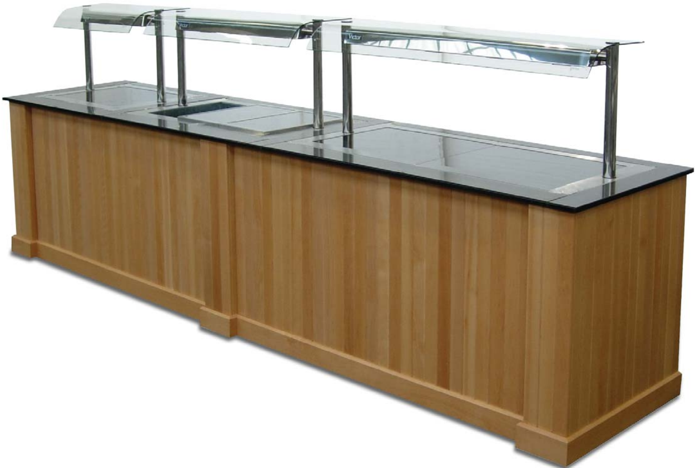
Granite topped carvery counter. Photographed at our factory prior to installation.