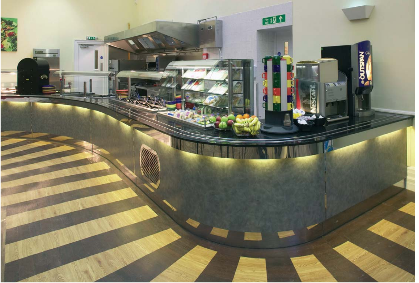
Granite topped counter featuring cook station and mirror finish stainless steel kick plinths.