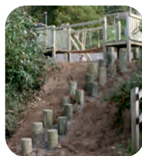
In progress pictures

Project: Triple T Play Park, Truro Playbuilder