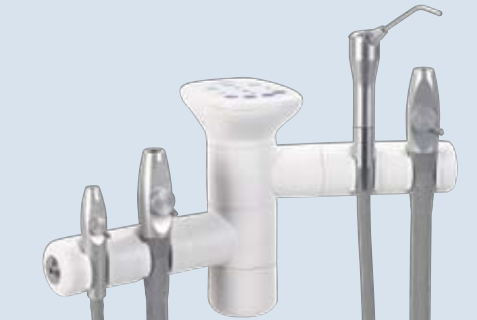
Dual 2-position holder (international only)