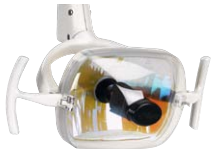
A-dec 500 light