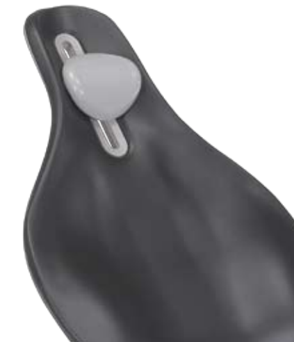
Thin-line back with patient-adjustable neck support