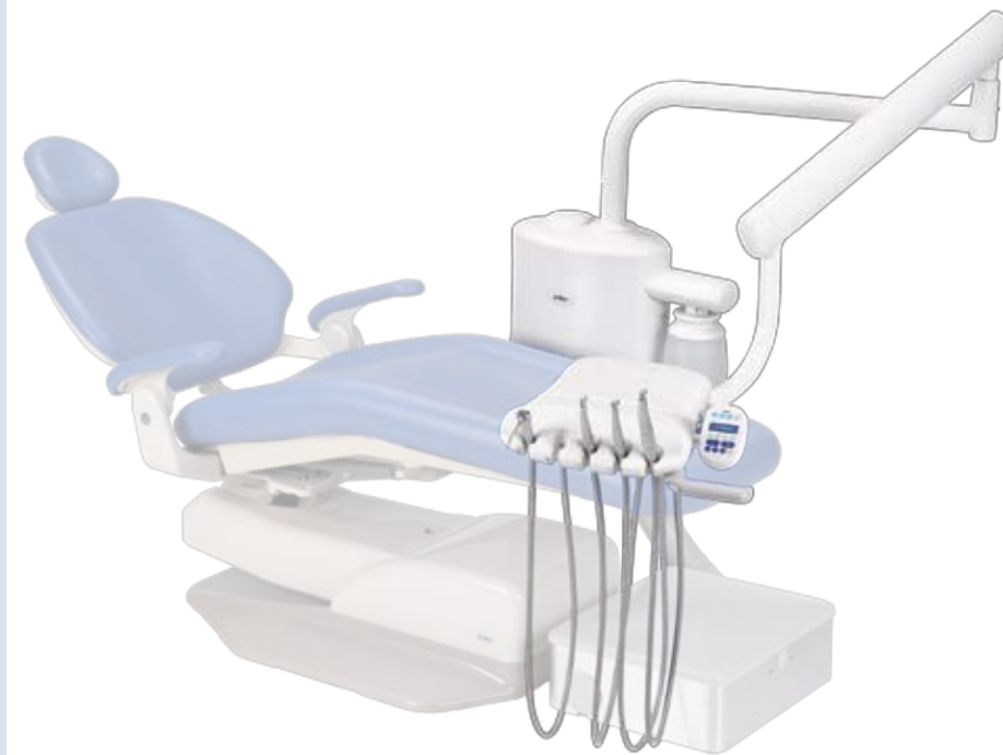
Shown: Decade chair with A-dec 300 support center and A-dec 300 traditional delivery system.

Looking to upgrade your operator, but keep your existing chair? The A-dec 300 support center and delivery system can attach to your existing chair to easily infuse integration into your operator.