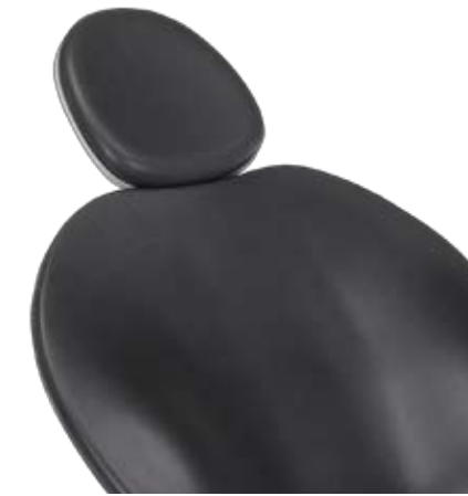
Thin-line back with double-articulating headrest

The A-dec 300 chair features a thin-line back with your choice of double-articulating headrest or patient-adjustable neck support.