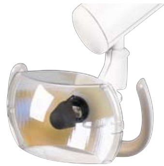
A-dec 300 light

Get horizontal and vertical rotation, and two intensity settings with the A-dec 300 light. Or, choose the A-dec 500 light with a third axis of rotation and three intensity settings.