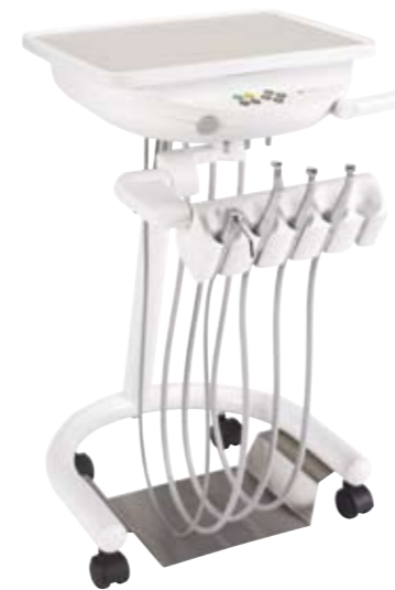
4. Mobile Cart (Air version only)