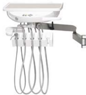
5. Cabinet Module (Air version only)