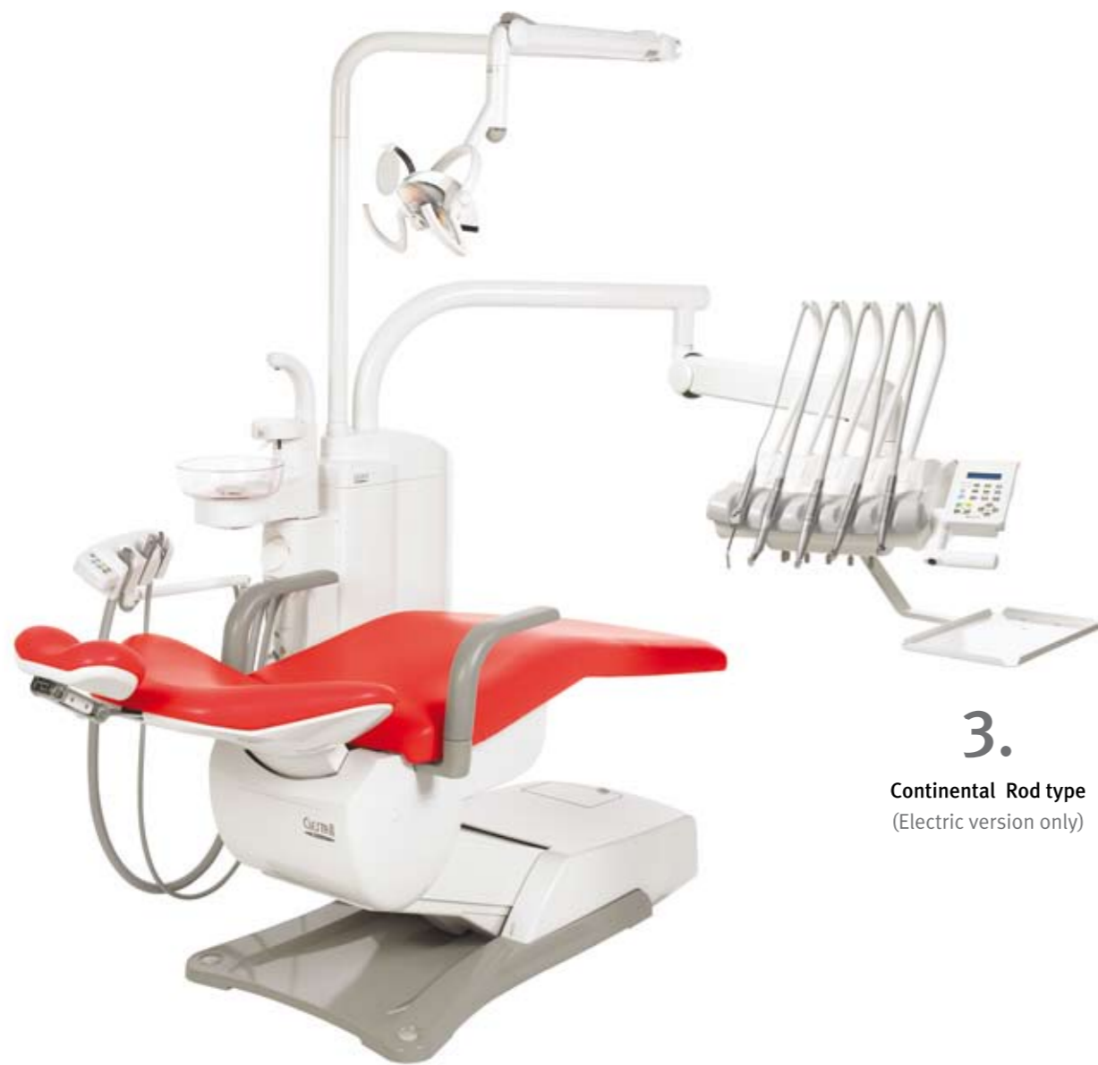
3. Continental Rod type (Electric version only)