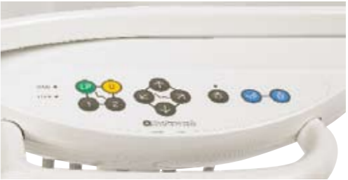
Electric (E) and Air (A) Control Panels