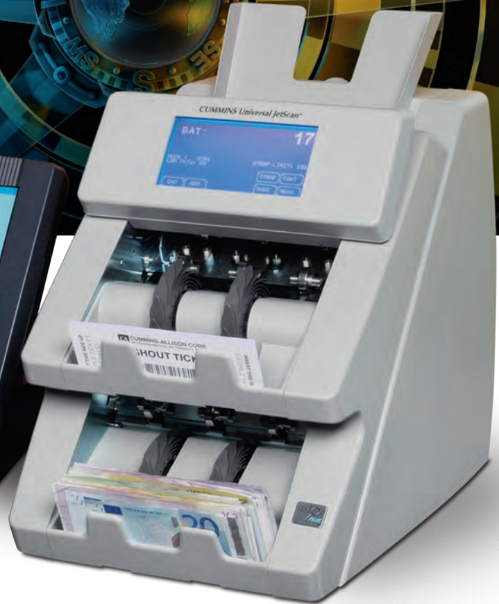
Universal JetScan™ 4391

The JetSuite™ system makes quick work of counting and reading multiple currencies and tickets.