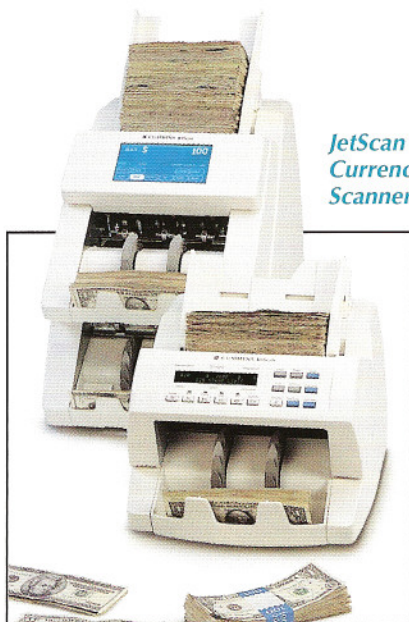
JetScan Currency Scanners.

JetWedge can be used with any of these Cummins Products