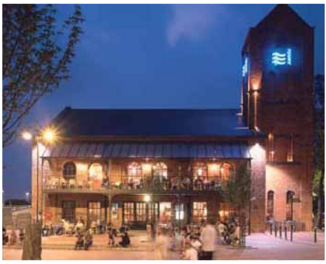
THE QUAY, Leicester Designers: Boyce Associates