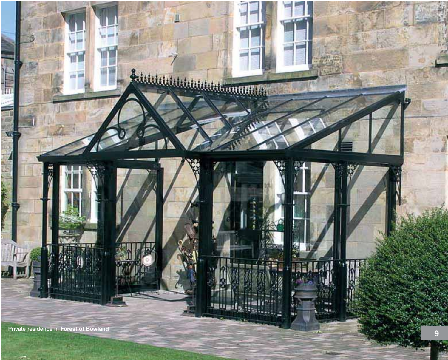
Private residence in Forest of Bowland