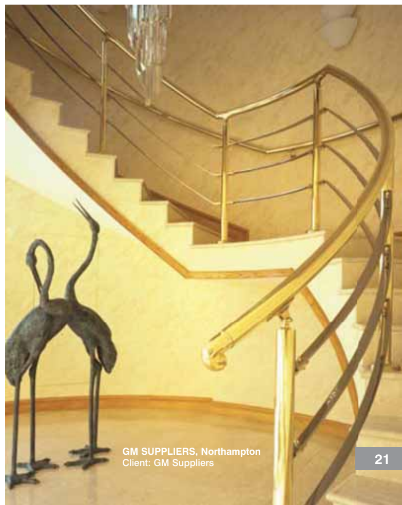
GM SUPPLIERS, Northampton Client: GM Suppliers