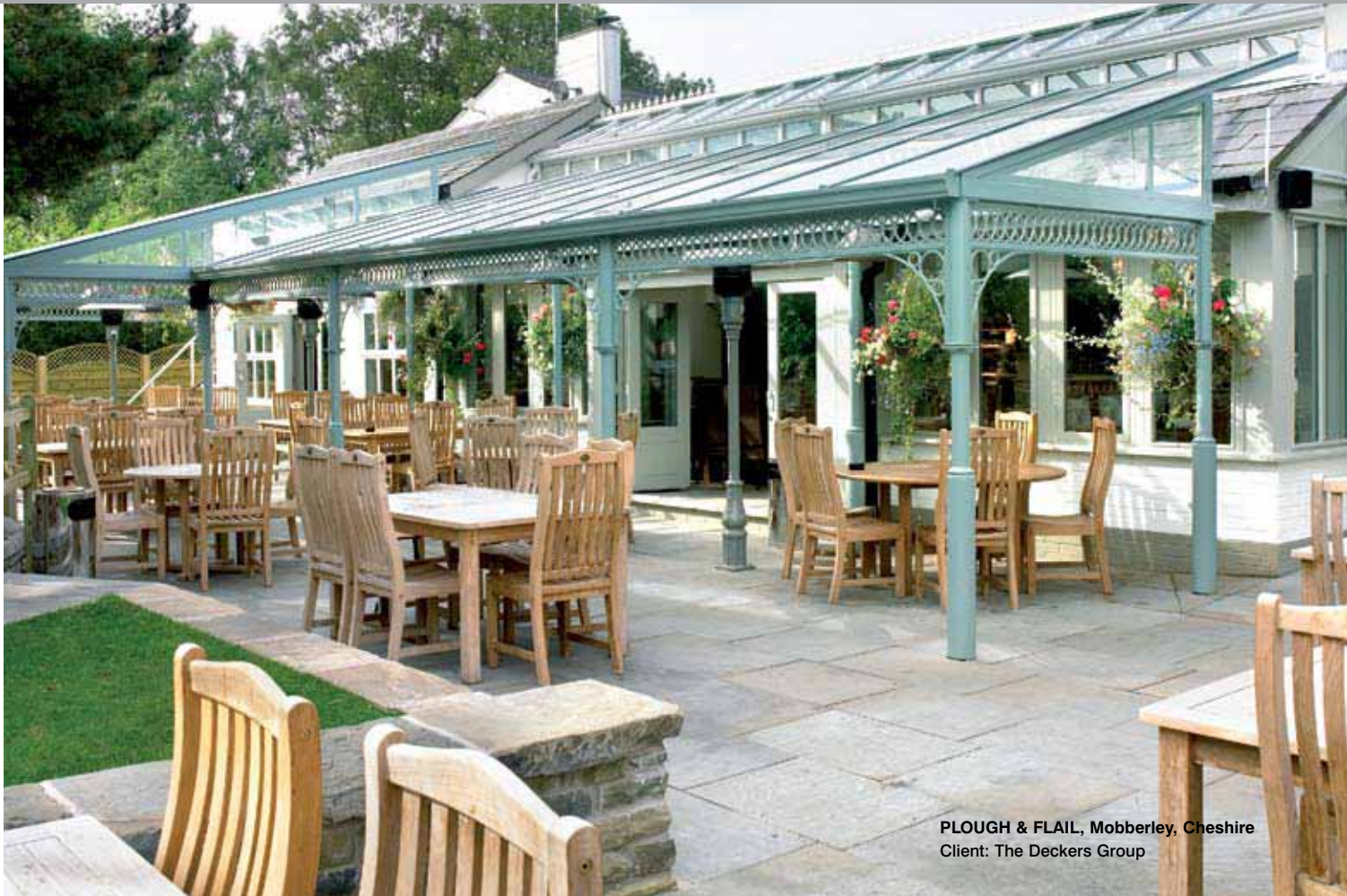
PLOUGH & FLAIL, Mobberley, Cheshire Client: The Deckers Group