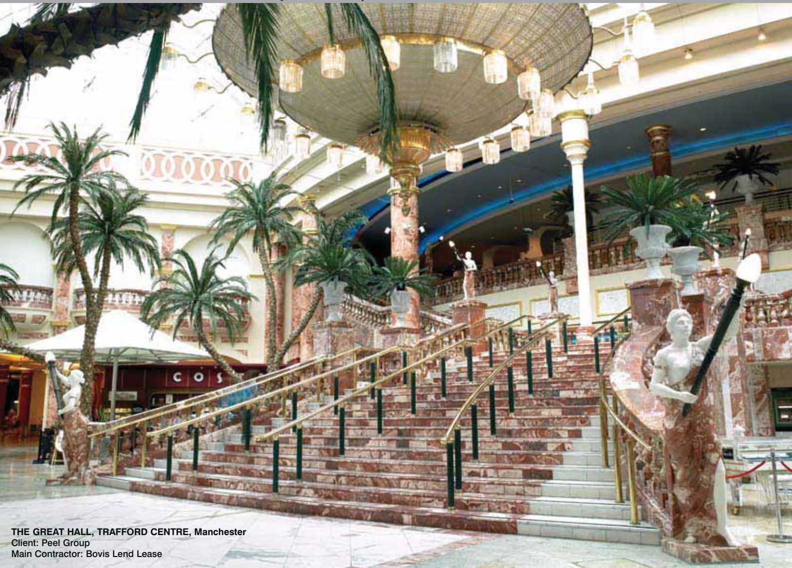
THE GREAT HALL, TRAFFORD CENTRE, Manchester Client: Peel Group Main Contractor: Bovis Lend Lease