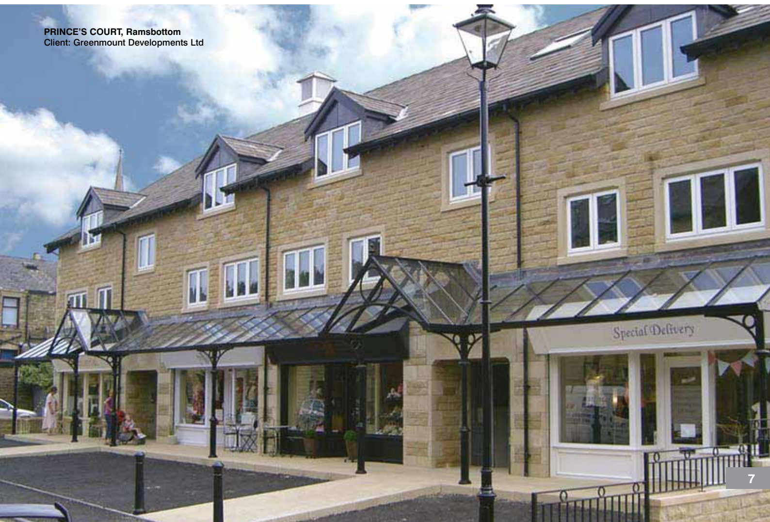
PRINCE'S COURT, Ramsbottom Client: Greenmount Developments Ltd