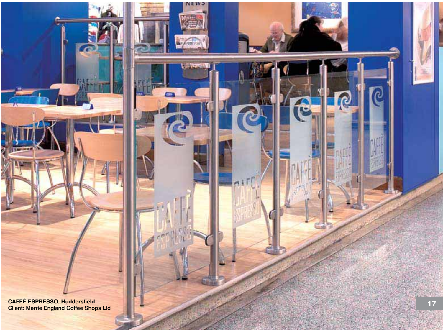
CAFFÈ ESPRESSO, Huddersfield Client: Merrie England Coffee Shops Ltd