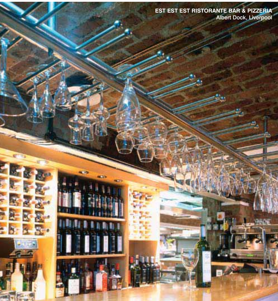
EST EST EST RISTORANTE BAR & PIZZERIA Albert Dock, Liverpool