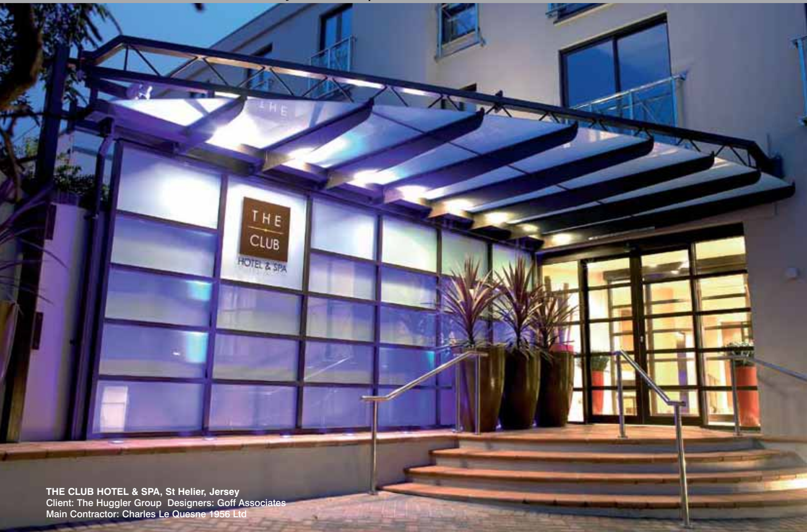
THE CLUB HOTEL & SPA, St Helier, Jersey Client: The Huggler Group Designers: Goff Associates Main Contractor: Charles Le Quesne 1956 Ltd