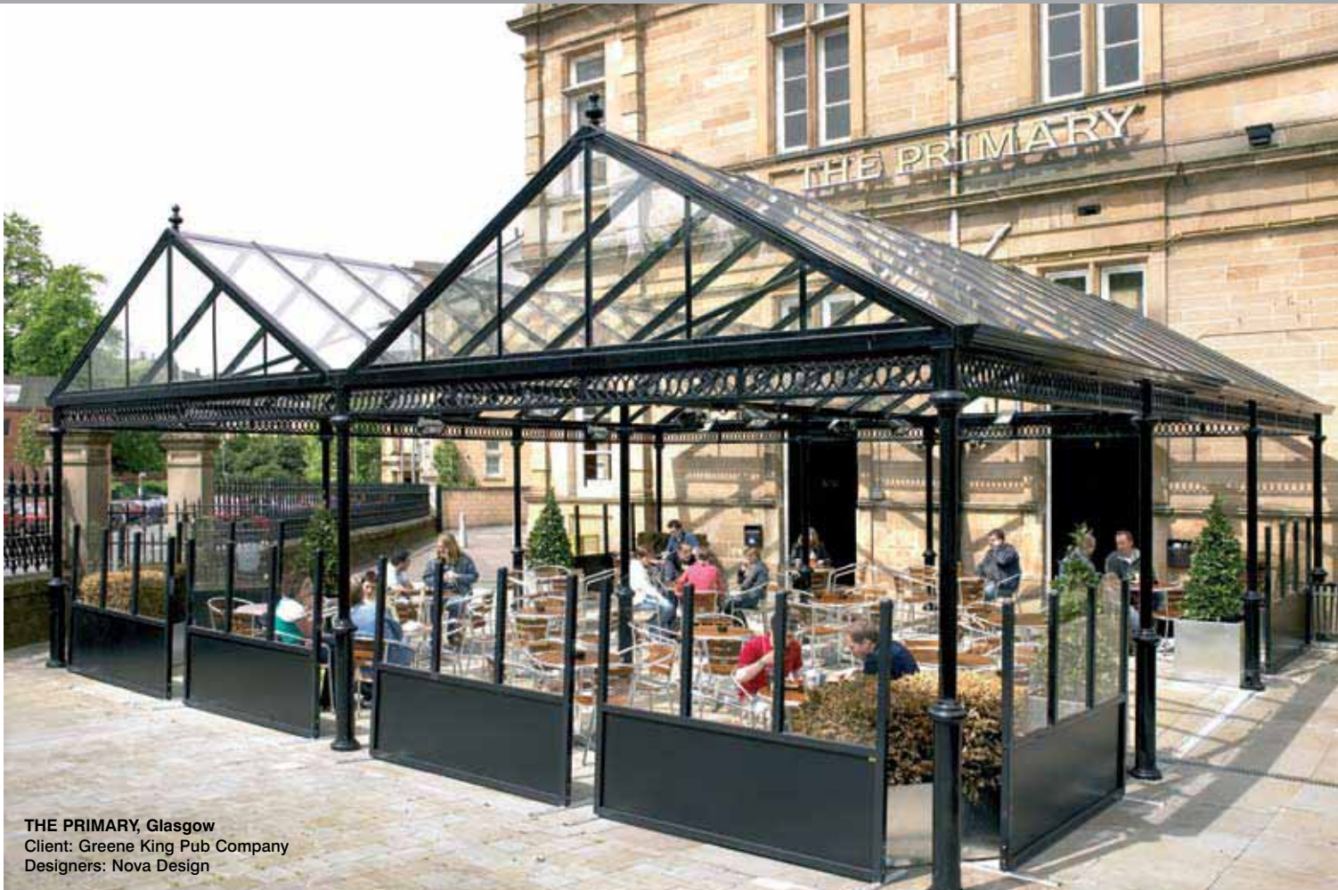
THE PRIMARY, Glasgow Client: Greene King Pub Company Designers: Nova Design