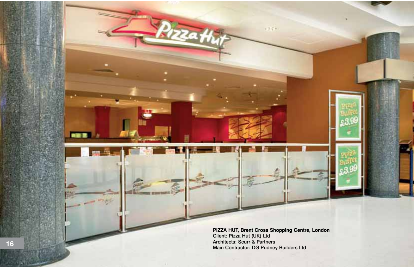
PIZZA HUT, Brent Cross Shopping Centre, London Client: Pizza Hut (UK) Ltd Architects: Scurr & Partners Main Contractor: DG Pudney Builders Ltd