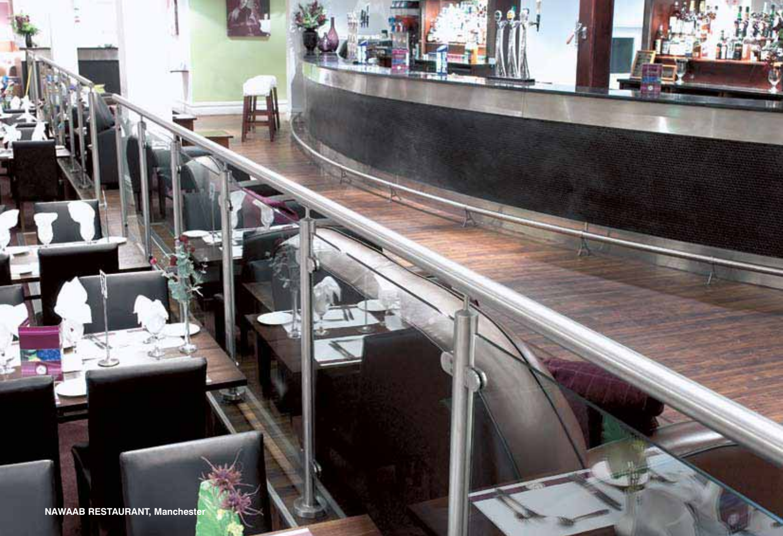
NAWAAB RESTAURANT, Manchester