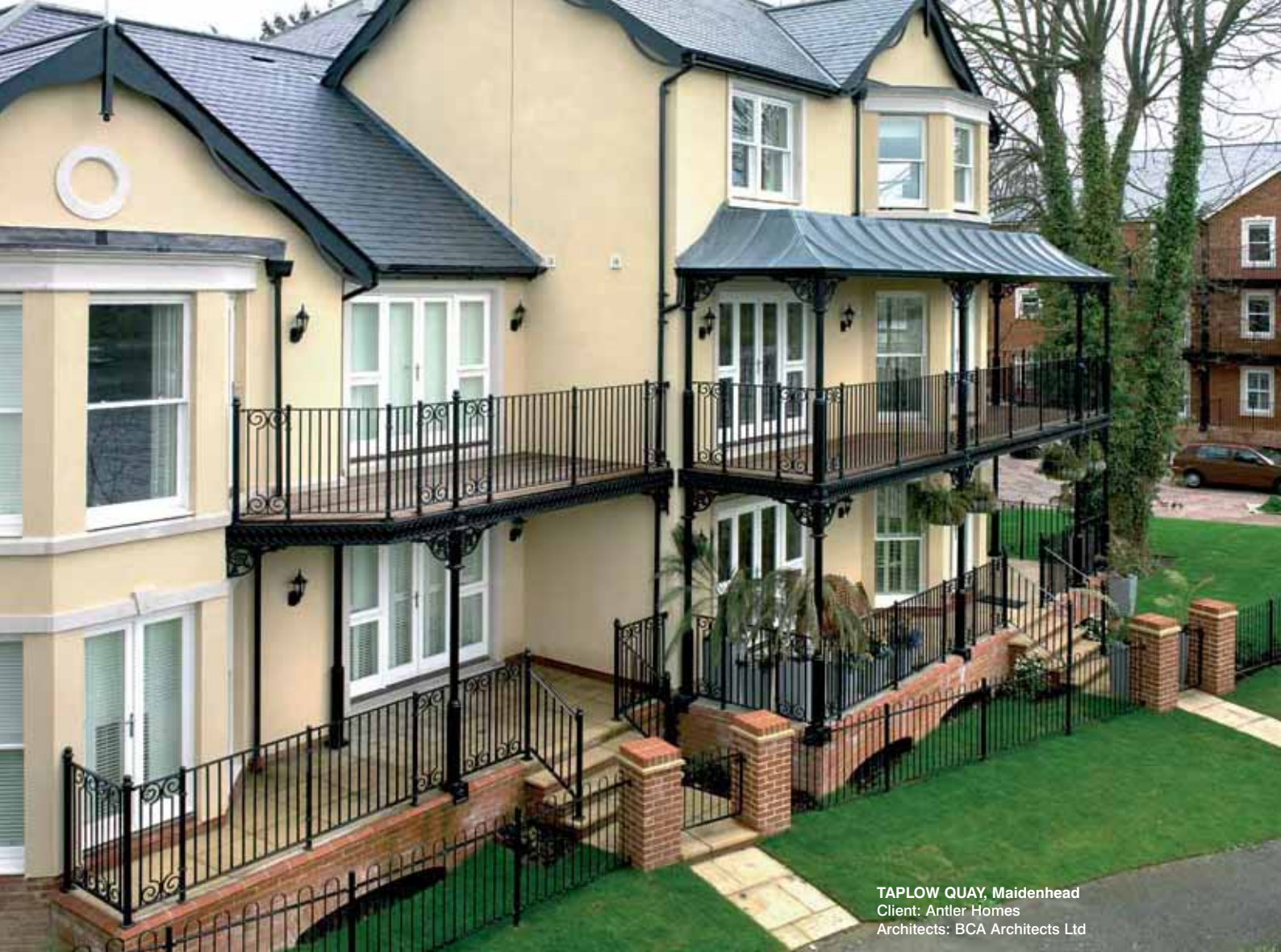
TAPLOW QUAY, Maidenhead Client: Antler Homes Architects: BCA Architects Ltd