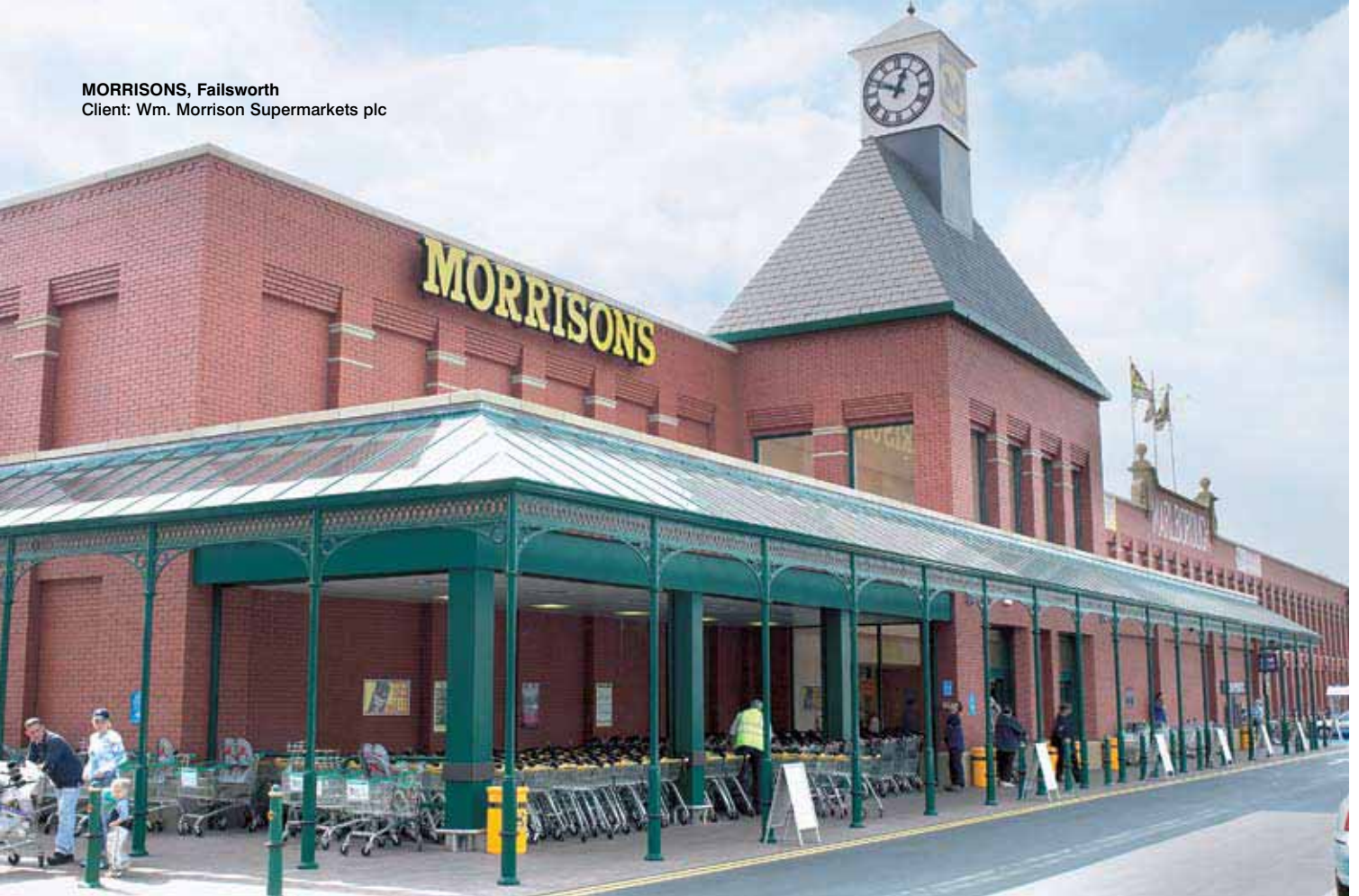
MORRISONS, Failandworth Client: Wm. Morrison Supermarkets plc