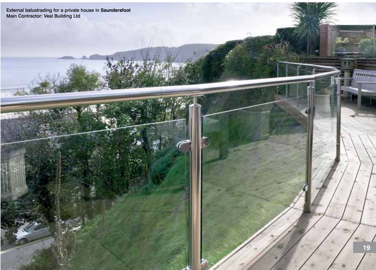
External balustrading for a private house in Saundersfoot Main Contractor: Veal Building Ltd