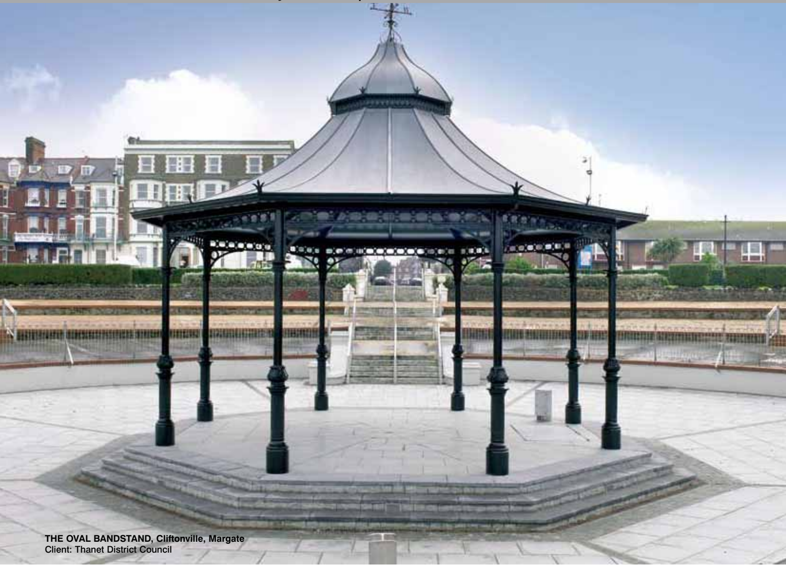
THE OVAL BANDSTAND, Cliftonville, Margate Client: Thanet District Council