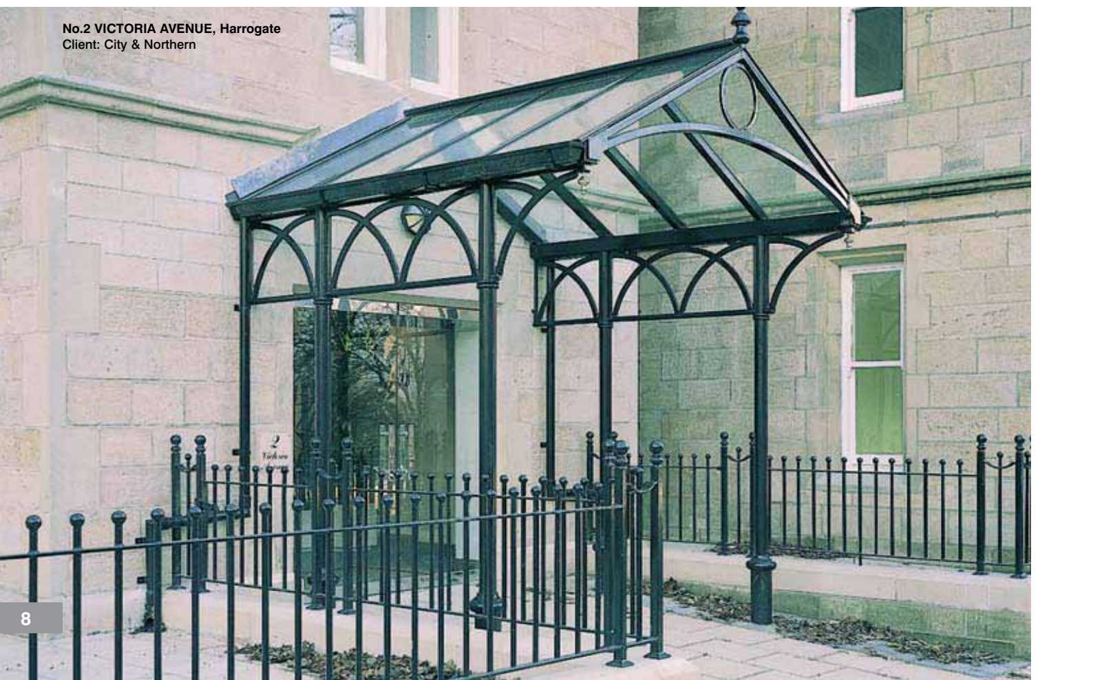
No.2 VICTORIA AVENUE, Harrogate Client: City & Northern