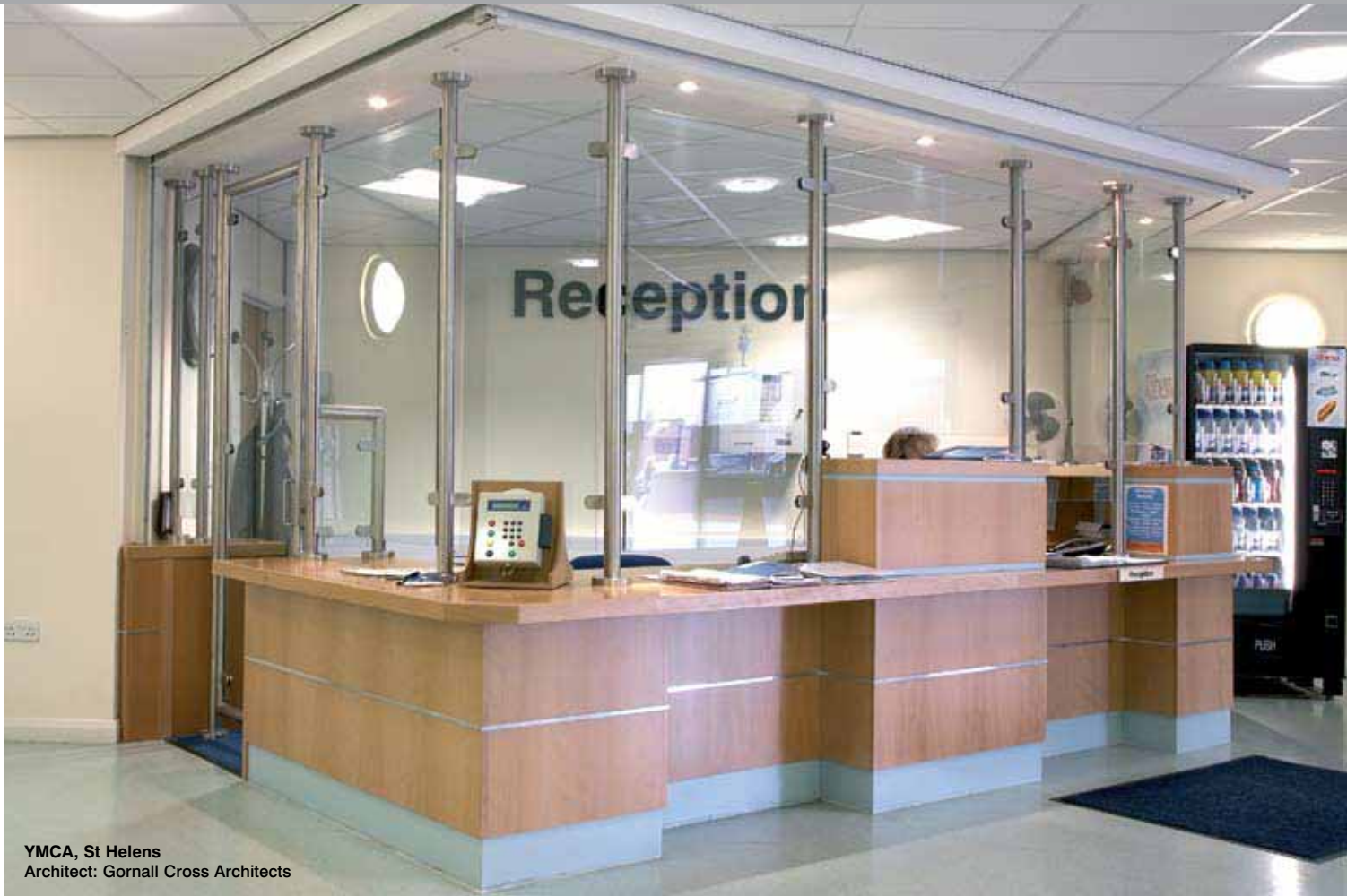
YMCA, St Helens Architect: Gornall Cross Architects