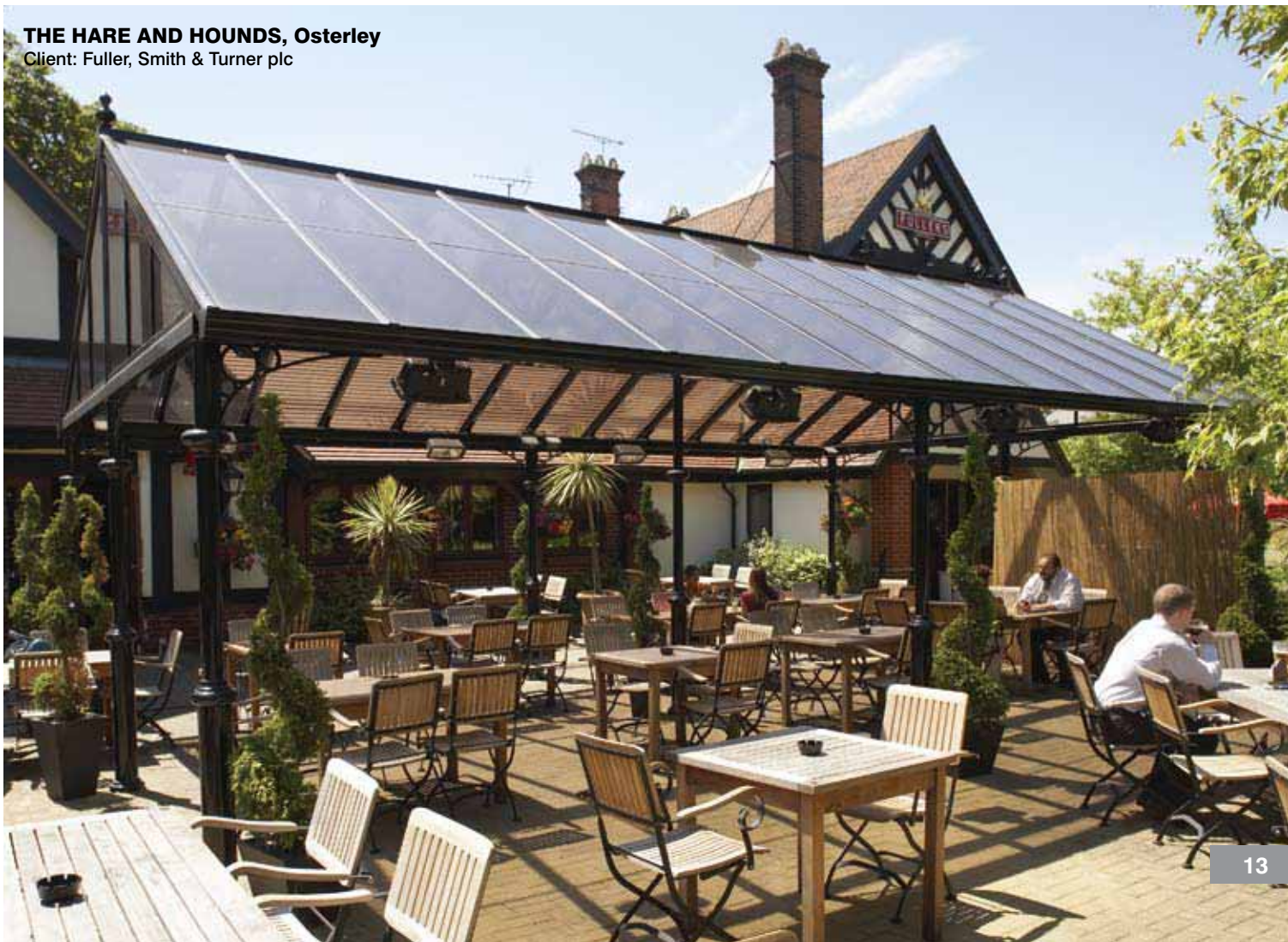
THE HARE AND HOUNDS, Osterley Client: Fuller, Smith & Turner plc