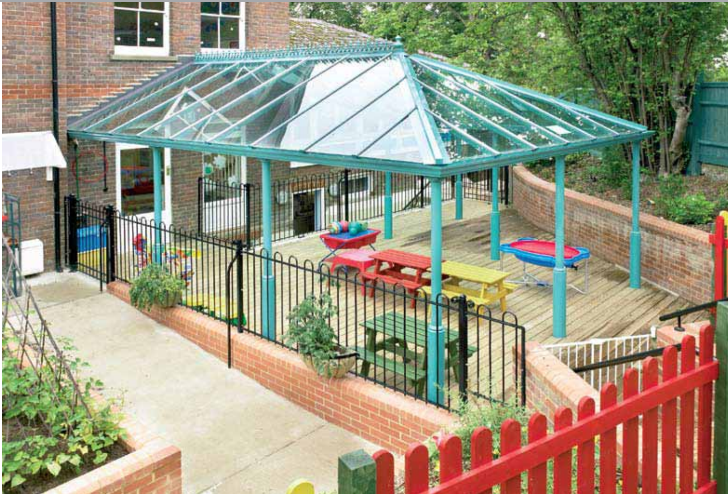
HEIRS & GRACES DAY NURSERY, Tring Architects: Elbourne Architects Main Contractor: Smith & Latimer plc