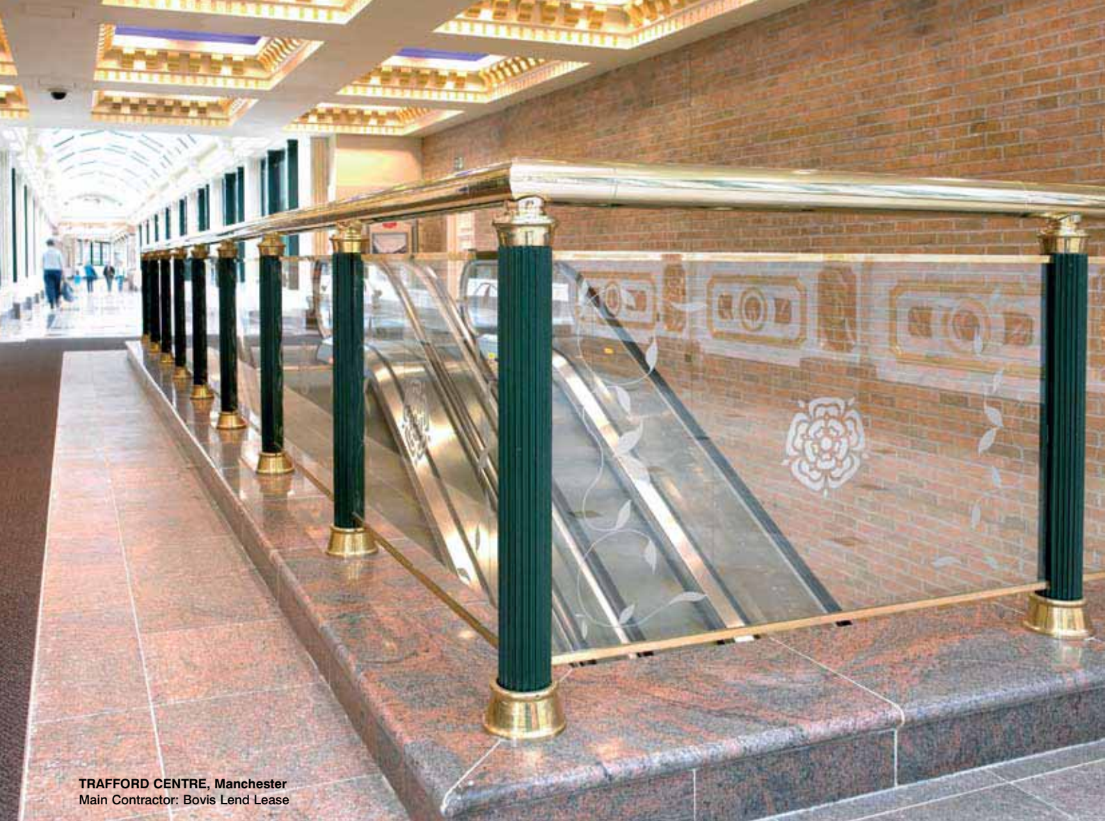
TRAFFORD CENTRE, Manchester Main Contractor: Bovis Lend Lease