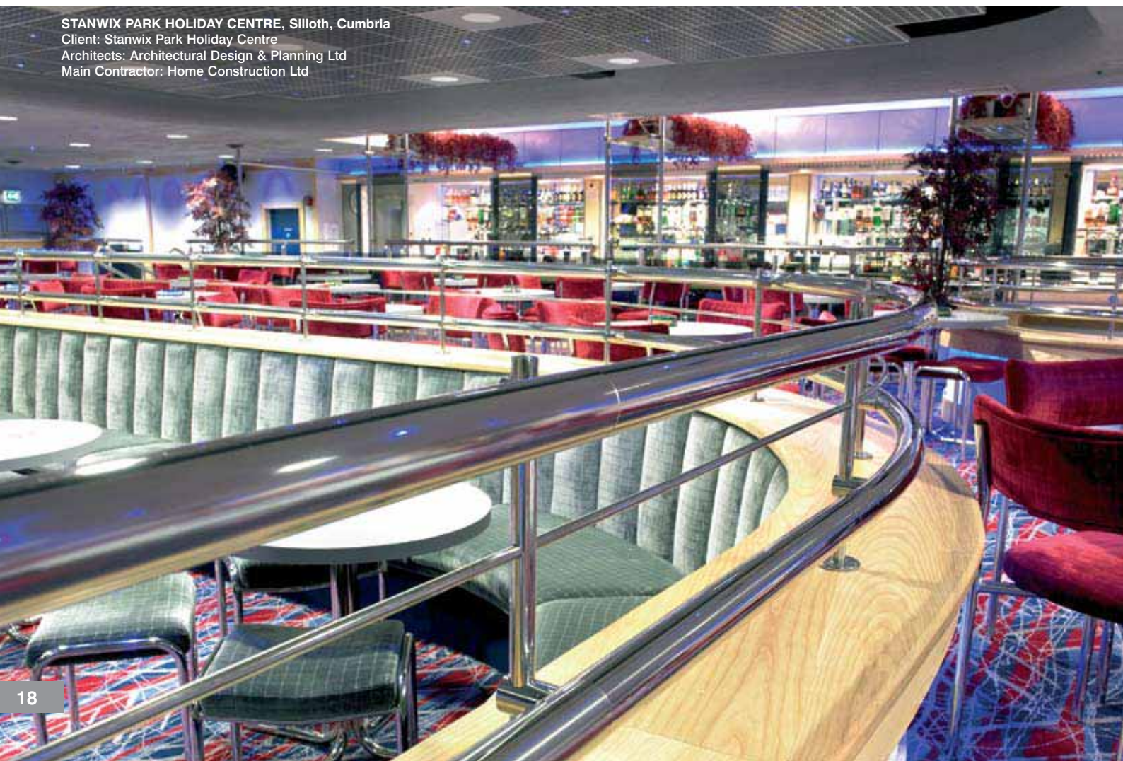
STANWIX PARK HOLIDAY CENTRE, Silloth, Cumbria Client: Stanwix Park Holiday Centre Architects: Architectural Design & Planning Ltd Main Contractor: Home Construction Ltd