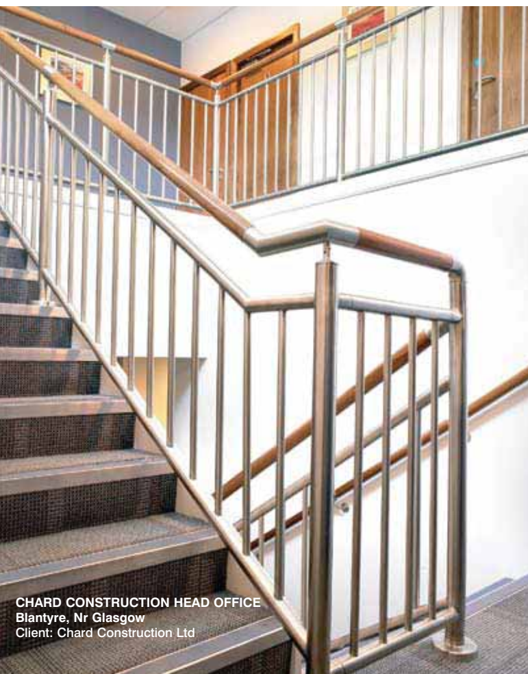
CHARD CONSTRUCTION HEAD OFFICE Blantyre, Nr Glasgow Client: Chard Construction Ltd