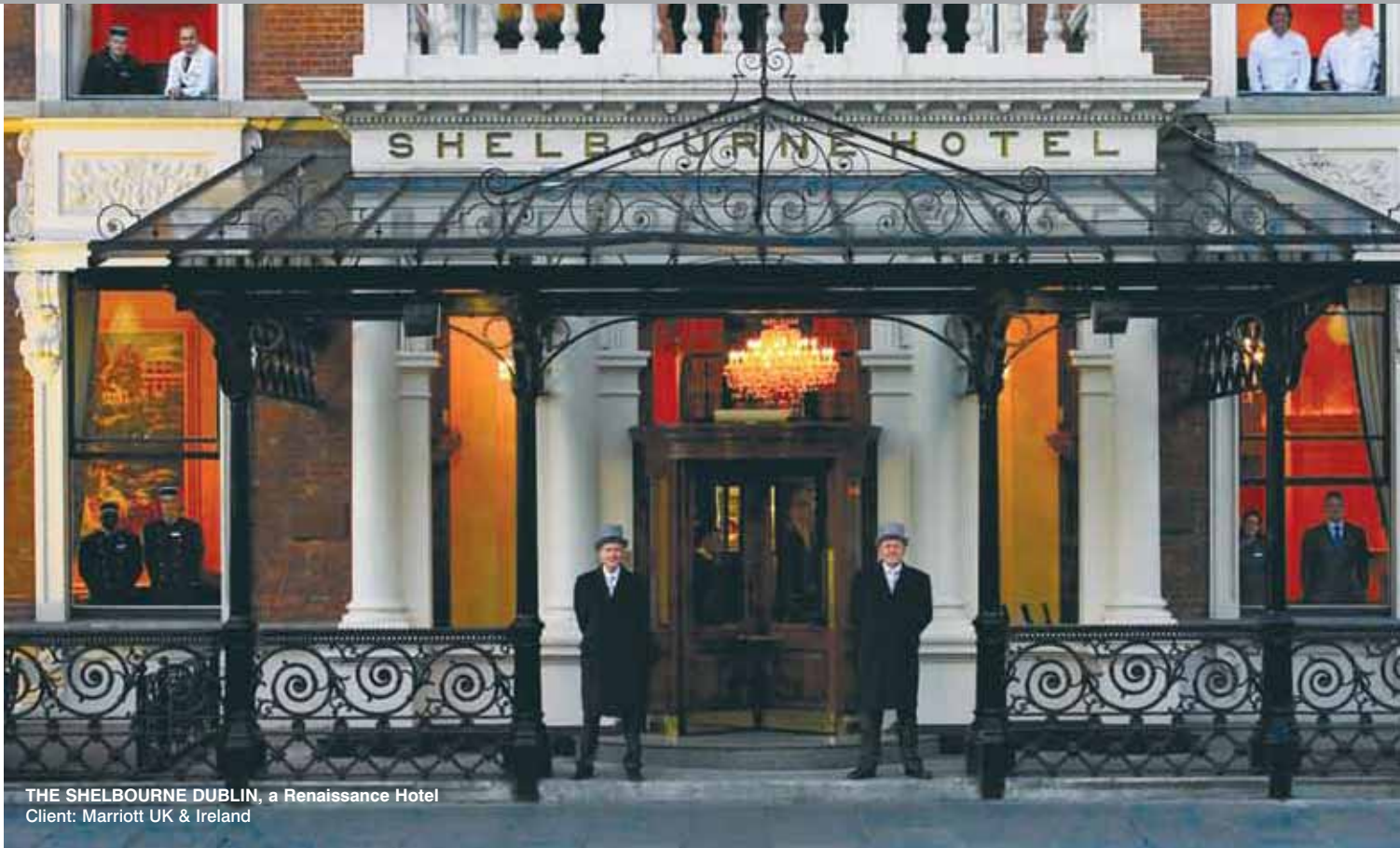
THE SHELBOURNE DUBLIN, a Renaissance Hotel Client: Marriott UK & Ireland