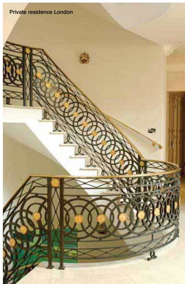
Private residence London