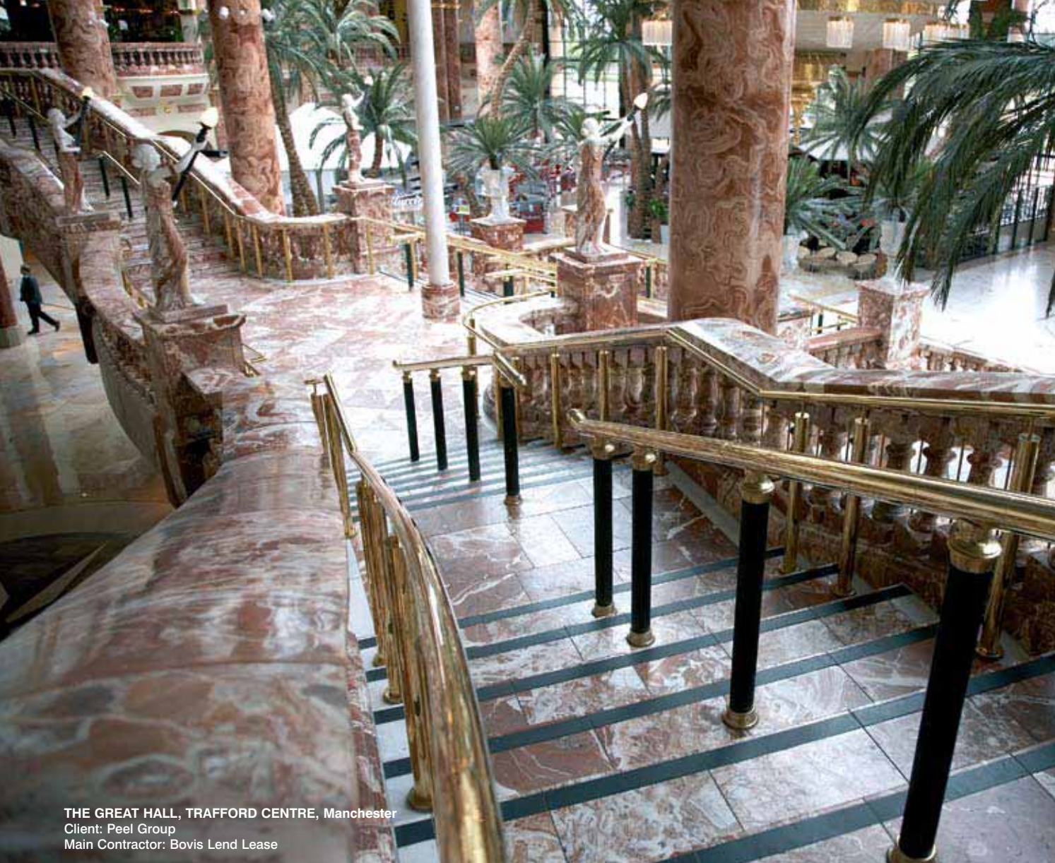
THE GREAT HALL, TRAFFORD CENTRE, Manchester Client: Peel Group Main Contractor: Bovis Lend Lease