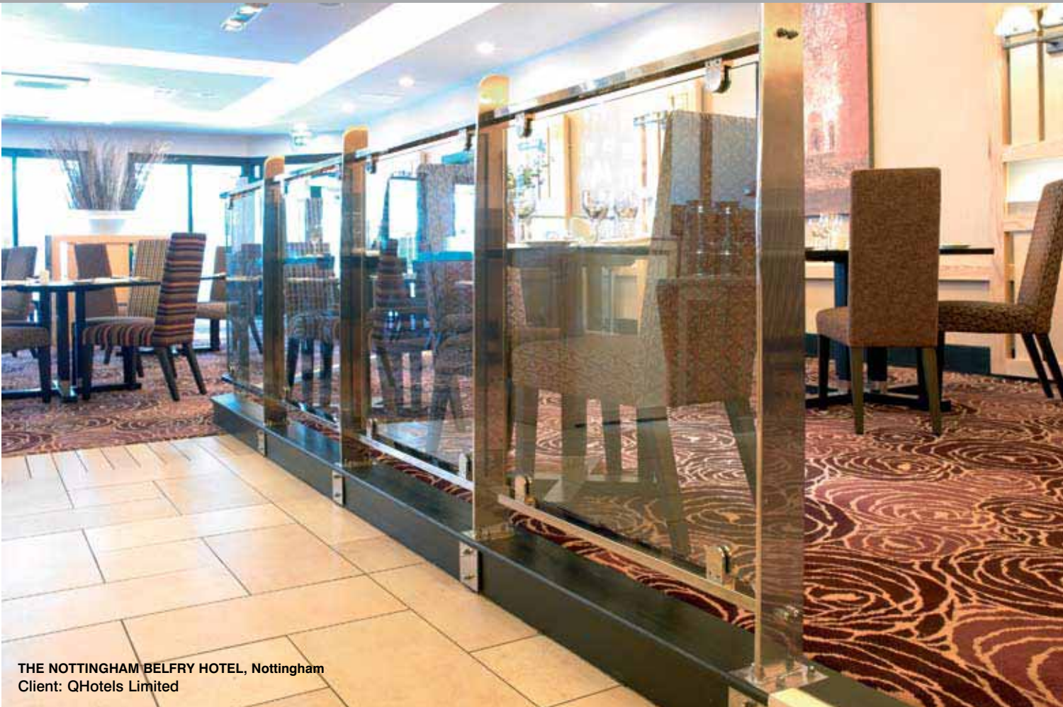
THE NOTTINGHAM BELFRY HOTEL, Nottingham Client: QHotels Limited