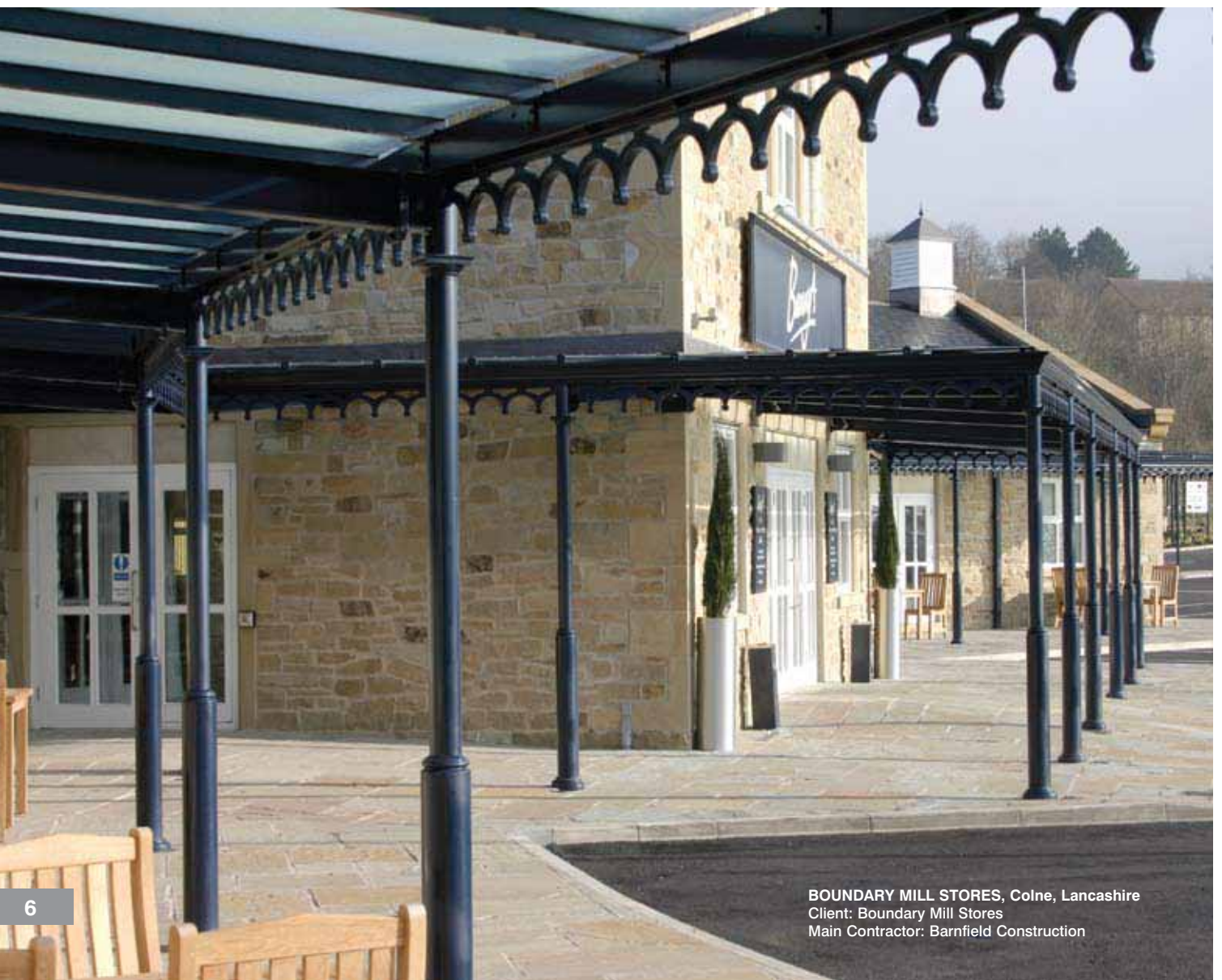
BOUNDARY MILL STORES, Colne, Lancashire Client: Boundary Mill Stores Main Contractor: Barnfield Construction