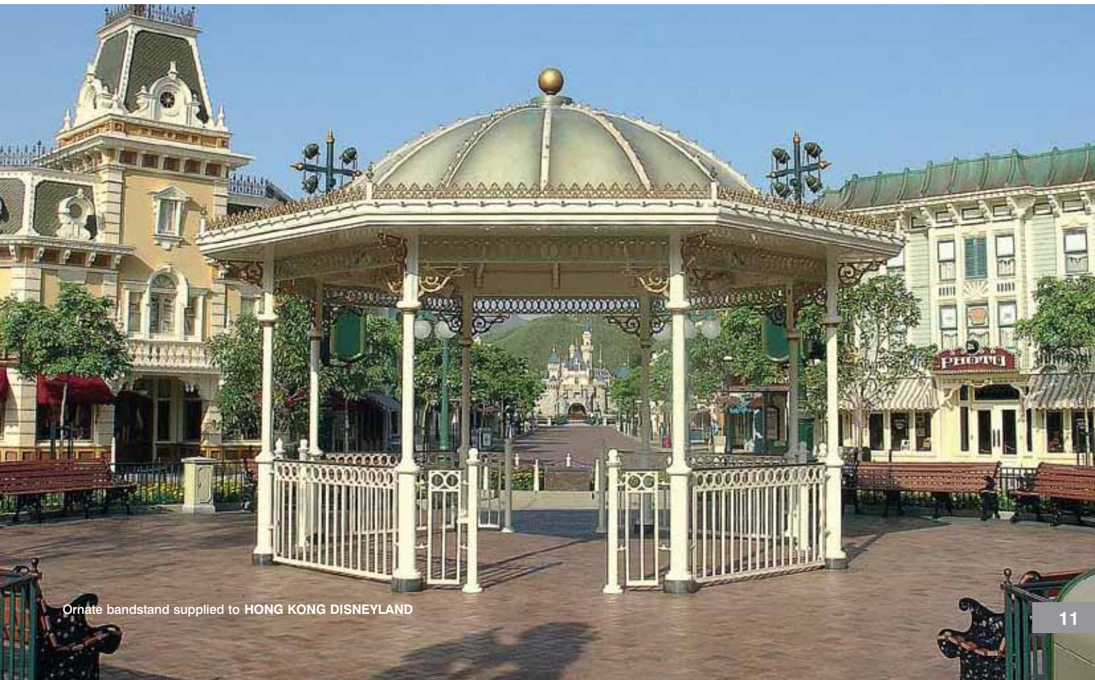
Ornate bandstand supplied to HONG KONG DISNEYLAND