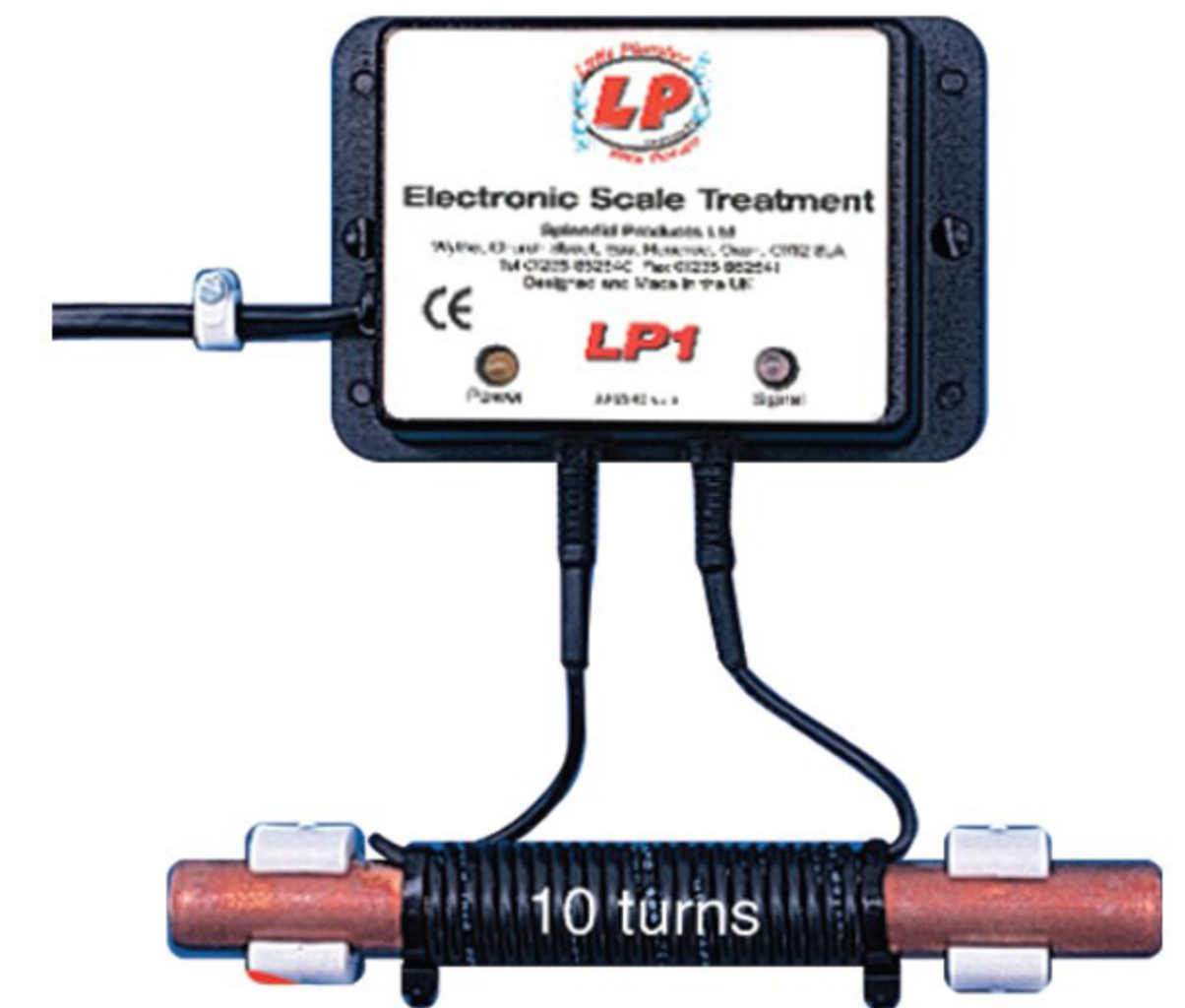
* Picture displays an LP1