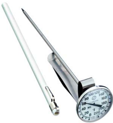
T22038/A Latte Thermometer

Tough, durable with easy to read face and clip for attaching to jugs and cups.