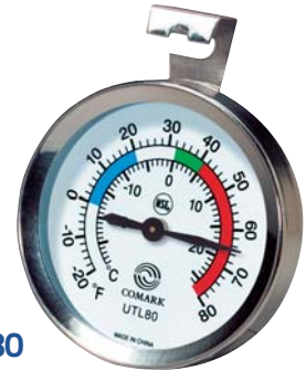
UTL80 Stick-On Fridge Thermometer