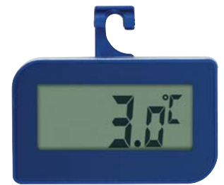
DRF1 Fridge/Freezer thermometer

Bold digital display which can hang in fridge or freezer.