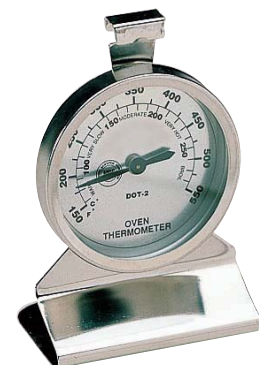
DOT2K Oven Thermometer

Easy to read bold numbers and colour coded zones for quick reference, hangs or stands.