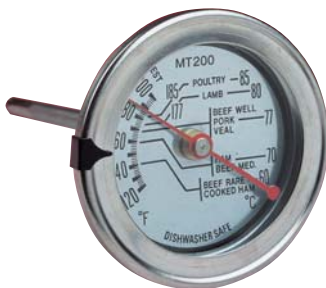
MT200K Meat Thermometer

Dishwasher safe, adjustable temperature indicator and dual range readings.