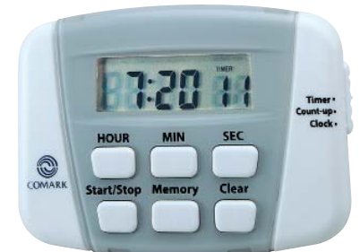
UTL882 Digital Clock/Timer

Extra large digits, with count down, buzzer, magnet and stand.