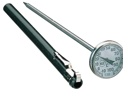
TC100 Hot Drinks Thermometer