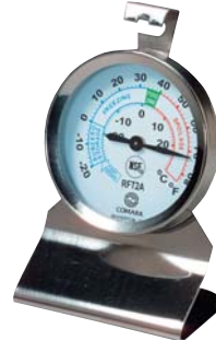
RFT2AK Fridge/Freezer Thermometer

Hangs or stands, with bold numbers and colour coded zones to show safe temperatures or possible spoilages.