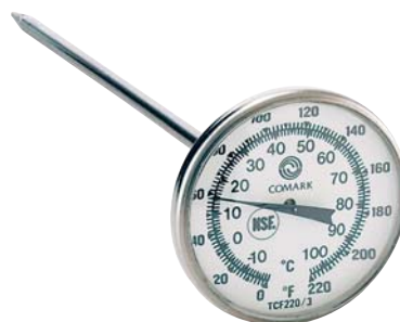
TCF220/3K Meat Thermometer