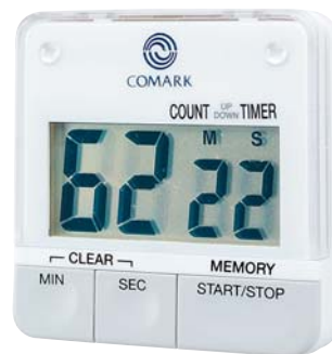
UTL264 Digital Timer

Extra large digits, with count down, buzzer, magnet and stand.