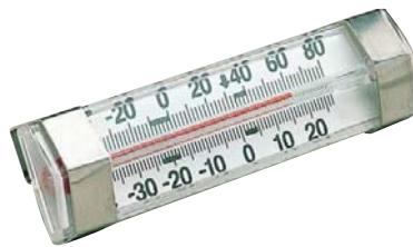
FG80AK Fridge/Freezer Thermometer

Easy to read bold numbers and dual °C/°F scale. Hangs or stands. Non-toxic, spirit filled.