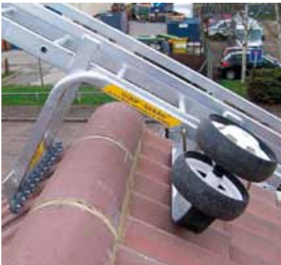
Horizontal wheels for traversing the roof

A special trolley is available as an optional extra which slides along the rails so the PV panels and materials can be safely raised to the required position. A pair of gravity operated fail-safe hooks ensure complete safety in the event of a slip.