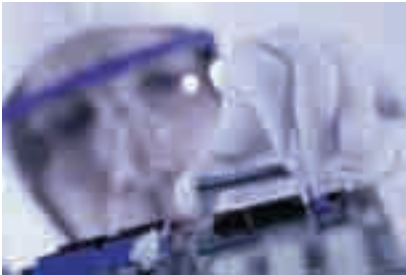
Comprehensive Testing Service

In a world where almost everybody promises quality – it is reassuring to find a company that delivers.