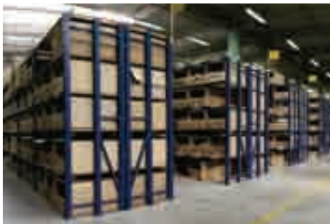
Large Stock Holdings

Cyclops hold extensive stock in their purpose built environmentally controlled storage facility ... at the last count over 100,000 line items of active, passive and electro-mechanical components, and also have 10.5 million items available, all of which can be held 'on schedule', to be delivered in accordance with your order requirements.