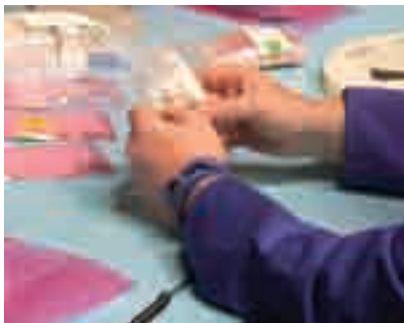
Quality and ESD Checked Shipments

We understand how important it is to get orders delivered on time and when production schedules are at stake, you can rely on Cyclops to deliver the components you need (over the last 12 months 79% of all components ordered from Cyclops Electronics are delivered within 24-72 hours of order. Even more impressive, 65% are shipped same day from Cyclops Electronics stock).