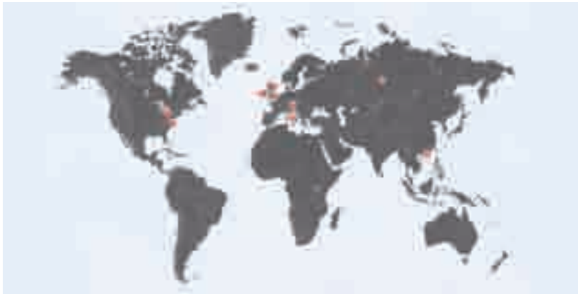
Global Network of Offices

With over 100 highly trained employees, including specialists in IT, Purchasing, Marketing, Finance, Quality and Supplier Development, which means you get the peace of mind that comes from working with one of the UK's largest and most stable independent distributors.