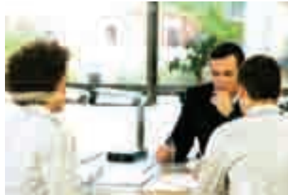
Quality Assured Global Sourcing

Our commitment to quality begins with ensuring our suppliers conform to our stringent quality requirements, this continues with a series of in-house quality checks, right through to final inspection before despatch.