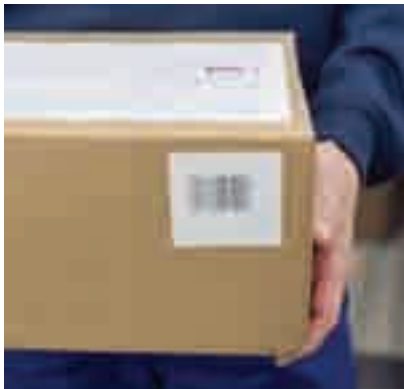
Rapid Sourcing and Delivery