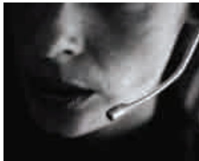
Keeping You Informed

In the rare event of a problem occurring with an order, we commit to tell you immediately and to keep you informed as we resolve the problem. Any concerns will immediately be passed on to a senior Manager to resolve ... which means you remain in full control and know exactly what is happening with your order at all times.