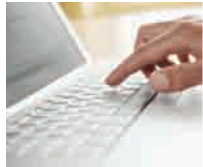
Sophisticated Search Database