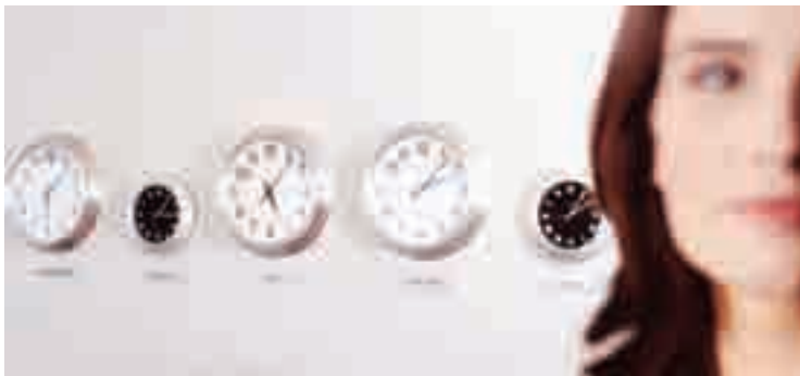
Global Sourcing Experts

Our global network of offices in England, Ireland, the USA, Canada, China, Italy, the Czech Republic and Russia means that Cyclops Electronics can source locally, quality check and ship globally which eliminates any purchasing issues with foreign suppliers.