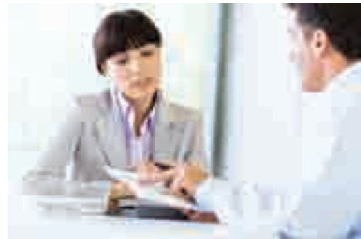
Highly Trained, Dedicated Account Managers