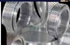
Dies and rolls for every make of pellet mill.

ANDRITZ FEED & BIOFUEL A/S Europe, Asia, and South America: andritz-fb@andritz.com USA and Canada: andritz-fb.us@andritz.com