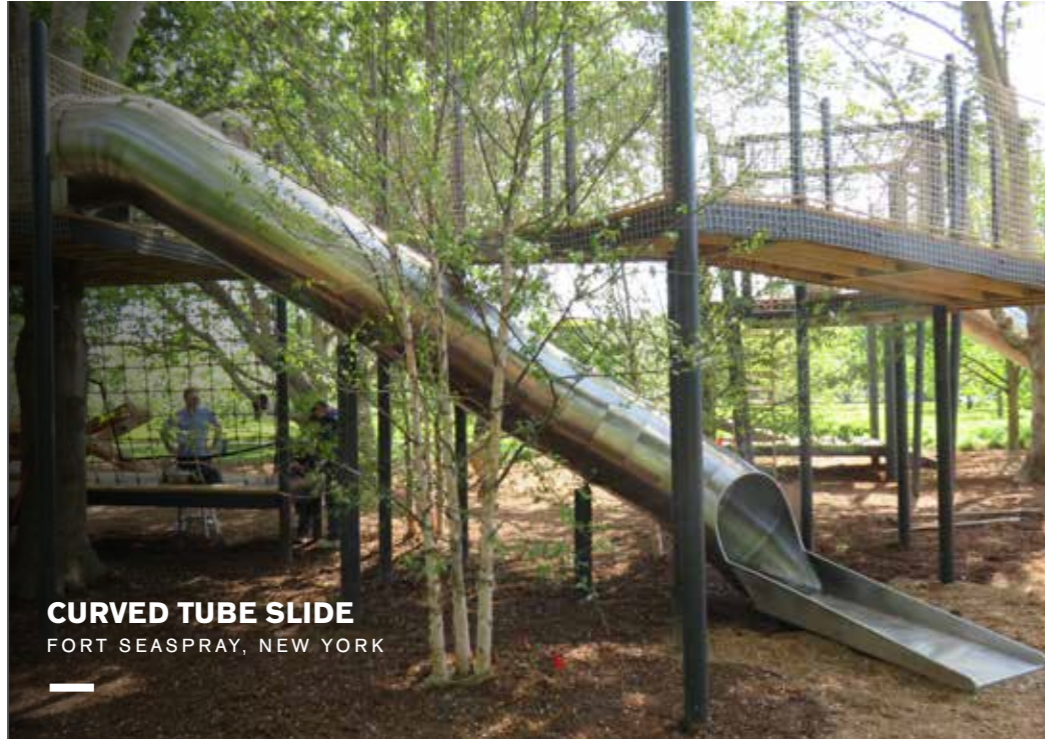
CURVED TUBE SLIDE FORT SEASPRAY, NEW YORK