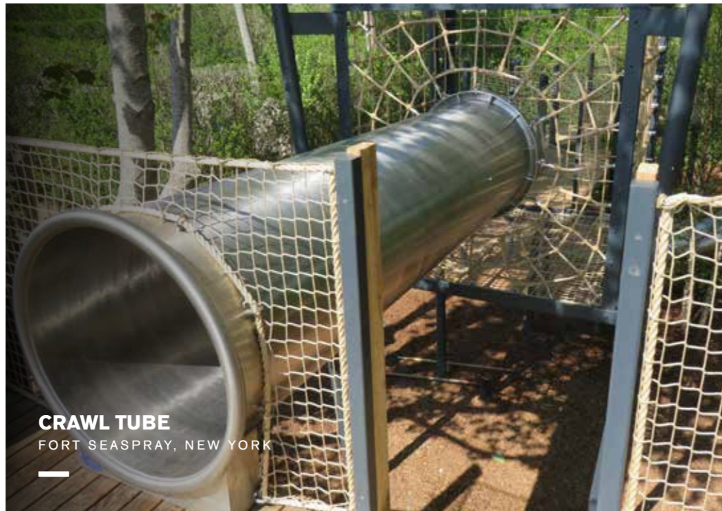
CRAWL TUBE FORT SEASPRAY, NEW YORK

The company receives regular enquiries from Europe, America and the Far East, and so far orders have been received from USA, Canada and Australia.