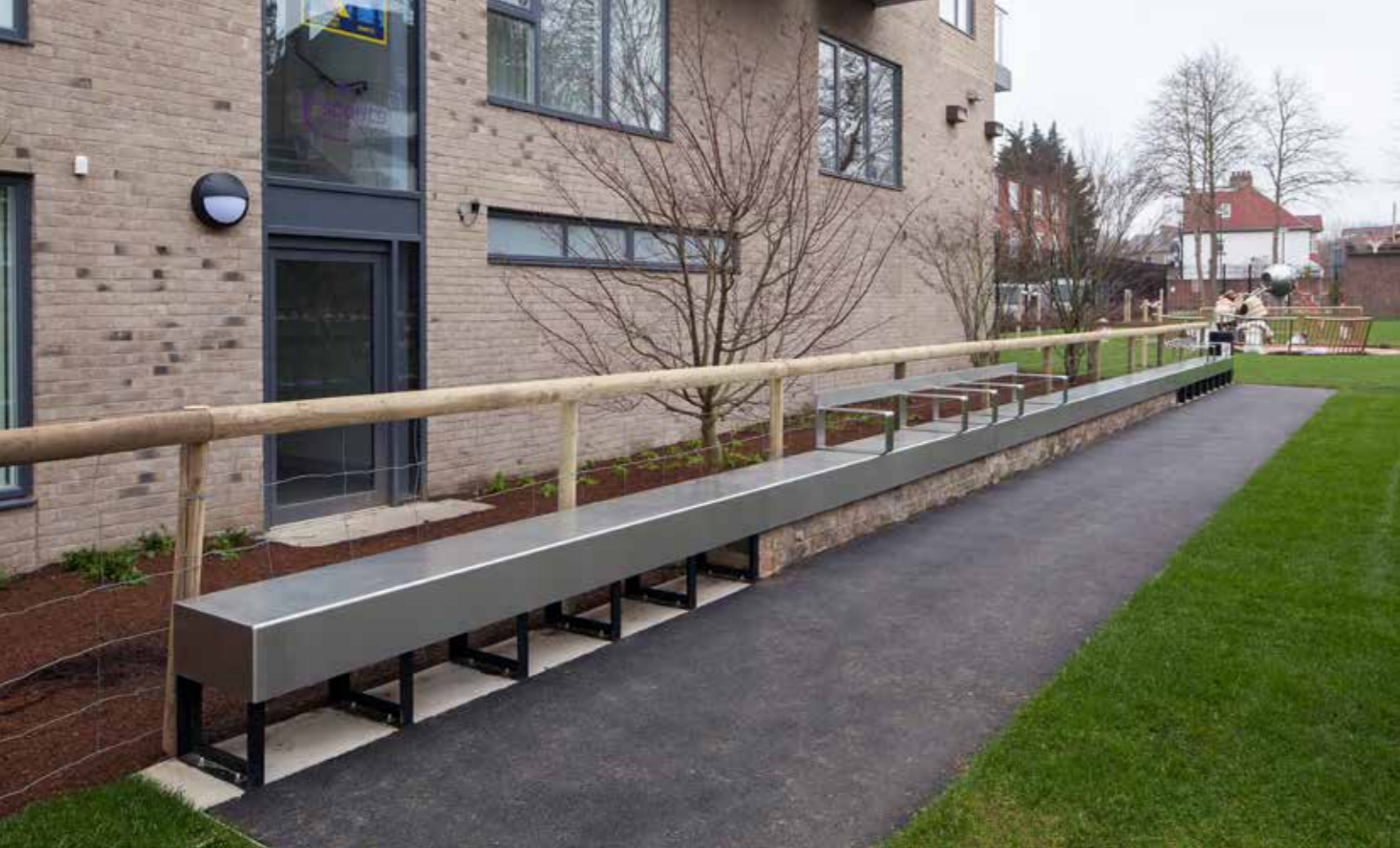
Further evidence of Steel Line's ability to work with architects and add value engineering to concept design is demonstrated by the features in this play space. Fabricated and painted mild steel support legs with stainless steel cladding extending onto an existing brick wall to form seating with a number handrails provided.