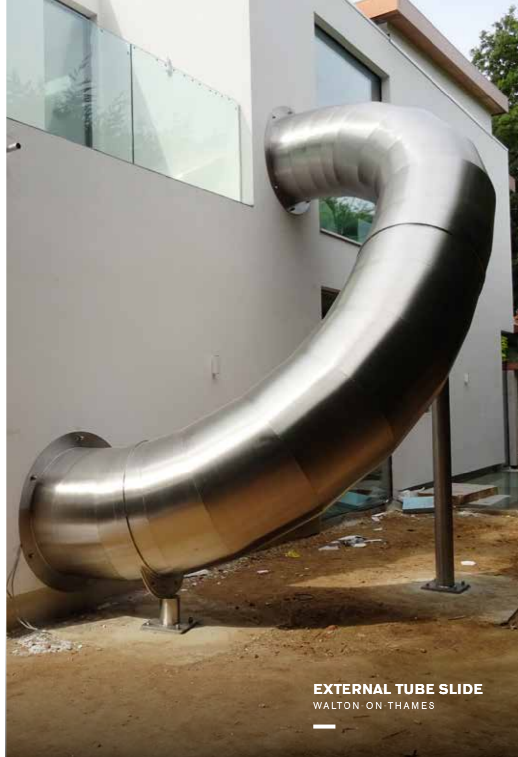
EXTERNAL TUBE SLIDE WALTON-ON-THAMES