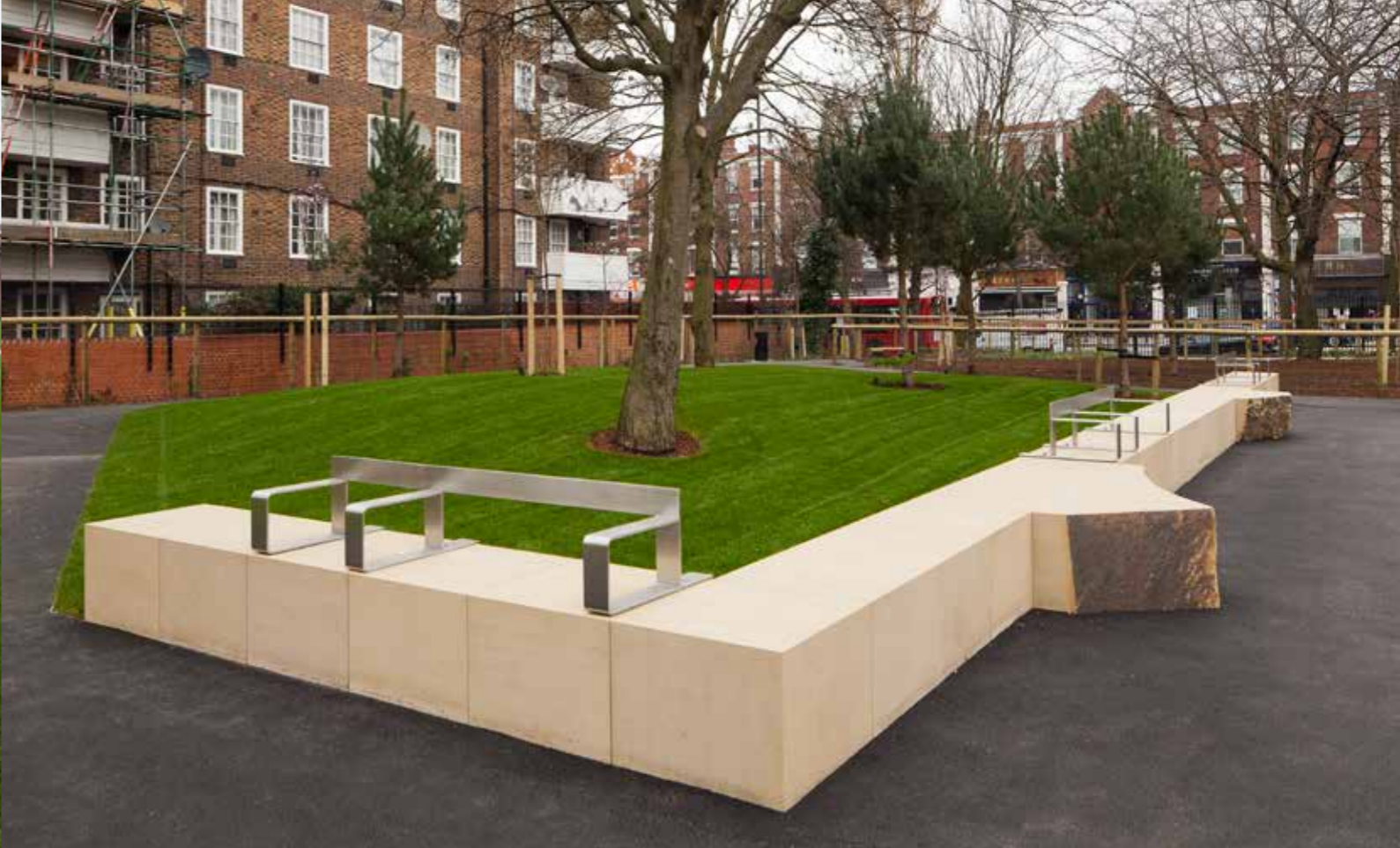
Again stainless arm and backrests welded together and bolted to in situ sandstone blocks forms a further seating and climbing feature in the same park