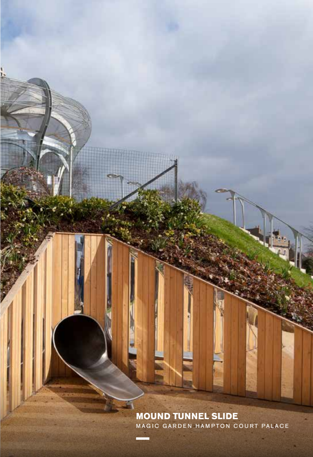
MOUND TUNNEL SLIDE MAGIC GARDEN HAMPTON COURT PALACE