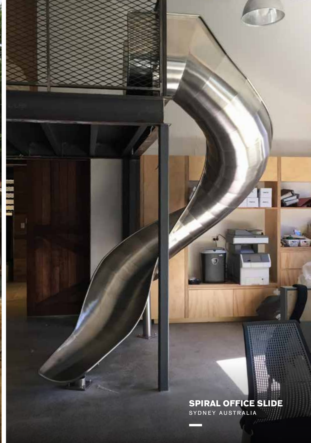
SPIRAL OFFICE SLIDE SYDNEY AUSTRALIA