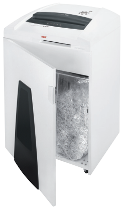
The "SECURIO P44" document shredder from HSM also shreds optical, magnetic and electronic data carriers as well as paper.

Six document shredders in this series now carry out their duties in the print rooms of The Ritz-Carlton, Berlin and Berlin Marriott Hotel. A device is easily accessible for employees on every corridor in the administration sections and at each reception. Once the document shredder's waste container is full, the employee has to empty it into the press containers from the waste disposal companies in Berlin. The provision and collection of these containers is carried out at no cost to the hotel. Following this, the city of Berlin's waste disposal company, Berlin Recycling, then take the paper away for recycling and have school books produced with the result. Their slogan for this activity is "Paper collection builds schools."