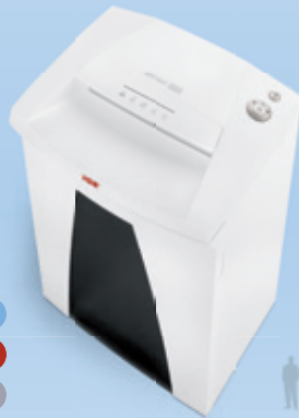
HSM SECURIO B32