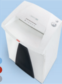
HSM SECURIO B26

The HSM SECURIO, HSM Classic and HSM Powerline document shredders are manufactured in German HSM factories – in HSM quality “Made in Germany.”