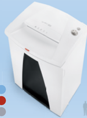
HSM SECURIO B34