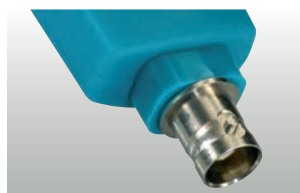
testo 206-pH3: pH3 probe head with BNC interface