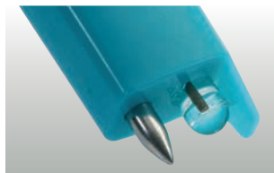
testo 206-pH1: pH1 probe head for liquids