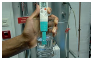
Ideally suitable for monitoring heating system water according to VDI 2035.