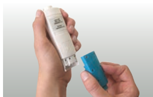
Easy exchange of probes with testo 206-pH1/-pH2/-pH3