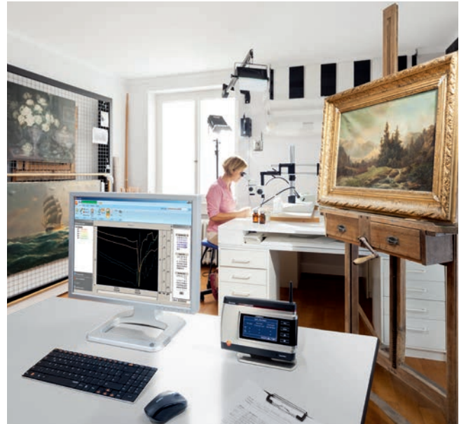
Monitoring climate during the restoration of antique paintings.

If a limit value is violated, a whole range of alarm options are available: for example, you can be informed about the undesirable deviation via an SMS or e-mail alarm and an alarm relay. Remote alarms can even be given when the system is not connected to a running PC. Even if there is a power failure, with testo Saveris data recording functions without interruption, so that the safety of your valuable objects of art is never compromised.