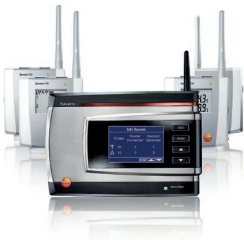
Measurement data monitoring system testo Saveris

For more information and answers to all your questions concerning climate monitoring in museums and archives, visit www.testolimited.com