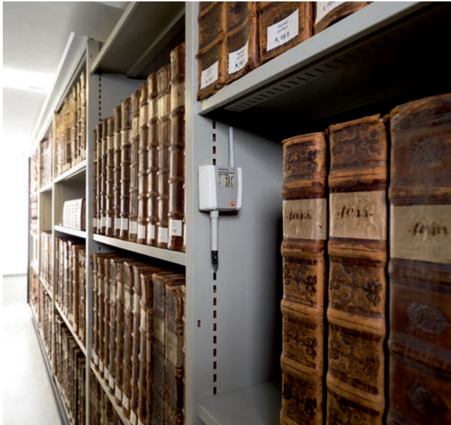
Monitoring climate in a municipal archive.