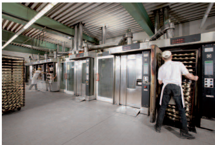
Monitoring of room climate