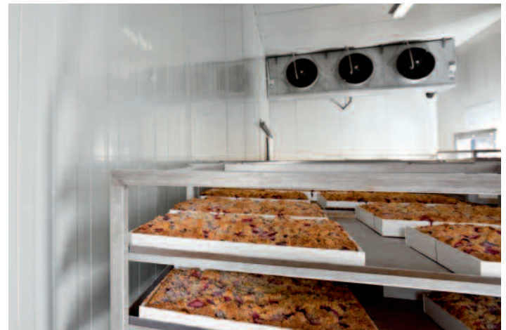
Monitoring of storage climate

The flexibly installable, robust probes of the measurement data monitoring system testo Saveris cover all areas of application. They can be used in a temperature range from -200 °C to over +1000 °C and at very high relative humidities. testo Saveris is easy to install and to operate. The ambient values can be read from the measurement probe, are transferred to the base station by wireless or LAN, stored centrally, and can be automatically summarised into clear daily, weekly or monthly reports in PDF format. If the set upper or lower limit values are violated, the system alarms by LED, SMS or e-mail. During transport to the branch stores and points of sale, the driver can conveniently read off the current measurement values in the display of the Cockpit Unit.