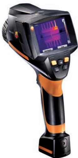
Thermal imager testo 875

Roughly 70% of all weak spots in electrical systems can be traced to faulty clamp connections. Due to aging, incorrect installation, mechanical load or damage to the system components, electrical energy is converted into heat, which can lead to dangerous overheating – with potentially catastrophic consequences: Machines can break down, production lines come to a standstill, or system components even burst into flames. Whether you wish to test transformers, electrical distribution boxes, switching systems or electric drives: Testo thermal imager models can be used on all electrical systems for localizing faulty electrical connections, for discovering asymmetrical load distribution or for identifying overload conditions of any kind.