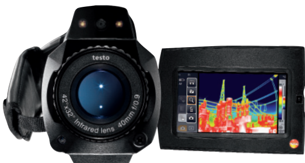
Thermal imager testo 890

With the high-resolution thermal imager testo 890, these sources of malfunction can be quickly and precisely identified before they become serious problems endangering the reliability of supply. The wide-angle lens of the imager quickly provides a meaningful overview of the overall status of the plant being tested. In order to assess distant measurement objects precisely, the telephoto lens is recommended. It reliably and precisely measures objects with a size of 19 mm from a distance of 15 m. Anomalies, so-called hotspots, are identifiable from a size of approx. 6 mm. This allows the smallest cable ruptures or warming in circuit breakers, for example, to be evaluated from a safe distance. The large fold-out, rotatable display of the testo 890 allows overhead imaging work, and in combination with the rotating, ergonomic grip, the imager can be confidently handled even in difficult-to-access places. Finally, the status of the system being tested can be professionally documented using the intuitive evaluation functions and the easy report creation of the analysis software IRSofT.